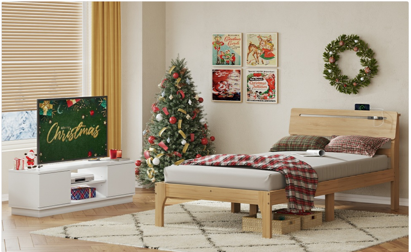
Image 3.1: The fully assembled WLIVE TV stand, ready for use in a living room environment.