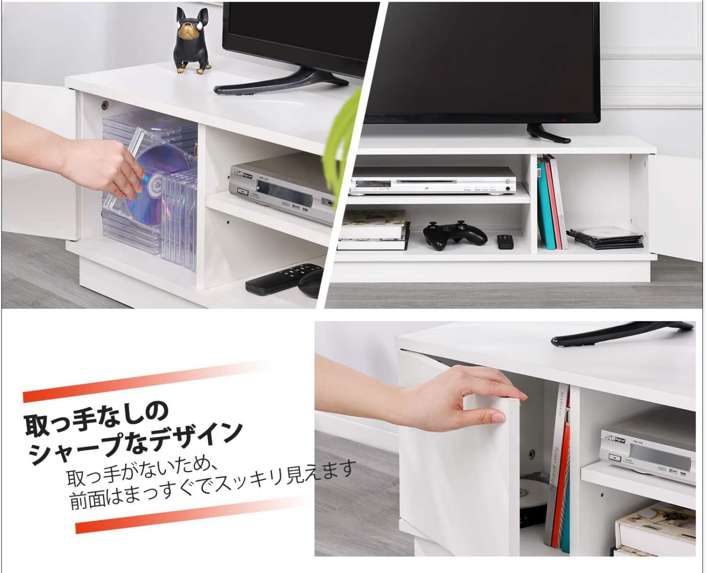
Image 4.2: Demonstrates the practical use of the TV stand's storage, including space for media collections and gaming equipment.