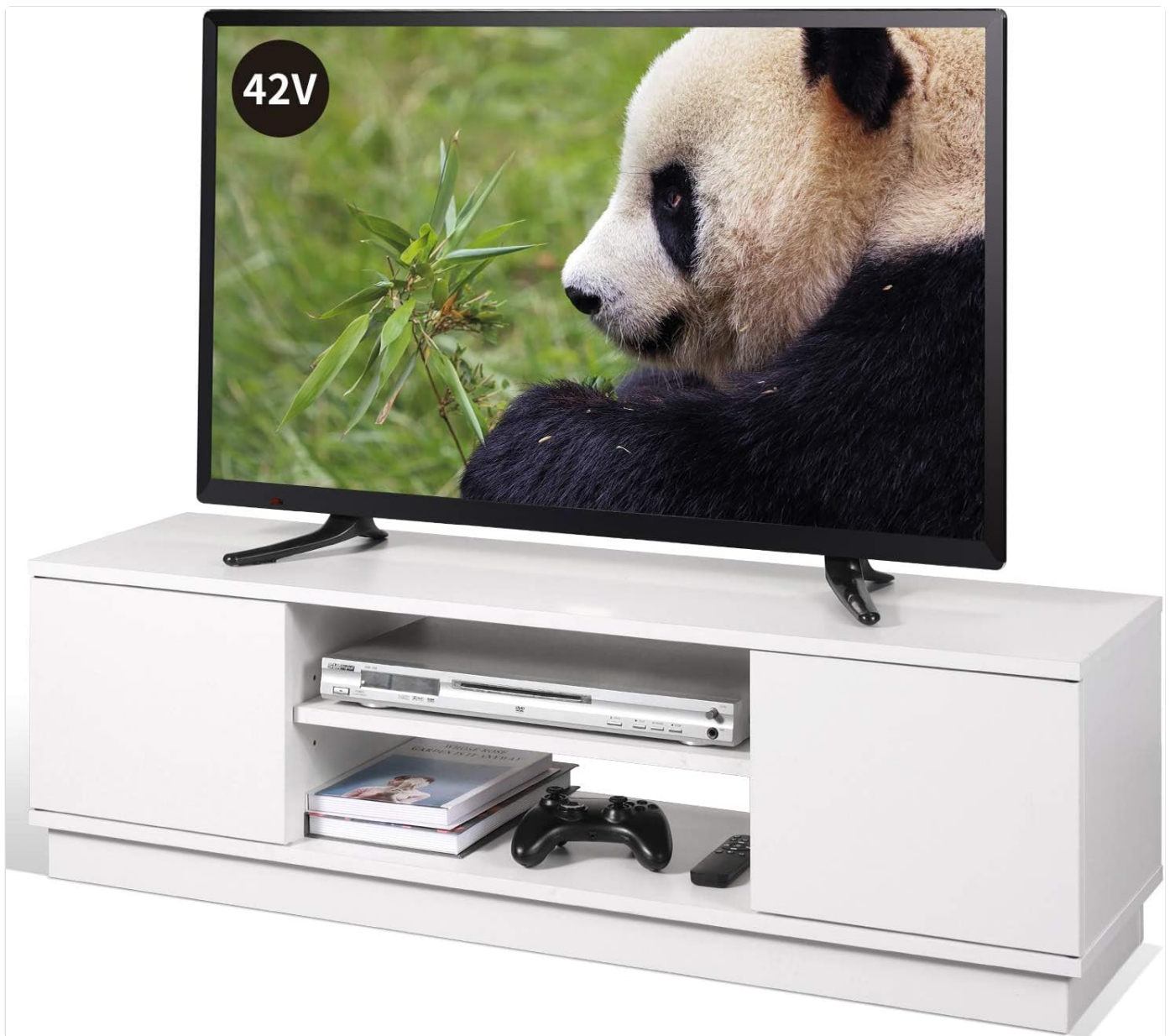
Image 1.1: The WLIVE Low-Type TV Stand in white, featuring a TV with a panda image. This stand is designed for modern living spaces.