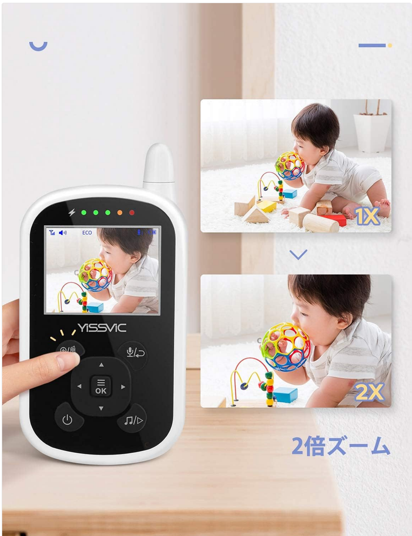
Image: 2x Digital Zoom function.