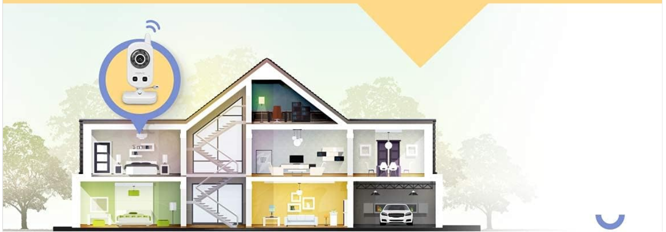
Image: Two-Way Audio feature in use.