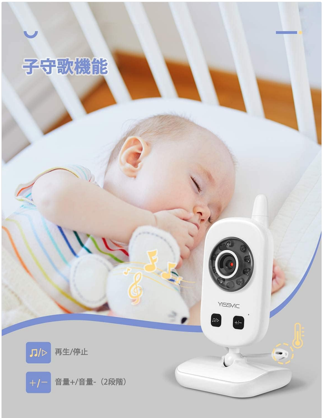
Image: Lullaby feature in action.