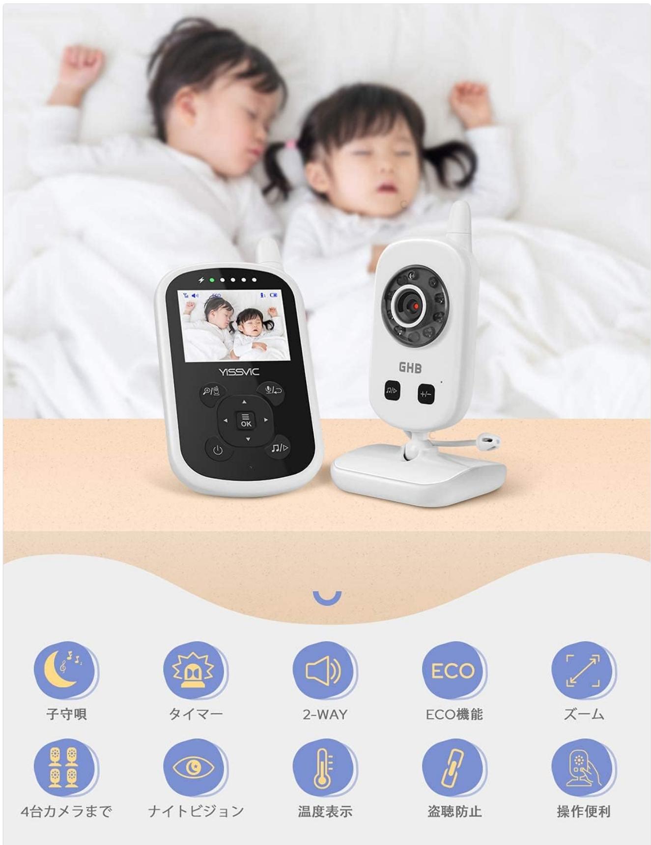
Image: Overview of features including multi-camera support.