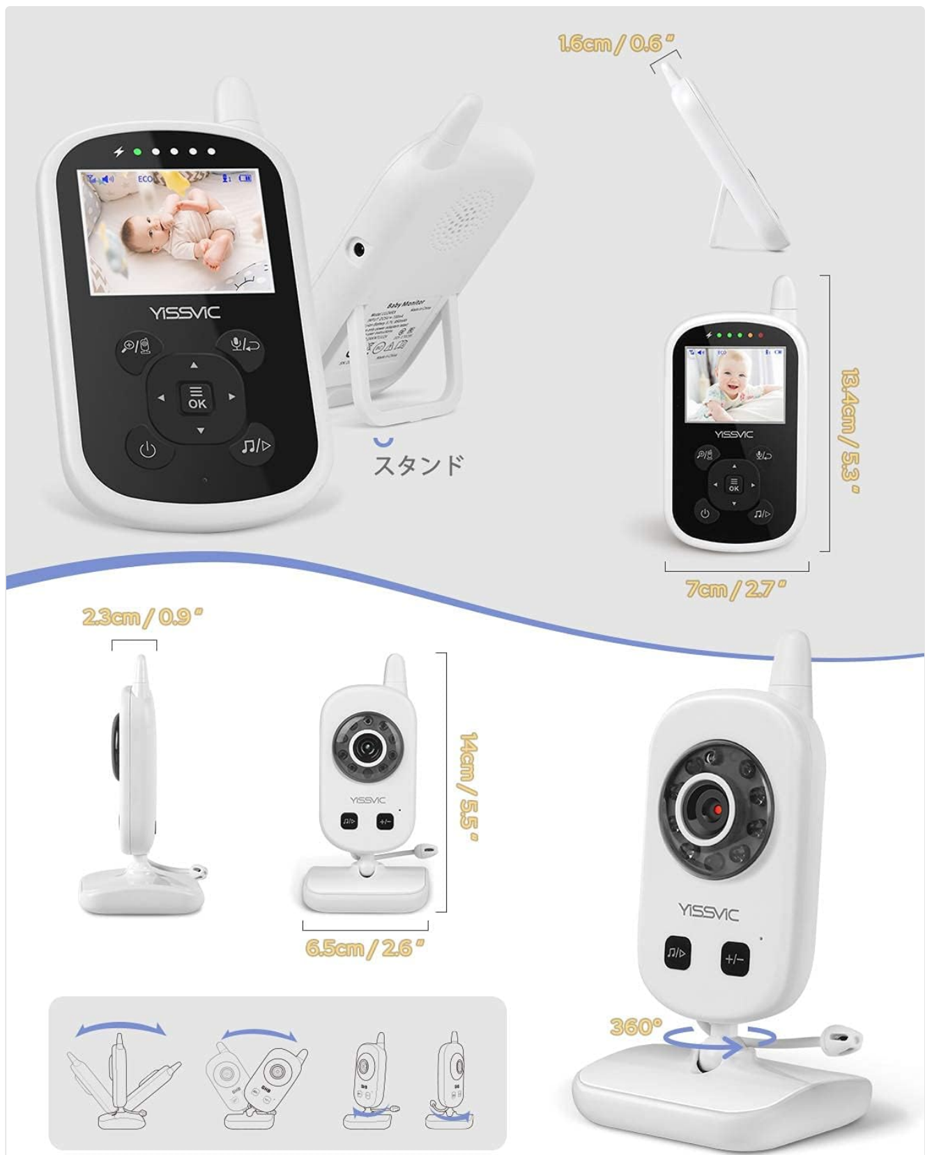
Image: Camera and Monitor Dimensions with 360° Adjustable Camera Angle.