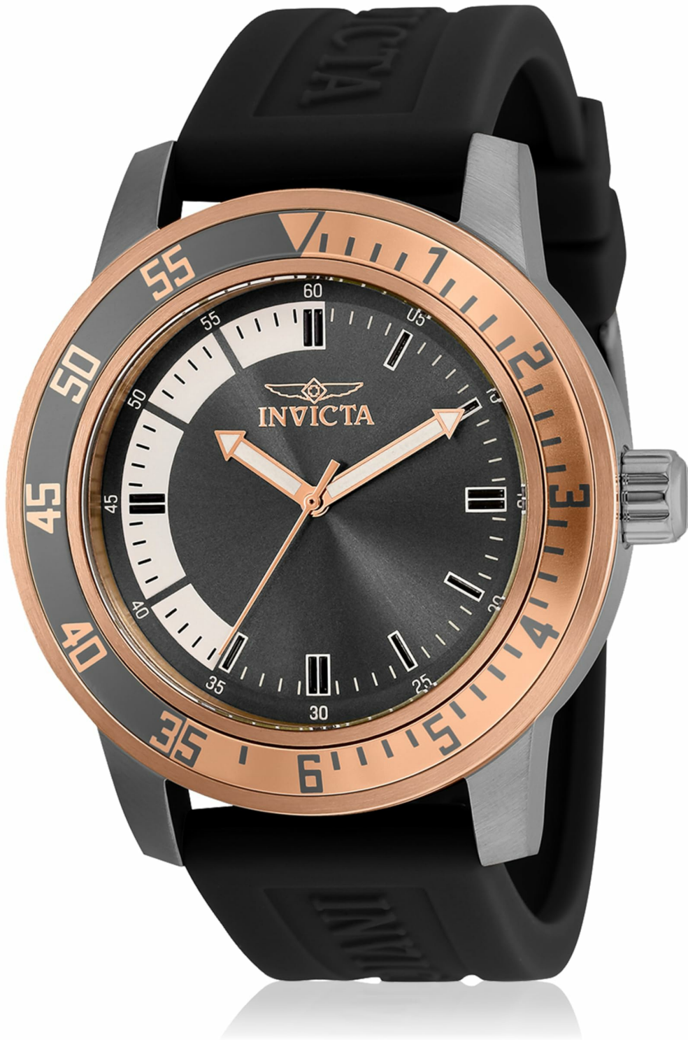
Image: A close-up view of the Invicta Men's Specialty Watch Model 35687 being worn on a wrist, showcasing its gunmetal case, black dial, and silicone band, illustrating typical watch wear.