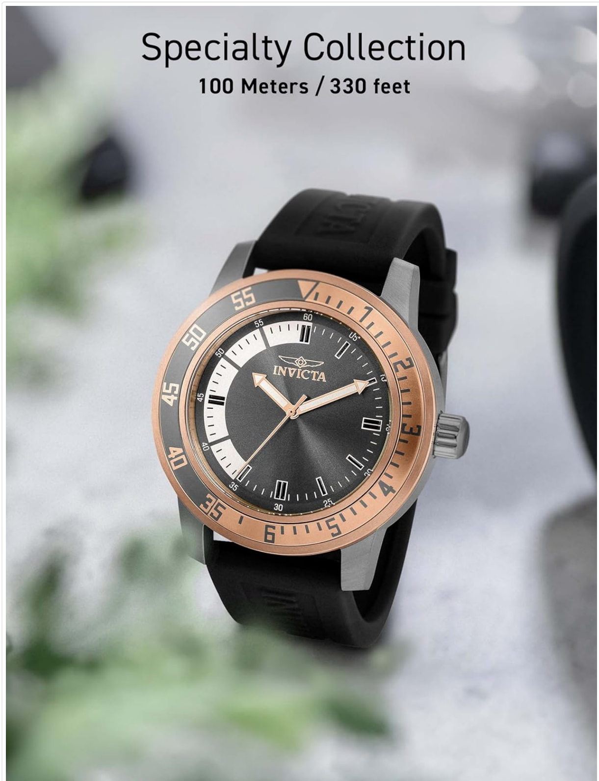
Image: The Invicta Specialty Watch 35687 displayed with a background suggesting water, emphasizing its 100-meter water resistance capabilities.