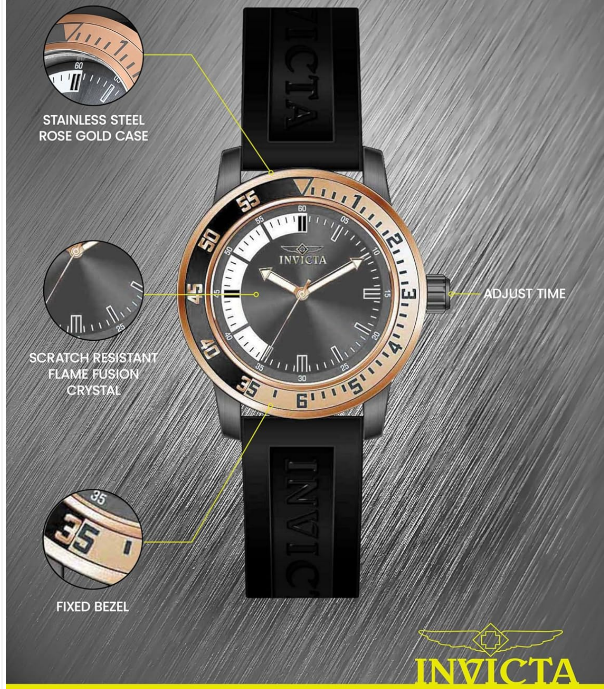
Image: An exploded view diagram highlighting specific features of the Invicta Specialty Watch 35687, such as the stainless steel rose gold case, scratch-resistant Flame Fusion crystal, fixed bezel, and crown for time adjustment.