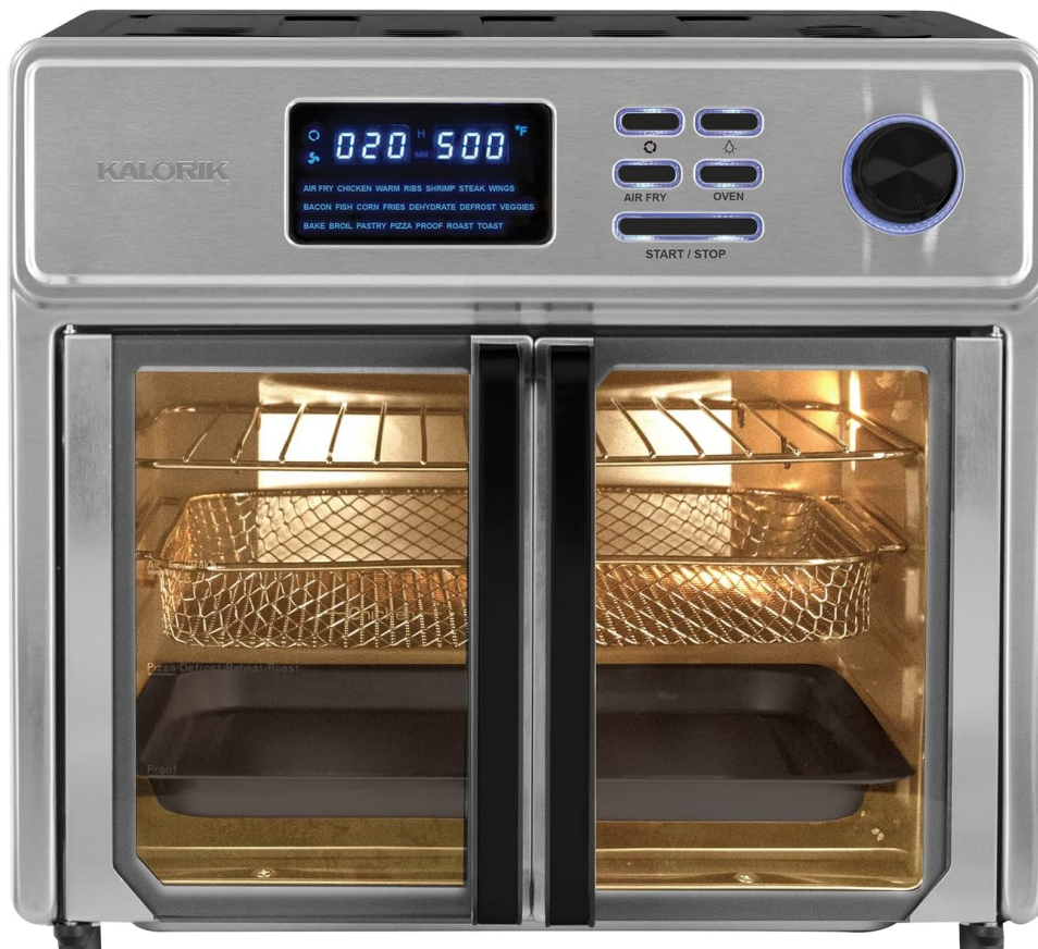
Image: Interior view of the Kalorik MAXX Air Fryer Oven, showing the air frying baskets and lower tray in place.