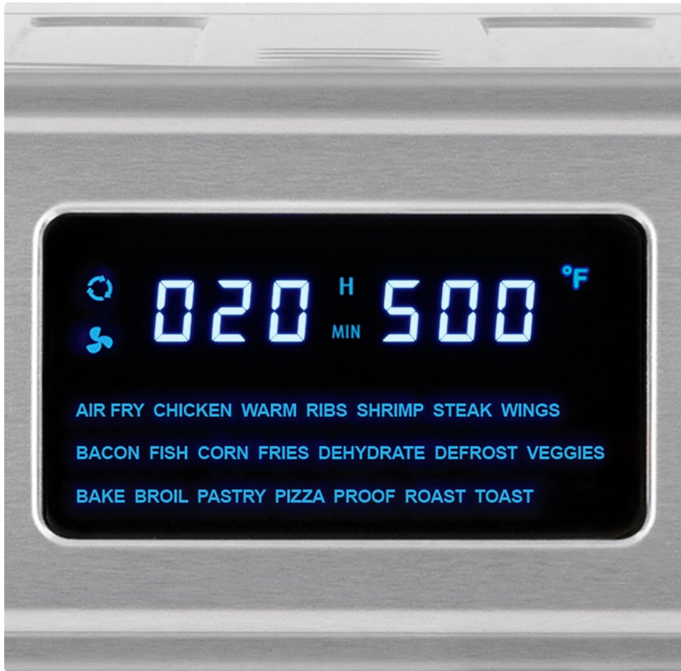
Image: Close-up of the Kalorik MAXX Air Fryer Oven's digital control panel, showing the display, function buttons, and rotary knob.

The digital control panel provides intuitive access to all cooking functions and settings.