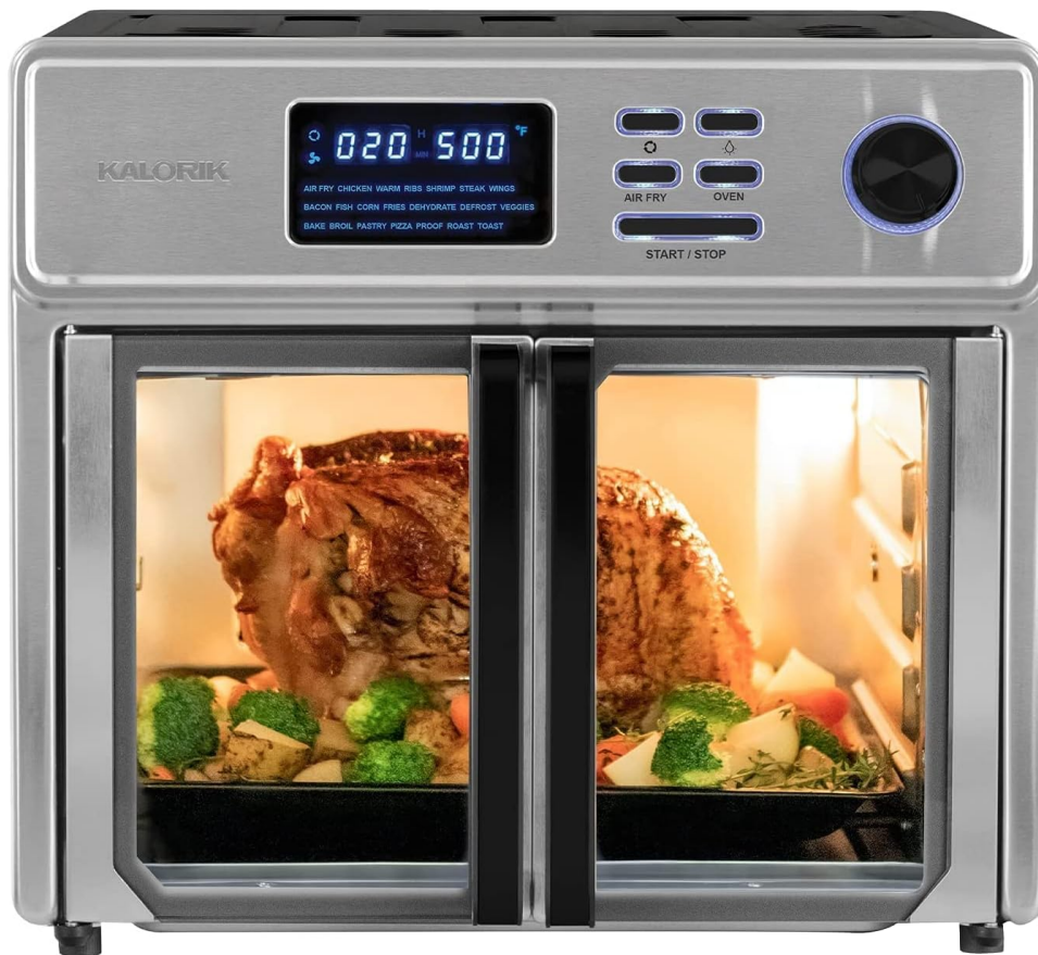
Image: Front view of the Kalorik MAXX Air Fryer Oven, showcasing its digital display and French doors.