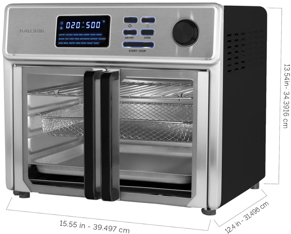
Image: Side view of the Kalorik MAXX Air Fryer Oven with dimensions indicated: 13.54 inches (34.39 cm) height, 15.55 inches (39.49 cm) width, and 12.4 inches (31.49 cm) depth.

Understanding the dimensions of your appliance is crucial for proper placement in your kitchen.