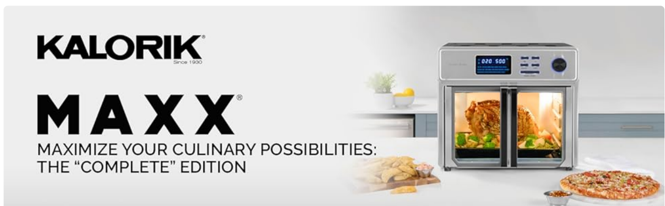
Image: Kalorik MAXX Complete Digital Air Fryer Oven overview.

Your Kalorik MAXX comes with 14 deluxe accessories and a hardcover cookbook featuring 60 chef-inspired recipes, providing endless culinary possibilities. Please read this manual thoroughly before first use to ensure safe and optimal operation.