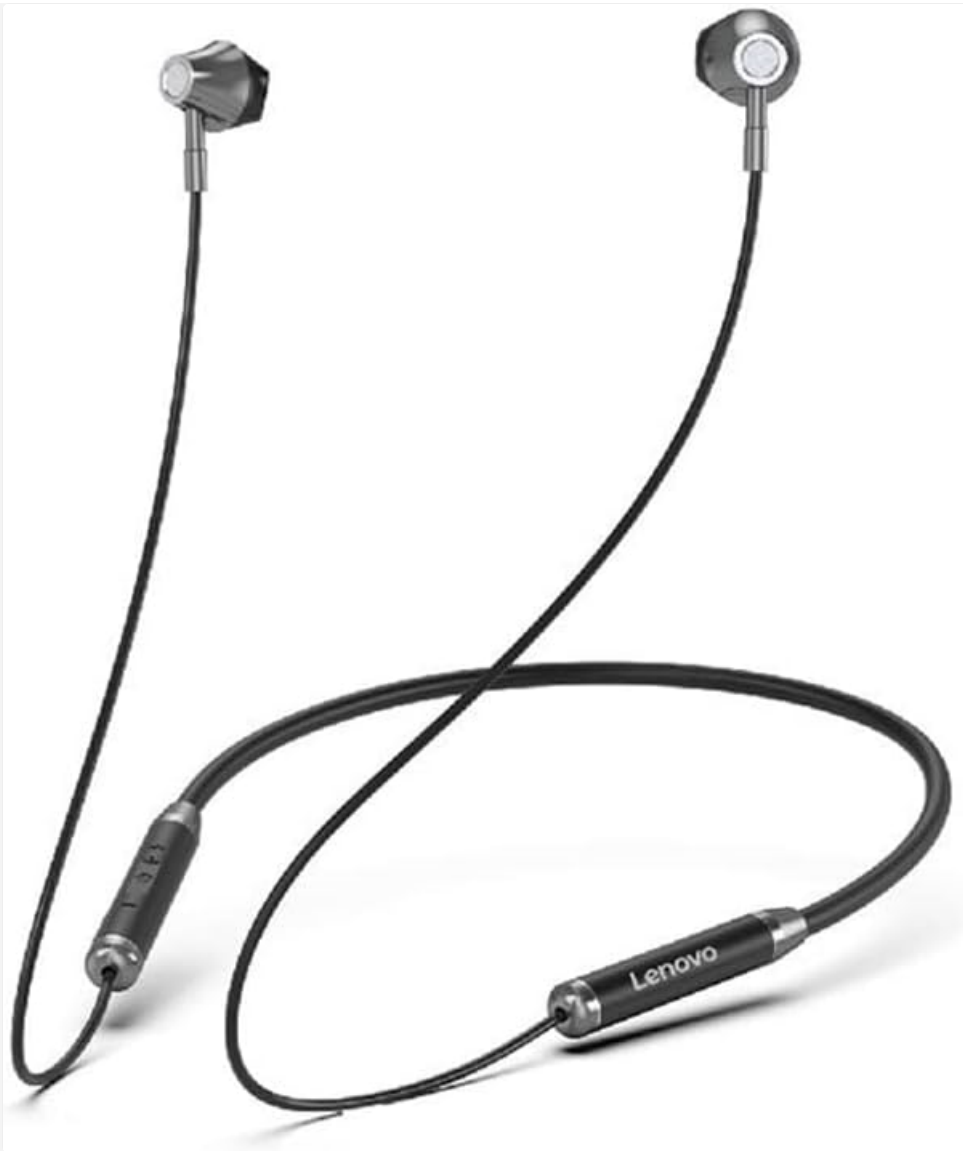
Image: Lenovo HE06 Wireless Neckband Earphone in black, showcasing the neckband and earbuds.