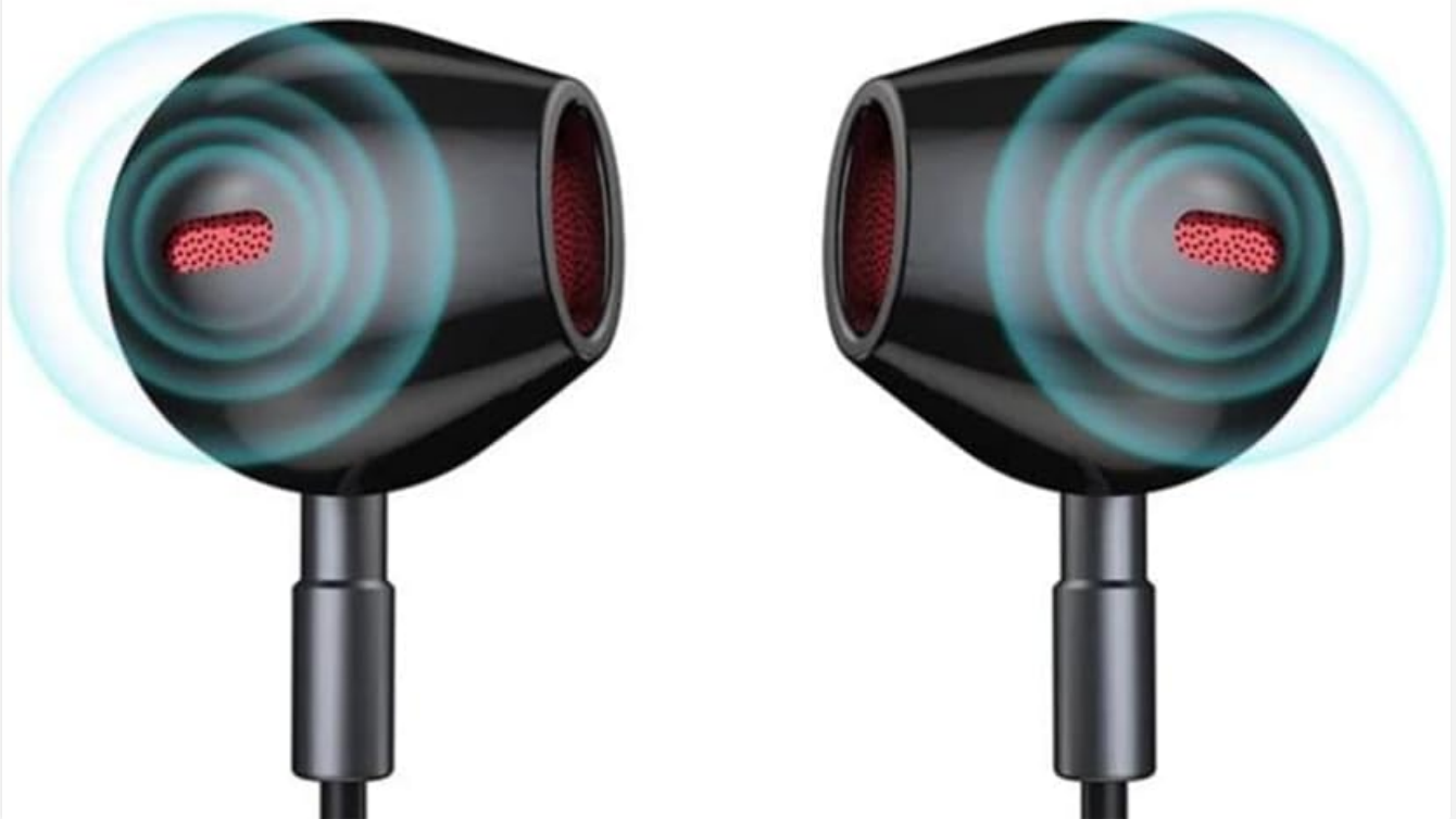
Image: A diagram illustrating the metal composite diaphragm within the earbuds, responsible for balanced high, medium, and low frequency sound quality.