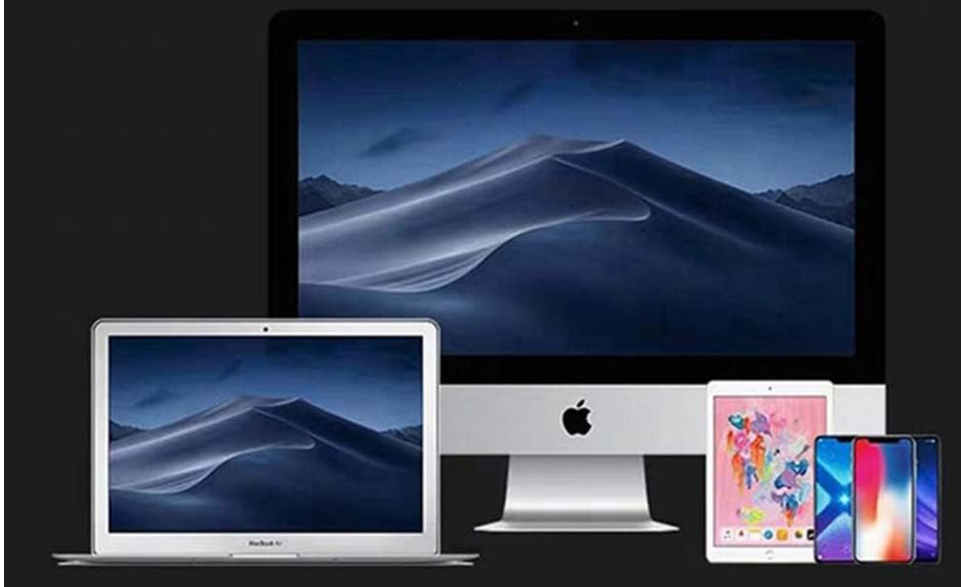
Image: An illustration showing the Lenovo HE06 earphones' compatibility with various operating systems including iPhone, Android, and Windows.