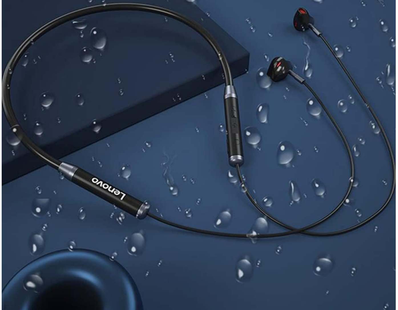
Image: The Lenovo HE06 earphones are shown with water droplets, illustrating their waterproof and sweatproof design.