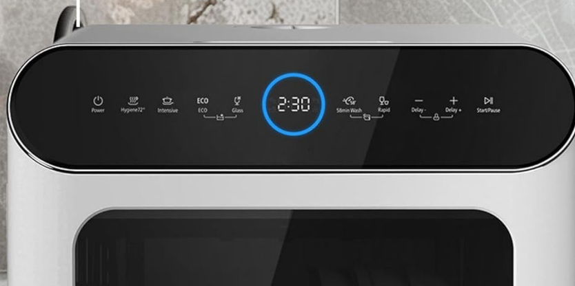
Figure 4: Control Panel with Program Indicators