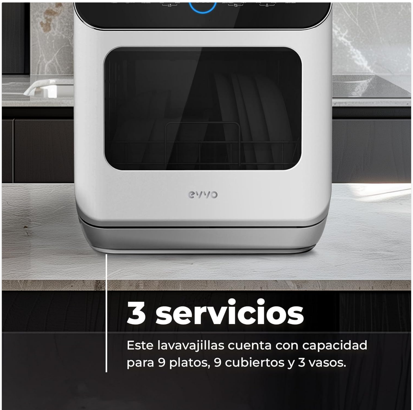
Figure 5: Dishwasher Interior Loaded with 3 Place Settings