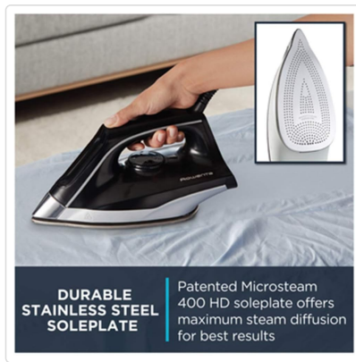
Figure 6: Detail of the durable stainless steel soleplate, featuring 400 HD micro holes for maximum steam diffusion and optimal ironing results.