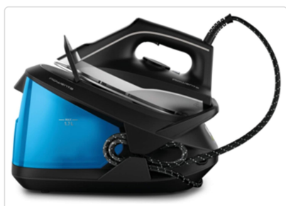
Figure 1: Main view of the NAHANCO Rowenta Professional Compact Steam Pro Iron, showcasing its compact design and integrated water tank.