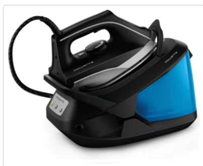
Figure 2: Side view of the steam iron, highlighting the ergonomic handle and steam generator base.