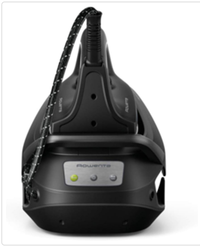
Figure 3: Rear view of the steam iron base, showing the control panel and power cord storage area.