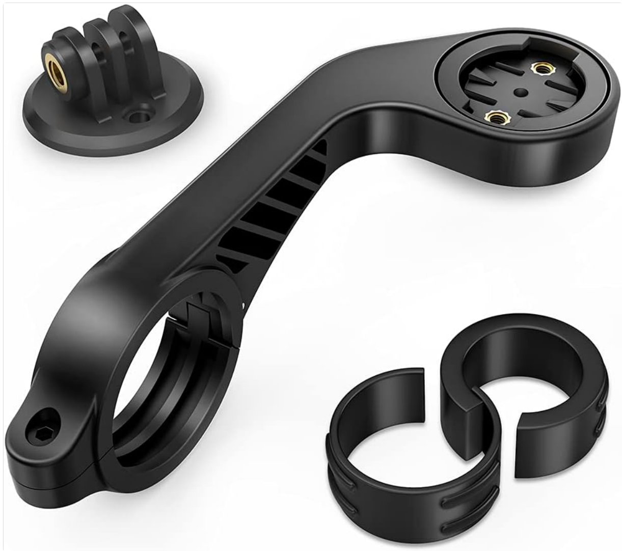
Image: TUSITA Out Front Mount and its components.