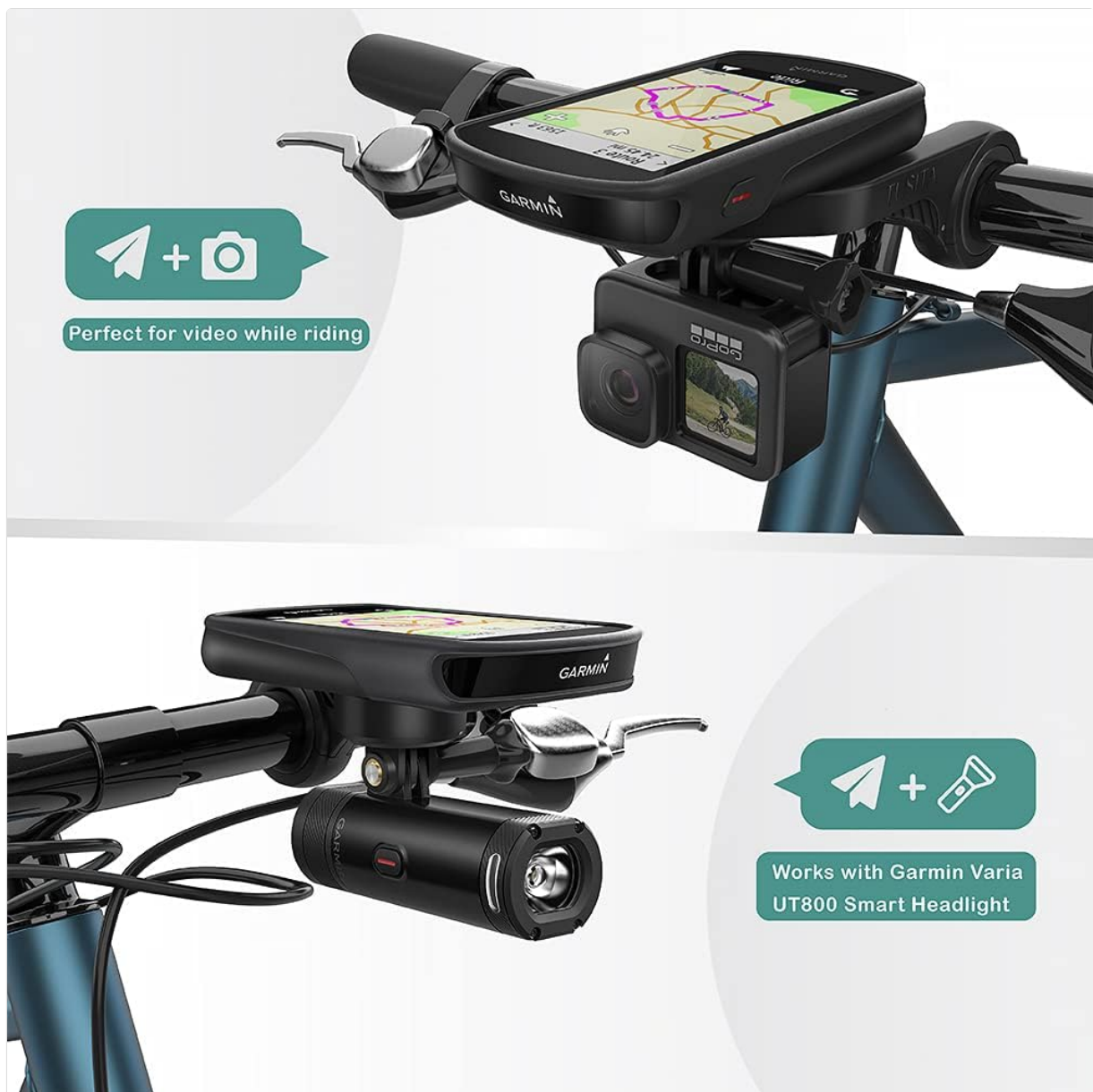
Image: Mount with GPS computer and additional accessory (GoPro or headlight).