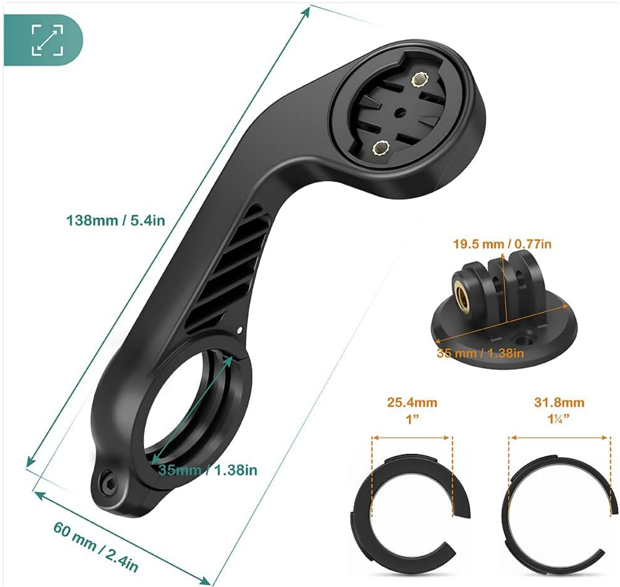
Image: Product dimensions and spacer sizes.