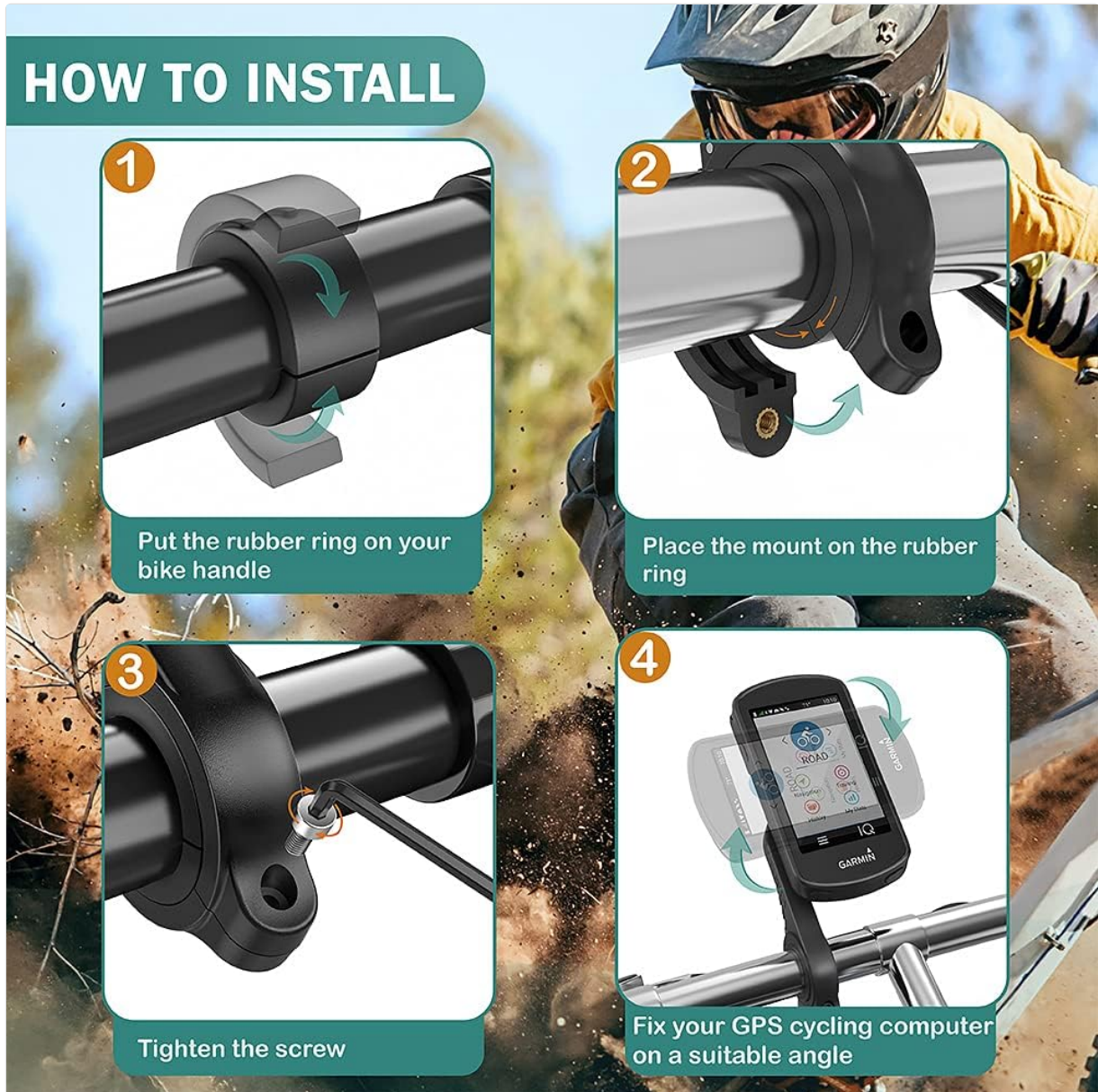
Image: Step-by-step installation guide for the TUSITA Out Front Mount.