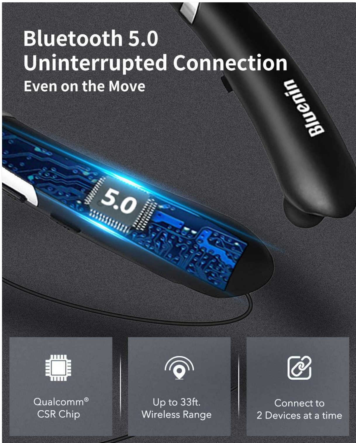
Image: Overview of the Bluenin HWS-918 neckband headphones, showing the general design and location of controls.