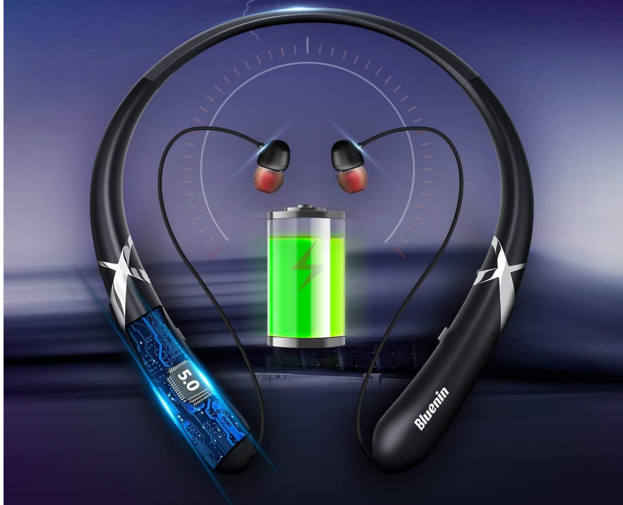
Image: The Bluenin HWS-918 headphones with graphics emphasizing Bluetooth 5.0, an integrated Qualcomm CSR chip, a wireless range of up to 33 feet, and the capability to connect to two devices simultaneously.

180mAh battery ensures a decent 500 Hours stand-by time