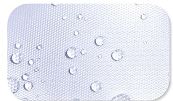
2. Durable Water Resistance Fabric

Image: Detailed view of key features: zippered mesh walls for insect protection, strength and thickened rust-proof legs, silver coating for UV protection, and durable water-resistant fabric.