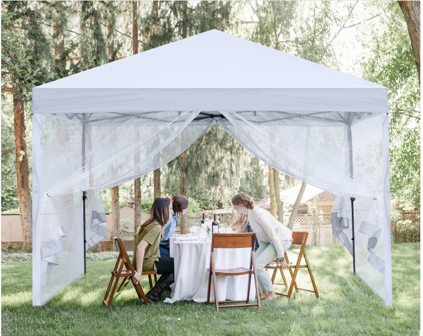
Image: The ABCCANOPY tent set up in a backyard, providing shade for a gathering around a table.

Video: Official ABCCANOPY demonstration of the easy pop-up canopy tent, including setup and durability tests against wind and rain.