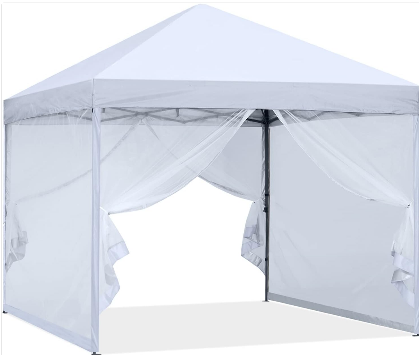
Image: The ABCCANOPY 10x10 Pop-Up Canopy Tent with Netting Wall, showcasing its overall design and mesh walls.

Thank you for choosing the ABCCANOPY Outdoor Easy Pop-Up Canopy Tent with Netting Wall. This manual provides essential information for the safe and effective use, setup, and maintenance of your canopy tent. Designed for convenience and durability, this 10x10 canopy offers ample shade and protection for various outdoor activities.