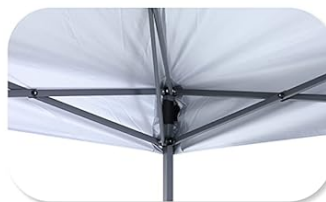
2. Silver Coating for UV Protection