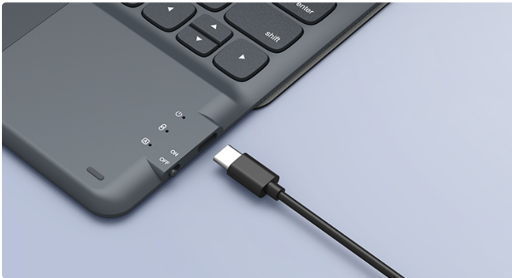
Image: Close-up of the USB-C charging port on the keyboard.