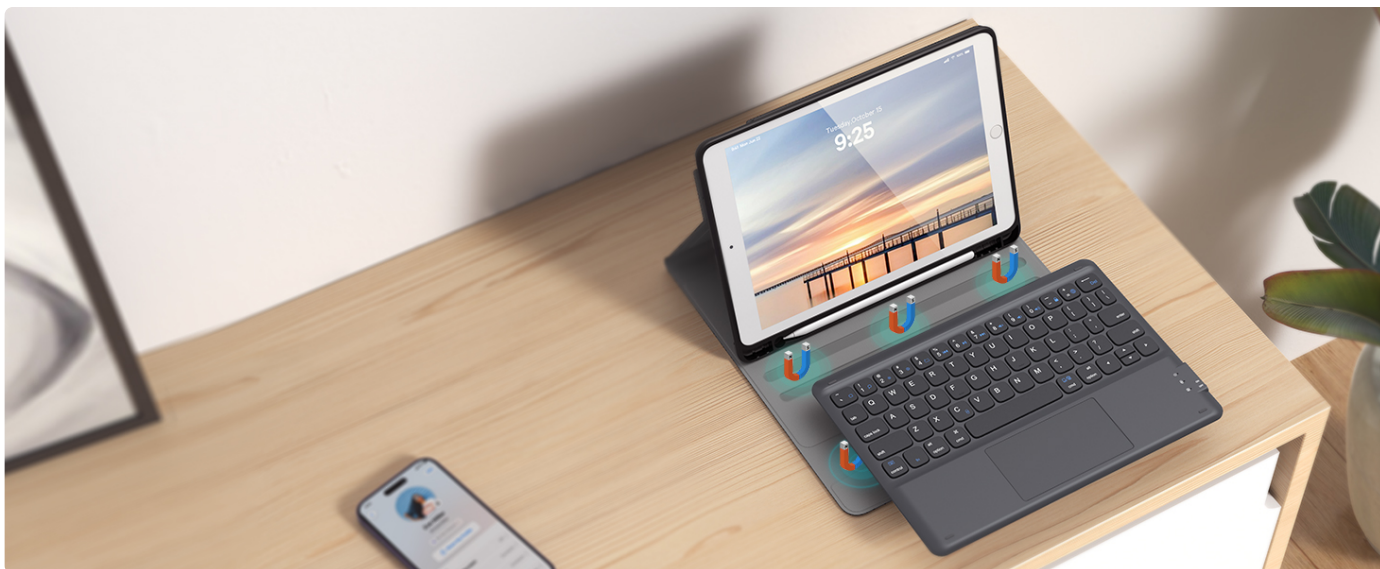
Image: The keyboard case demonstrating its three adjustable viewing angles.