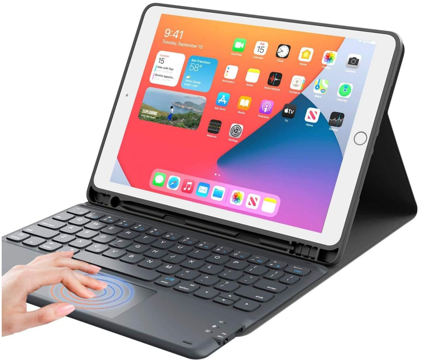
Image: The CHESONA keyboard case with an iPad inserted, shown in a working setup.