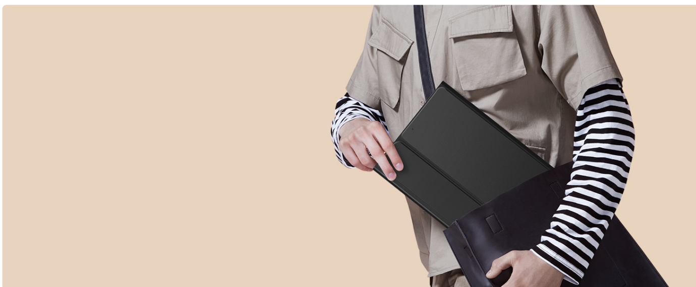
Image: The keyboard case featuring its integrated Apple Pencil holder.

The case includes a built-in holder for your Apple Pencil, along with slots for the cap and adapter, ensuring secure storage and easy access.