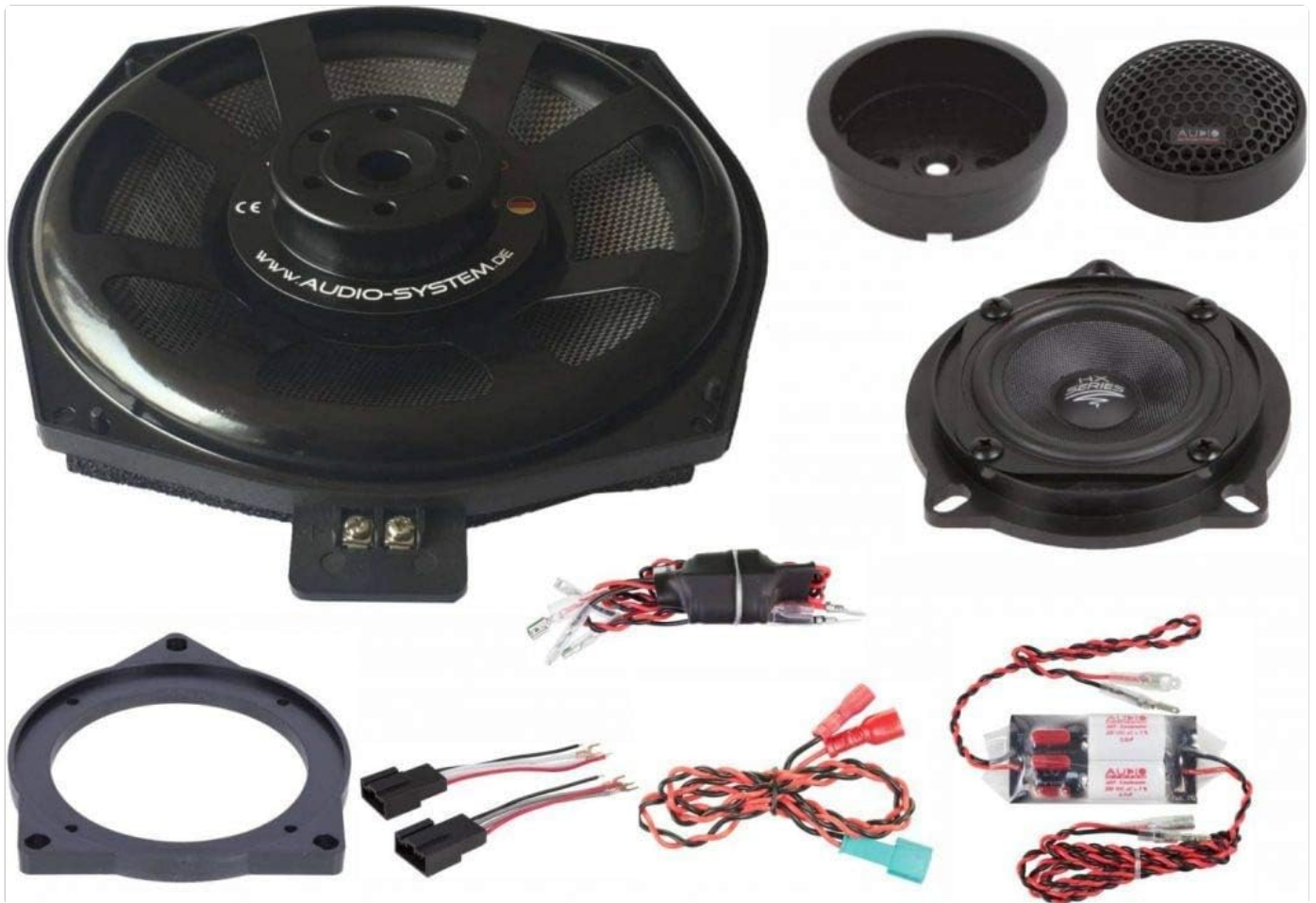
Figure 1: Overview of the Audio System XFIT BMW Uni EVO 2 speaker system components. This image displays the main components of the speaker kit, including the large woofers, smaller mid-range speakers, dome tweeters, passive crossovers, and various wiring harnesses and adapters required for installation.