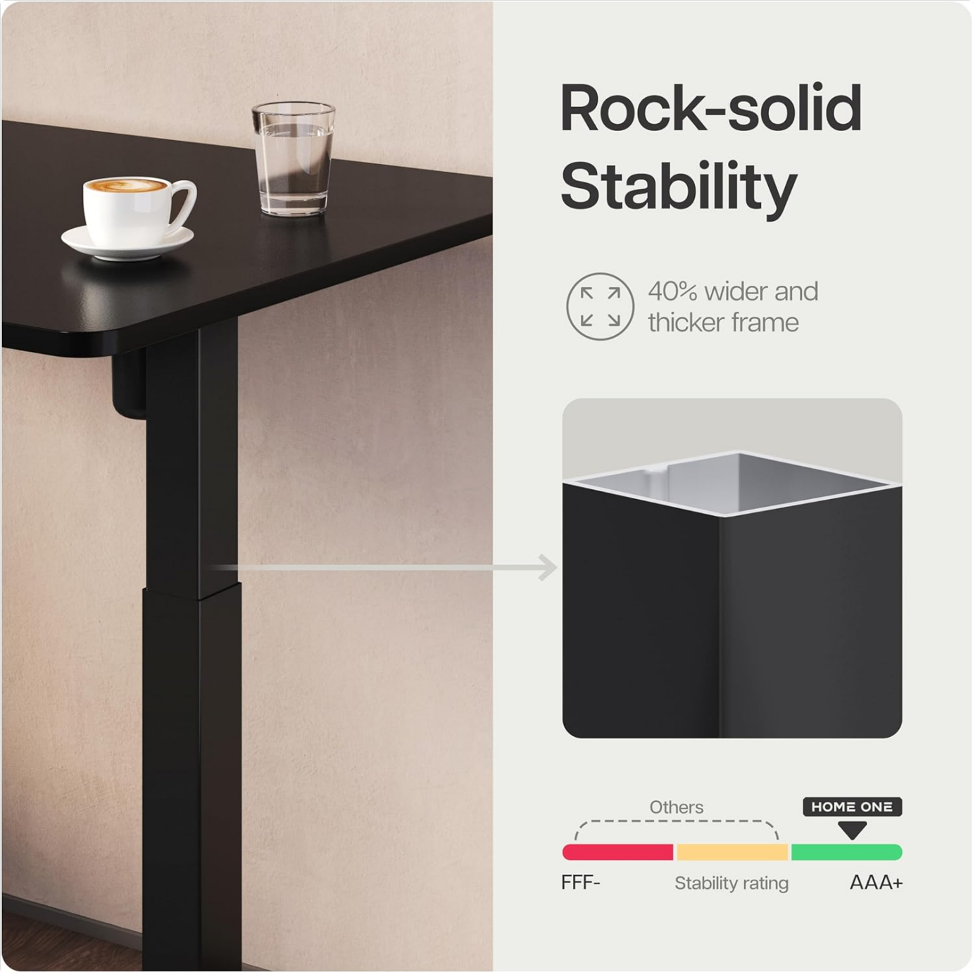
The desk frame features a 40% wider and thicker frame for rock-solid stability, minimizing wobble.

If you encounter any issues with your Desktronic desk frame, refer to the following common troubleshooting steps: