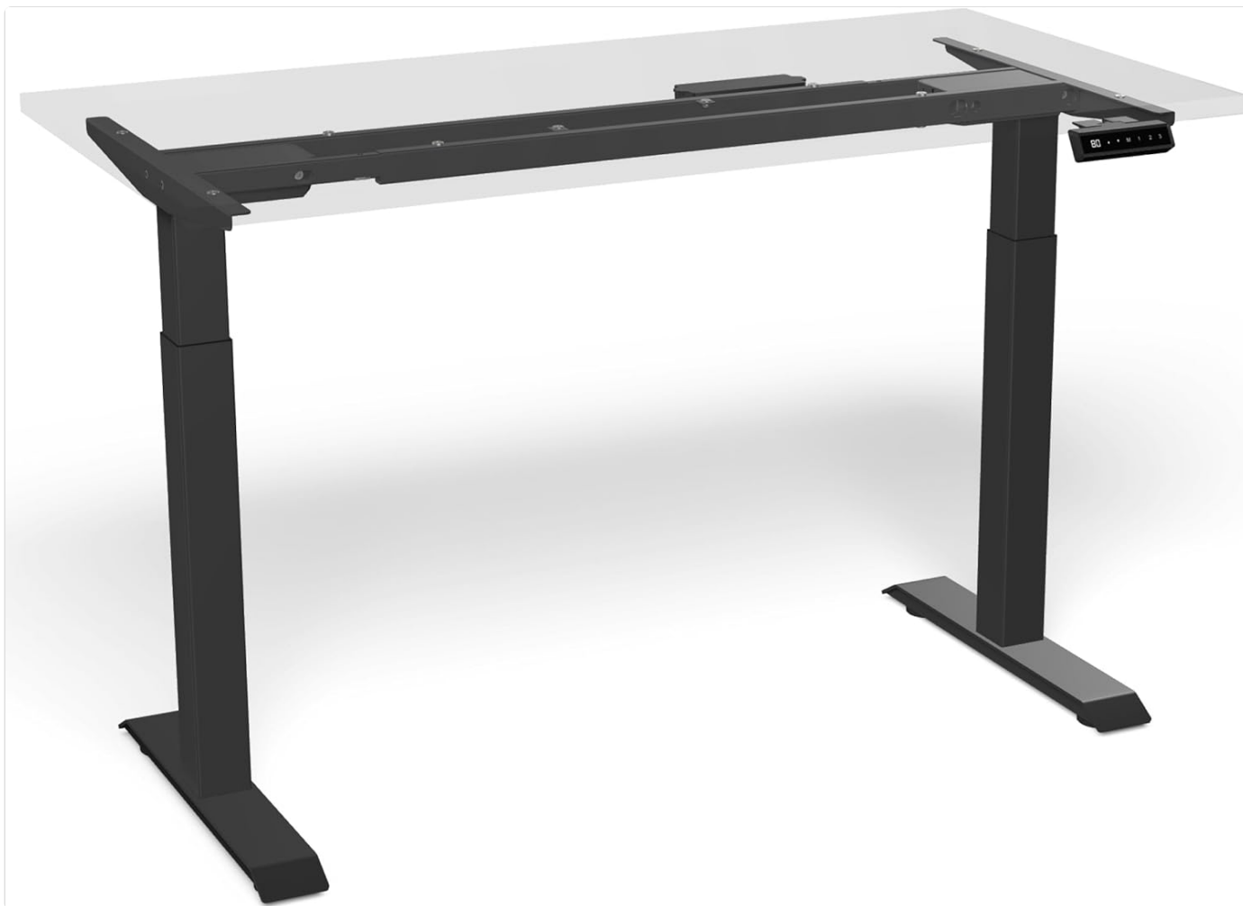
The Desktronic Height-Adjustable Desk Frame, ready for your chosen tabletop.