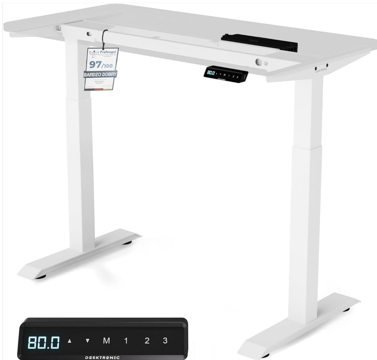
Image: The Desktronic HOME-ONE Electric Height Adjustable Desk, showcasing its white frame and integrated control panel.