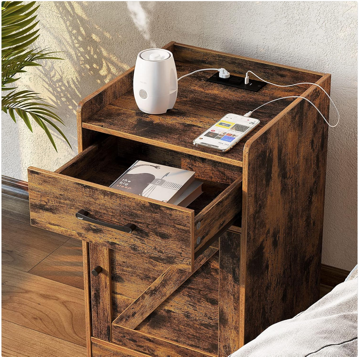
Image 3.1: The integrated charging station on the nightstand's top surface, showing two AC outlets and two USB ports in use.