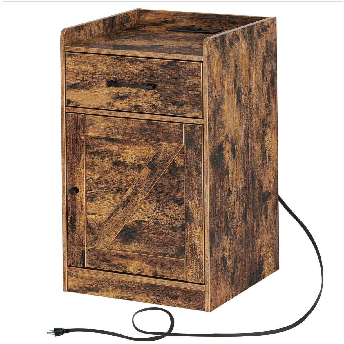
Image 1.1: The Rolanstar Nightstand with Charging Station, showcasing its rustic design and integrated charging capabilities.