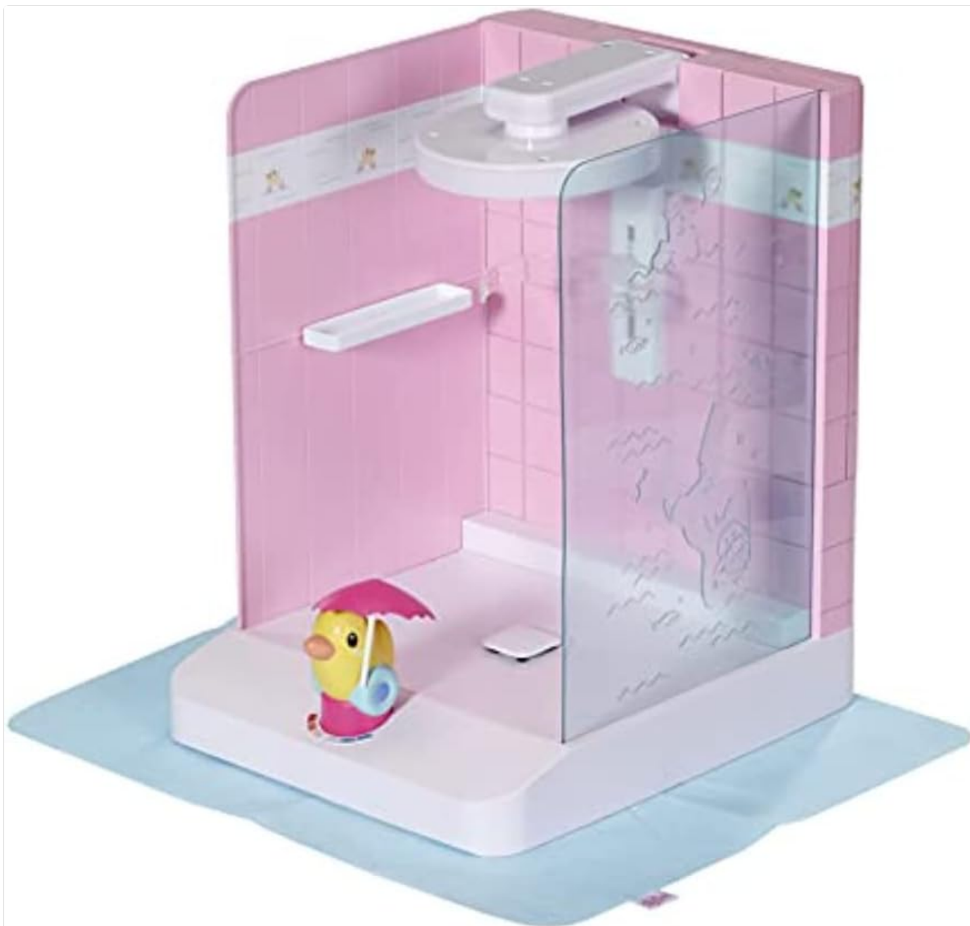
Image: The fully assembled BABY born Bath Walk-In Shower with the duck accessory and bath mat in place.