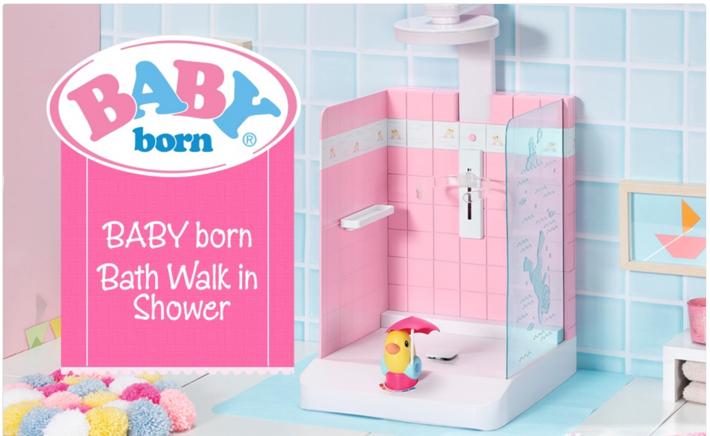
Image: Overview of the BABY born Bath Walk-In Shower.

The BABY born Bath Walk-In Shower is designed to provide an interactive and imaginative play experience for children aged 3 years and up. This accessory allows BABY born dolls (36 cm to 43 cm) to enjoy a realistic shower experience with real water flow. It encourages role-play, empathy, and social skill development.