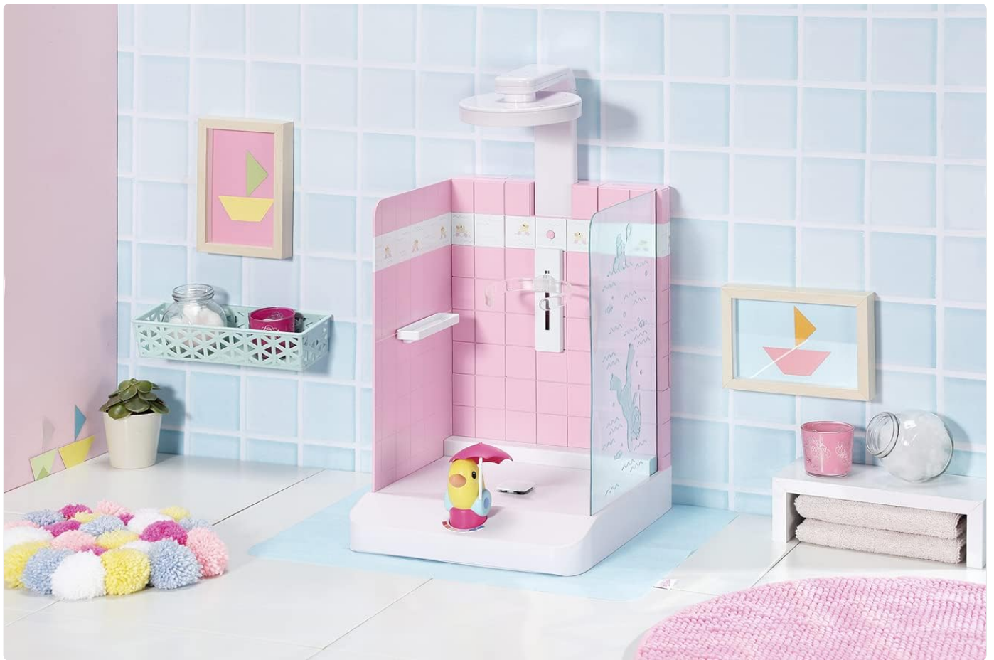
Image: A BABY born doll enjoying a shower, demonstrating the water flow feature.