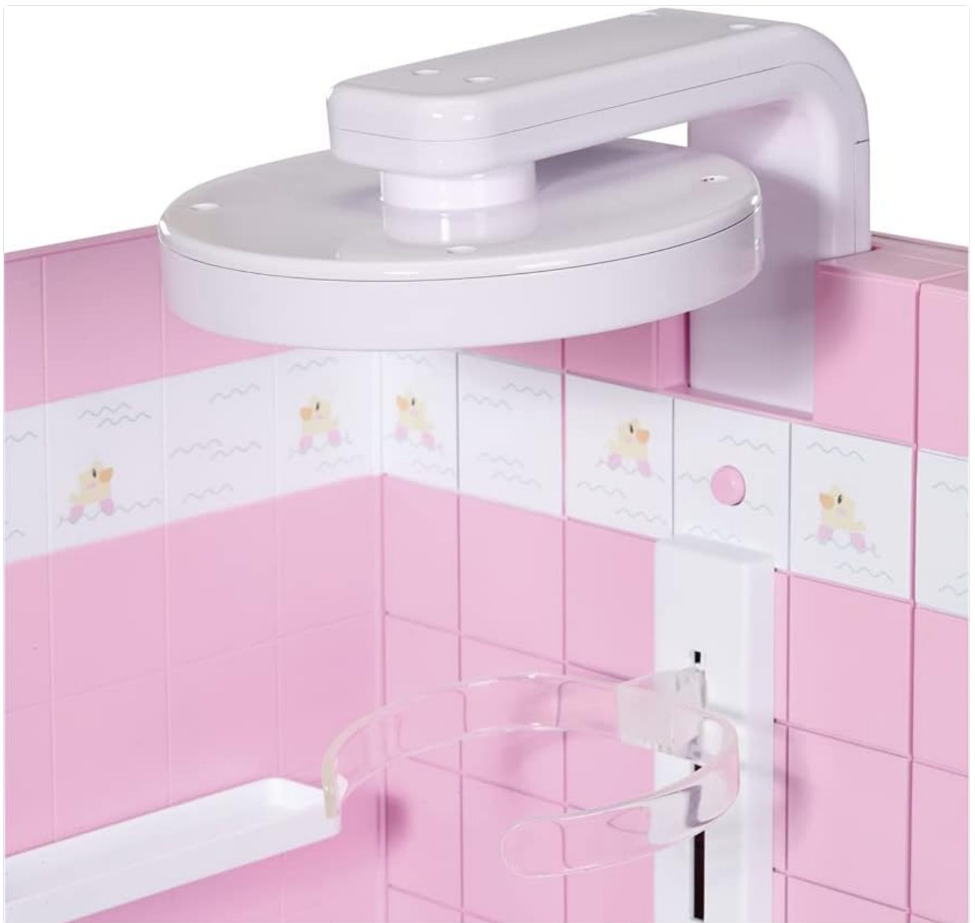
Image: A detailed view of the adjustable shower head, showing its movable design.