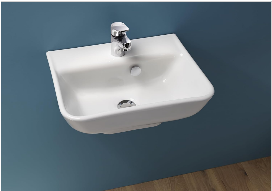
Figure 4: Front view of the Jacob Delafon Struktura basin after successful wall mounting and tap installation.