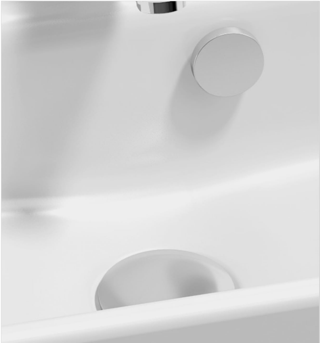
Figure 6: Side view of the basin, illustrating its depth and compact profile.