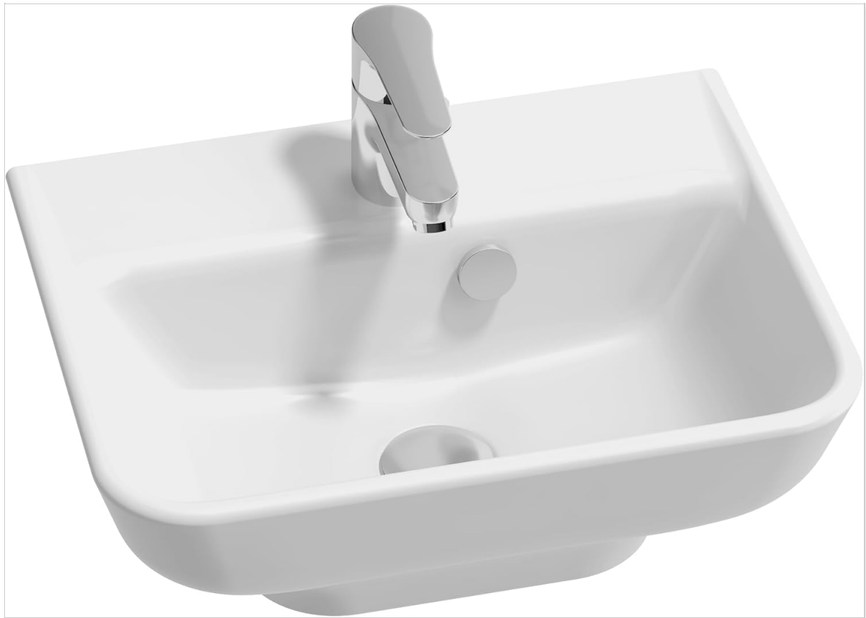
Figure 1: Overview of the Jacob Delafon Struktura Hand Wash Basin.