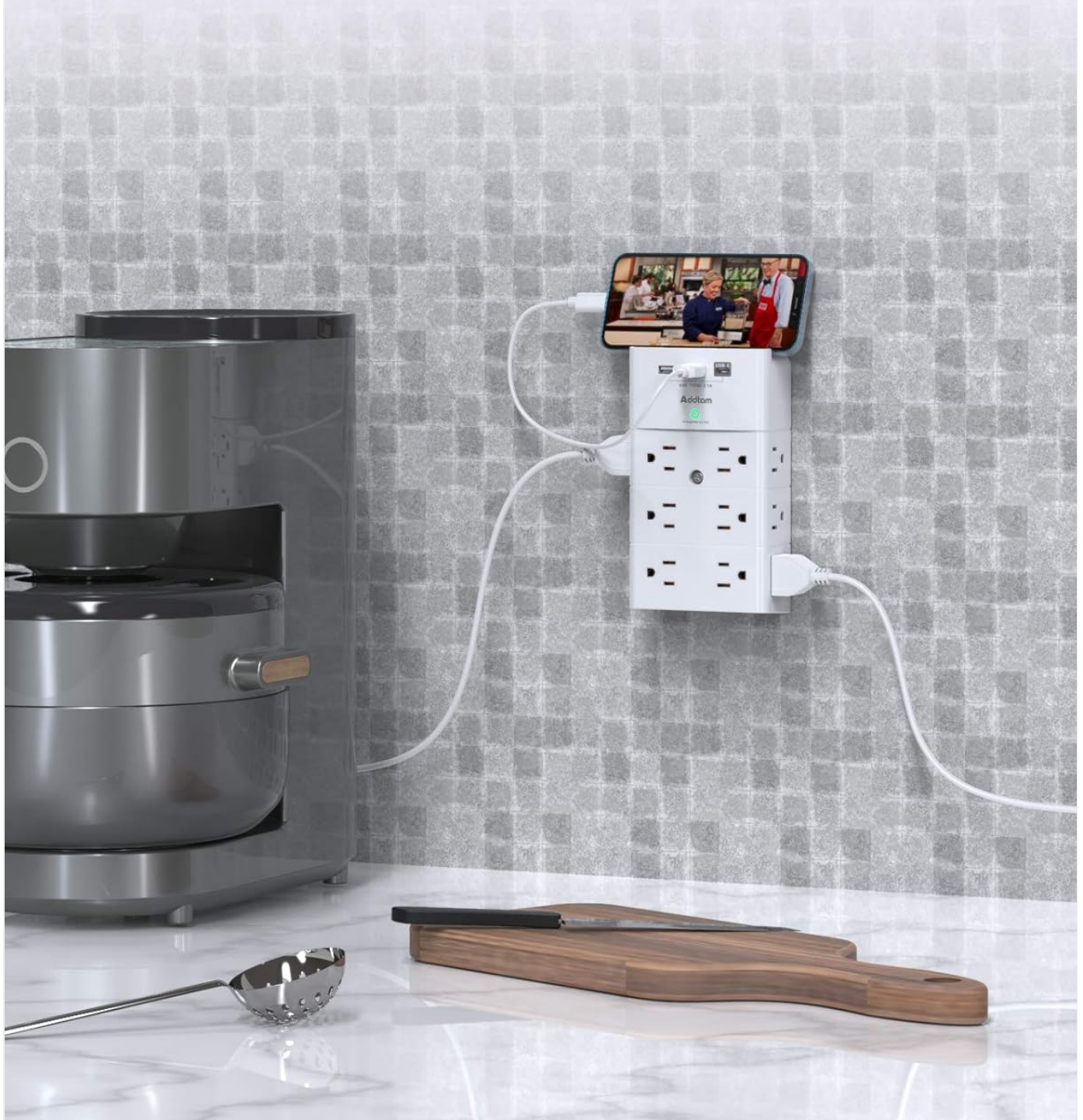
Image: The surge protector mounted on a kitchen wall, demonstrating the phone holder feature with a smartphone charging.