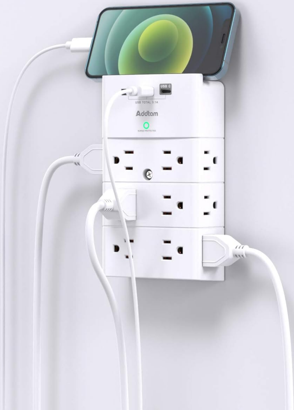
Image: Visual representation of the 12 AC outlets, 1 USB-C port, and 2 USB-A ports, highlighting the 4-side design.