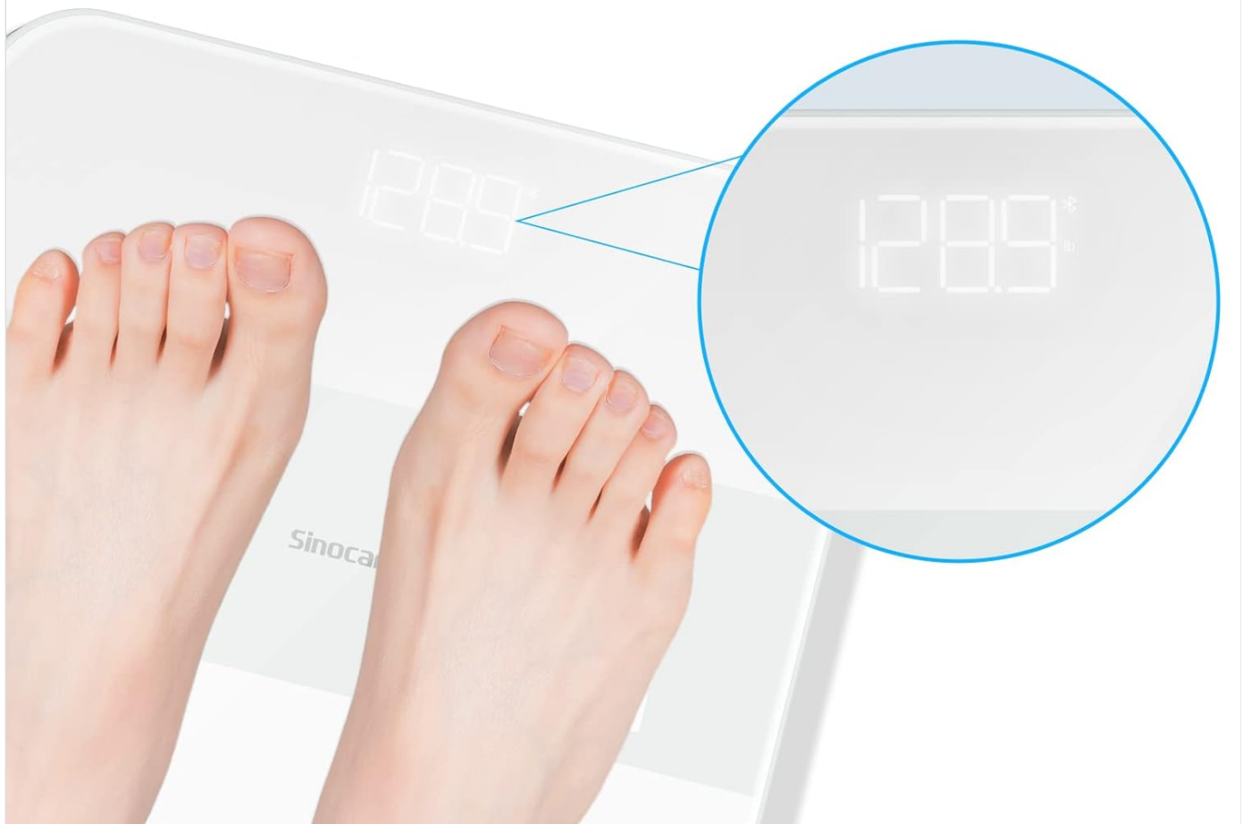
Figure 6.1: The physical dimensions of the scale, indicating its moderate size and slim profile.