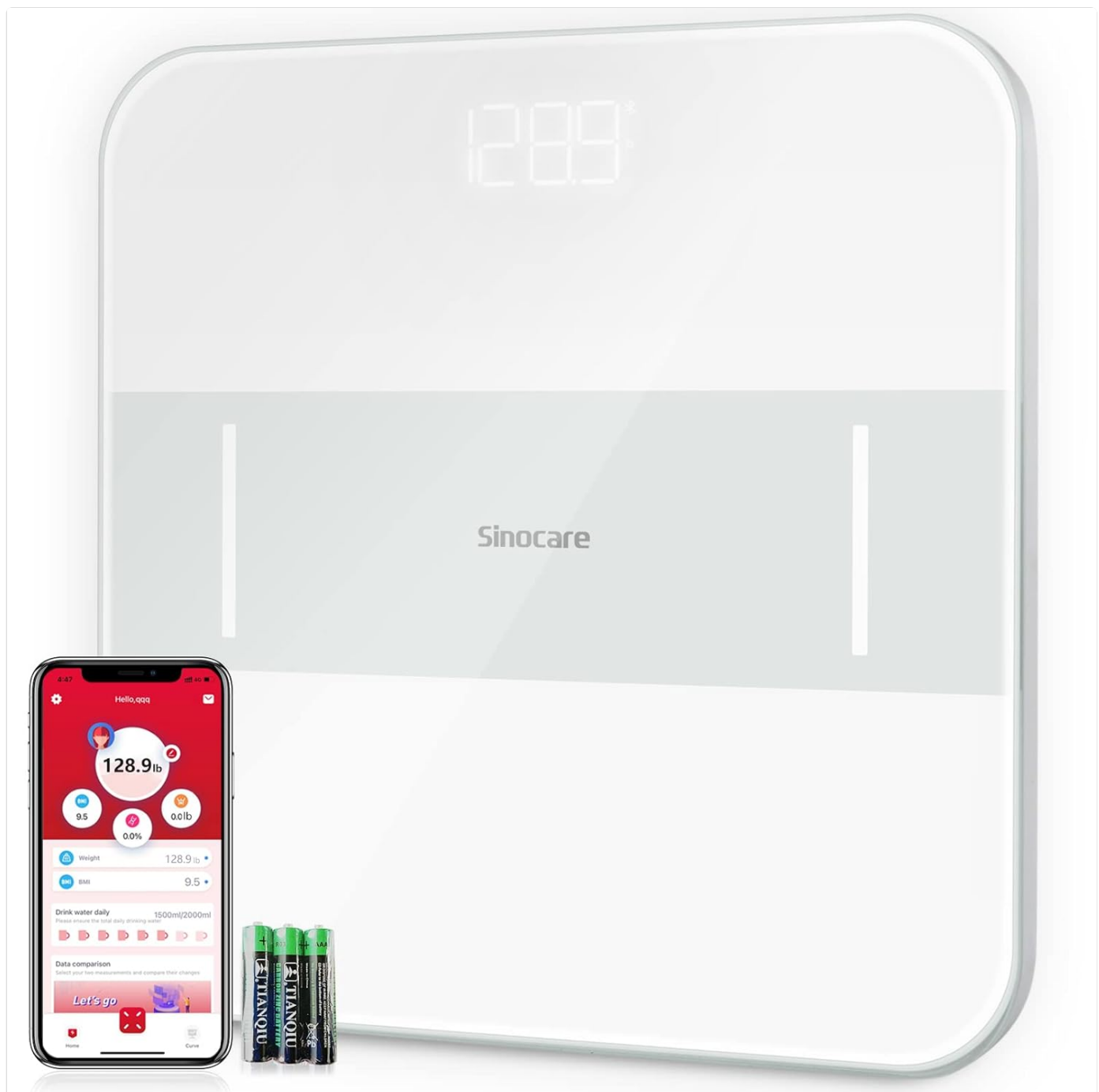
Figure 1.1: The Sinocare Smart Digital Bathroom Scale, showing its minimalist design, integrated LED display, and connectivity with the SinoHealth app. Batteries are also visible, indicating power source.