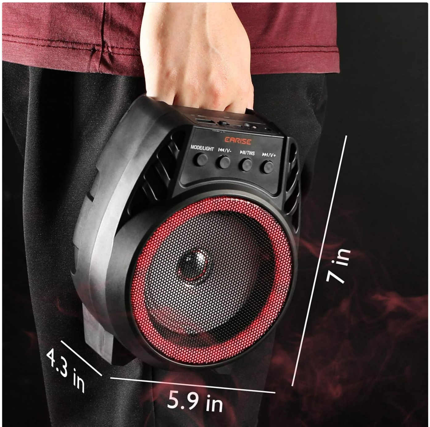
Image: A hand holding the EARISE D51 speaker, illustrating its portable size and dimensions (5.9 in x 4.3 in x 7 in).