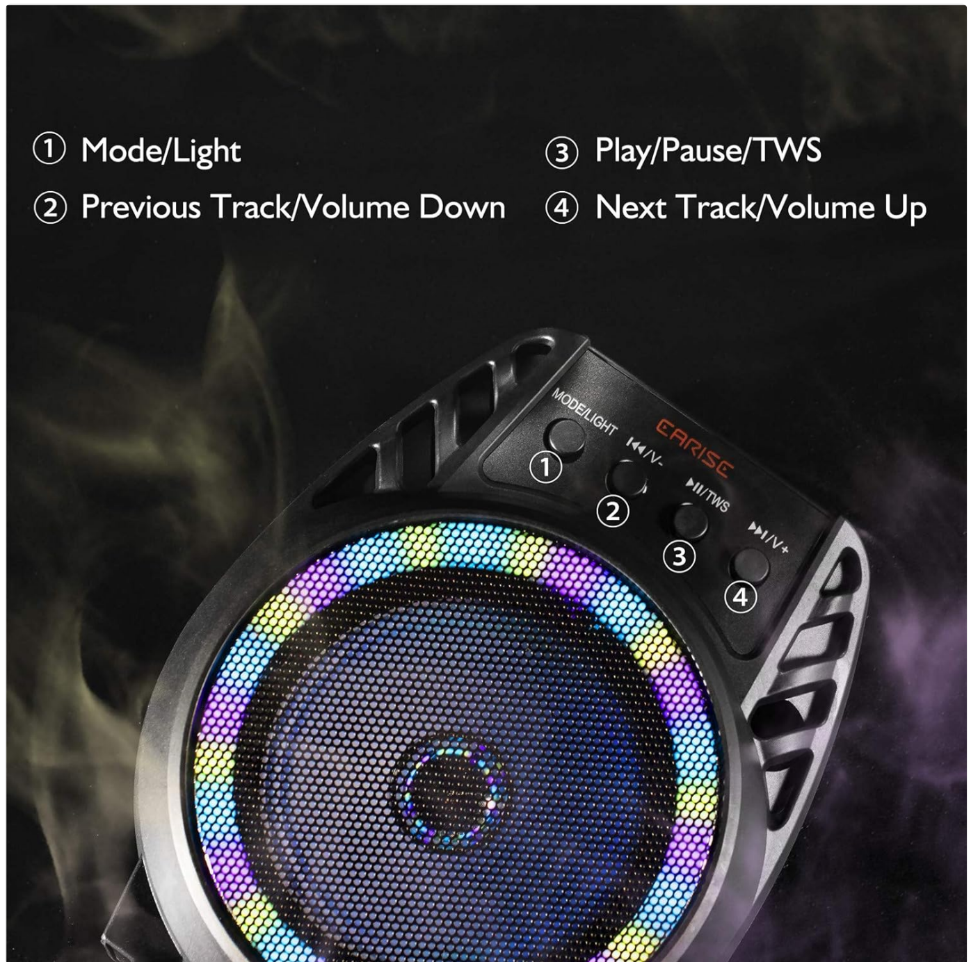
Image: Top view of the EARISE D51 speaker showing the control panel with numbered buttons.

Familiarize yourself with the speaker's components and controls.