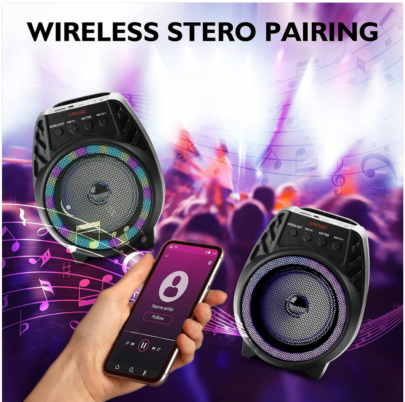
Image: Two EARISE D51 speakers positioned for wireless stereo pairing, with a smartphone displaying music playback, illustrating the TWS feature.