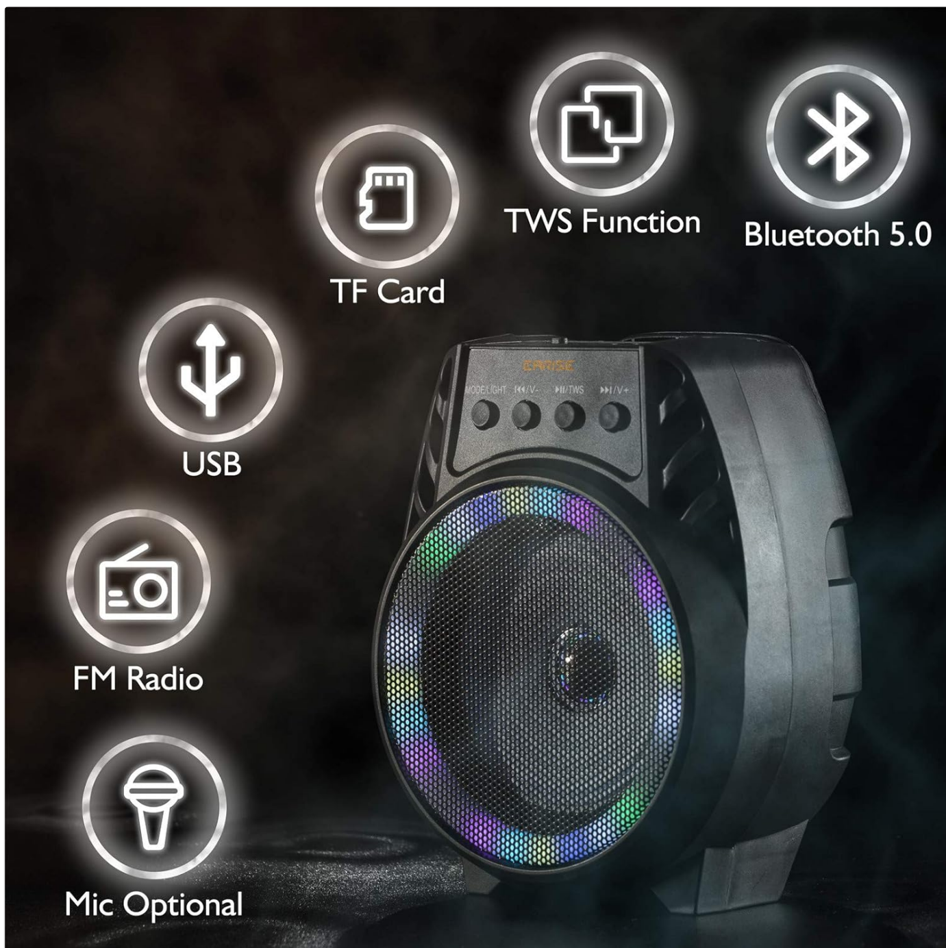
Image: Front view of the EARISE D51 speaker with icons highlighting its features: TF Card slot, TWS Function, Bluetooth 5.0, USB port, FM Radio, and Microphone input.