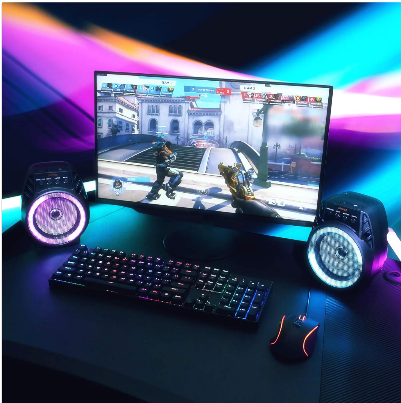
Image: Two EARISE D51 speakers set up on a desk next to a laptop, demonstrating the True Wireless Stereo (TWS) pairing for an enhanced audio experience.