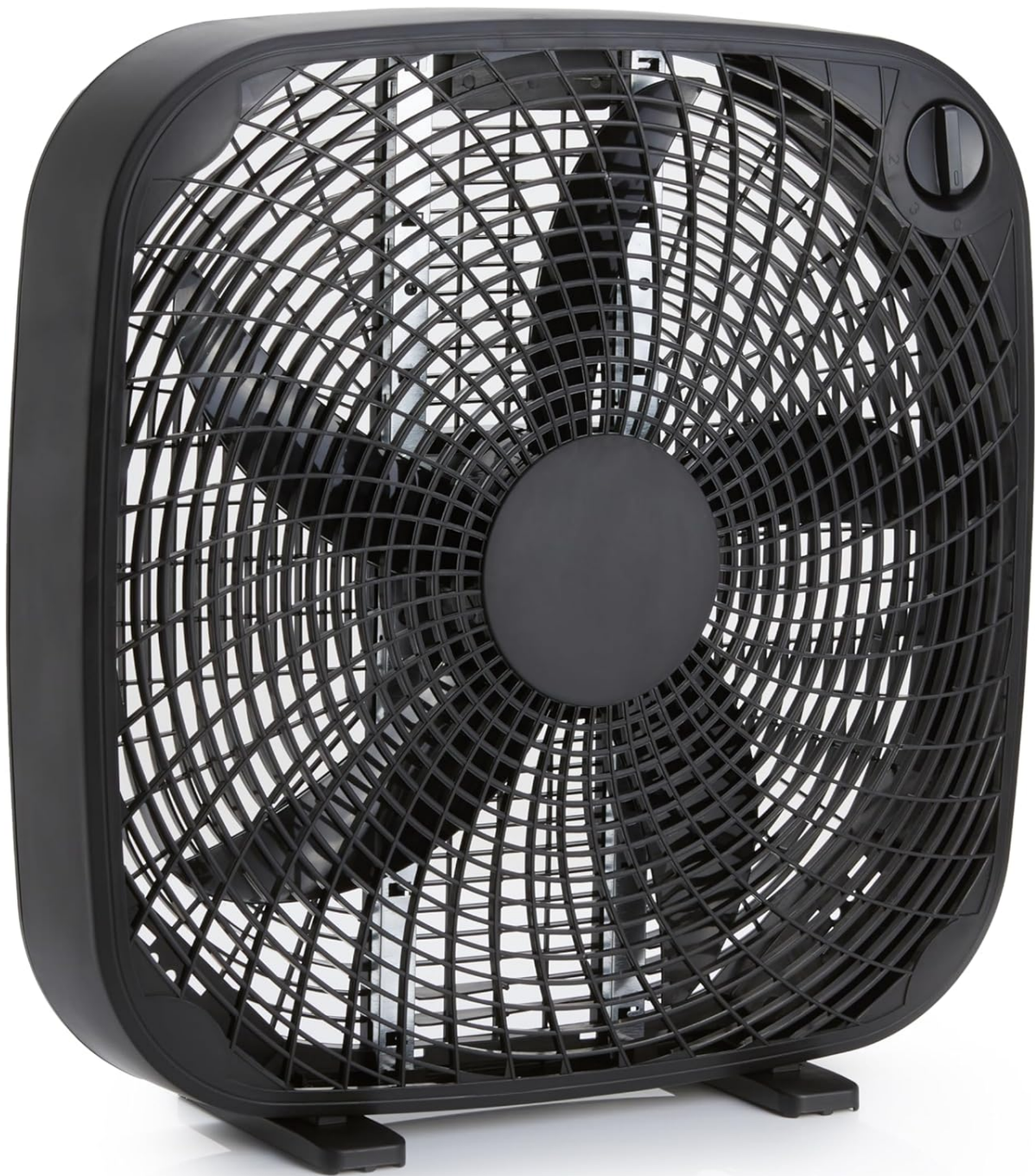
Figure 1: Front view of the Amazon Basics 3 Speed Box Fan.