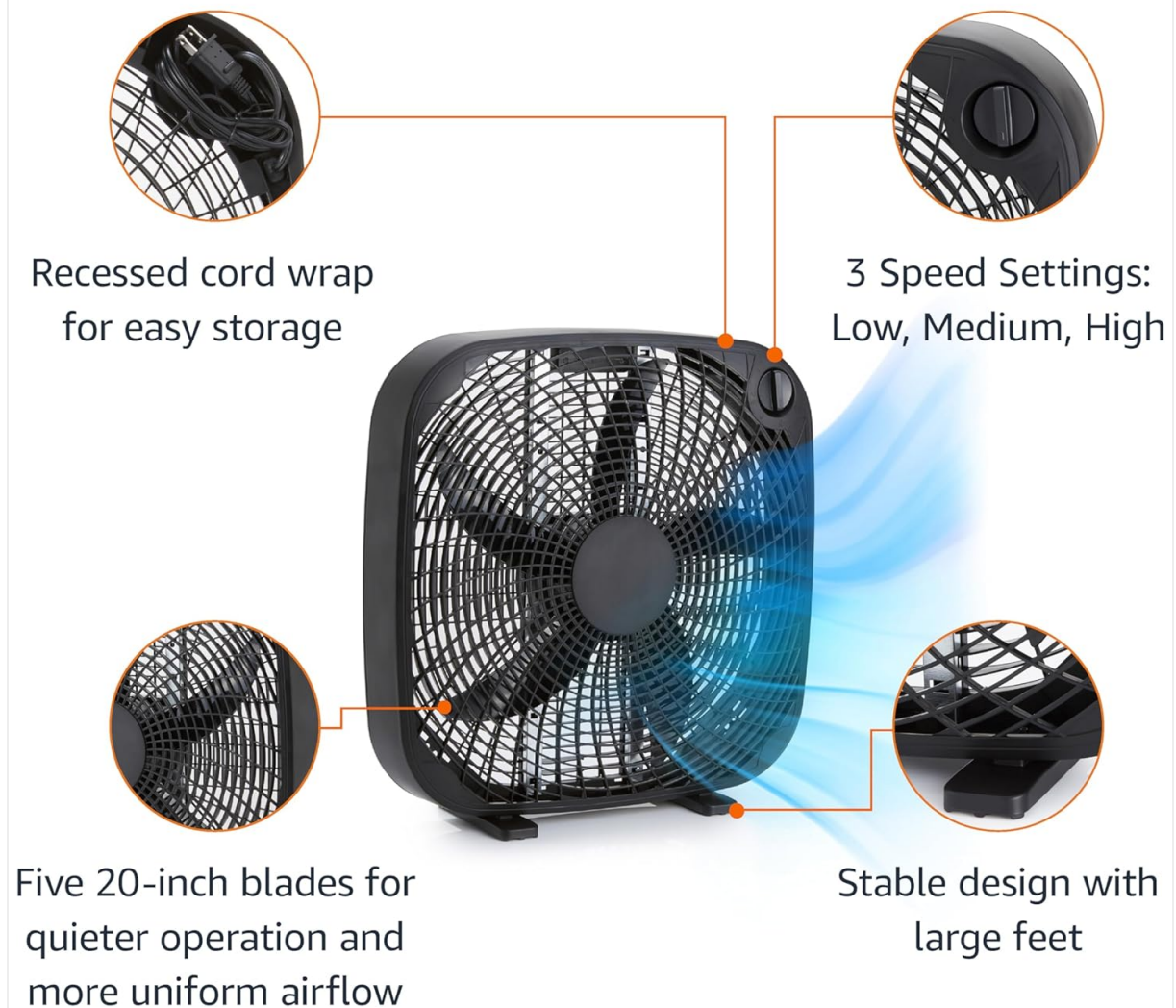
Figure 2: Overview of fan features including a recessed cord wrap for storage, a control dial for three speed settings (Low, Medium, High), five 20-inch blades for quiet operation and uniform airflow, and a stable design with extra-large feet.