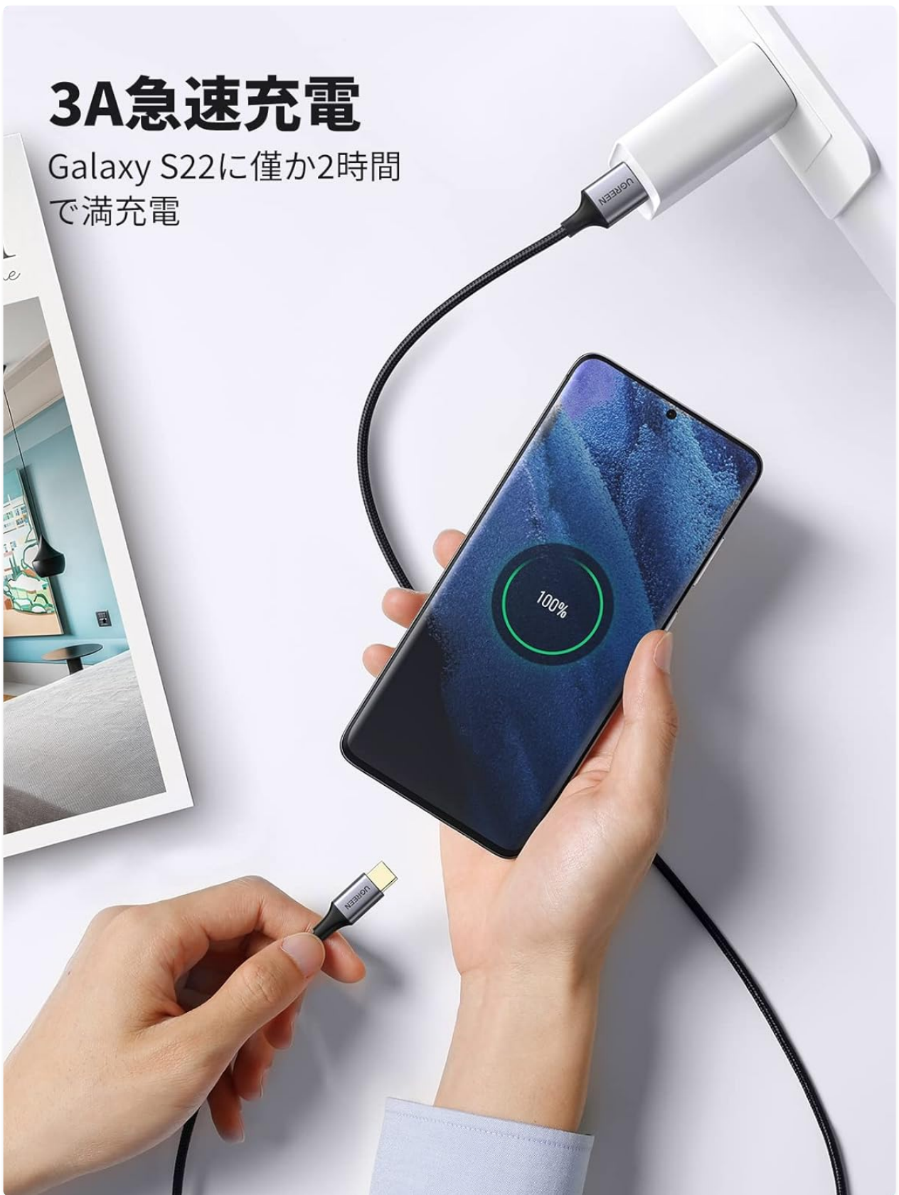
Image: Fast charging a smartphone with the UGREEN USB-C cable.