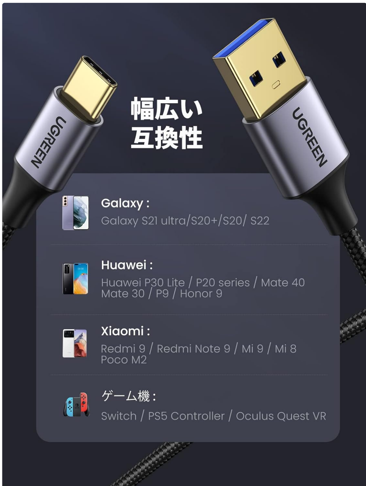
Image: Examples of wide device compatibility for the UGREEN USB-C cable.