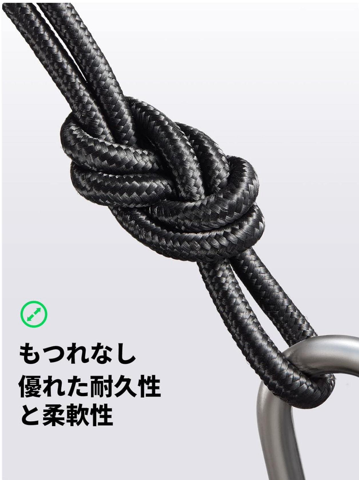
Image: Illustrating the superior durability and tangle-free design of the nylon braided cable.