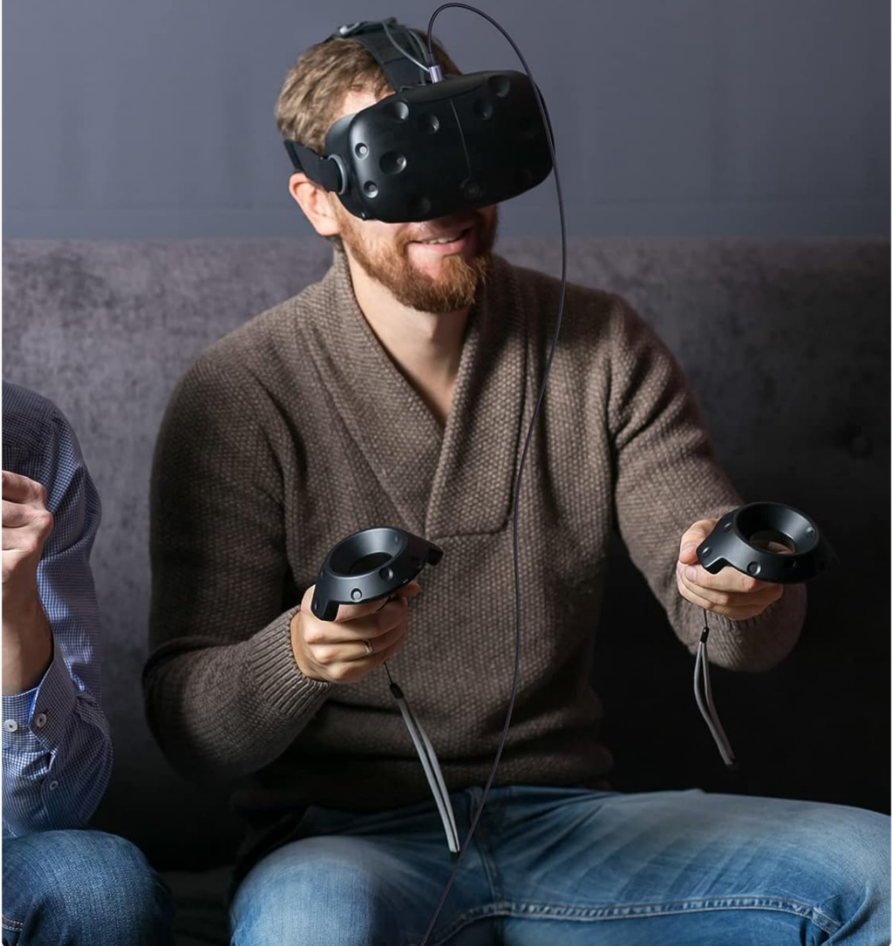
Image: UGREEN USB-C cable compatible with Oculus Quest VR.