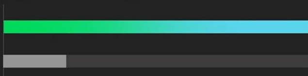
Image: Illustrating 5Gbps super-speed data transfer capability.