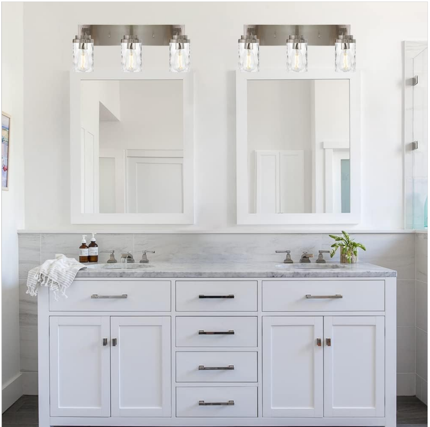
Figure 6: MELUCEE Vanity Light in a Bathroom Setting

Your browser does not support the video tag.