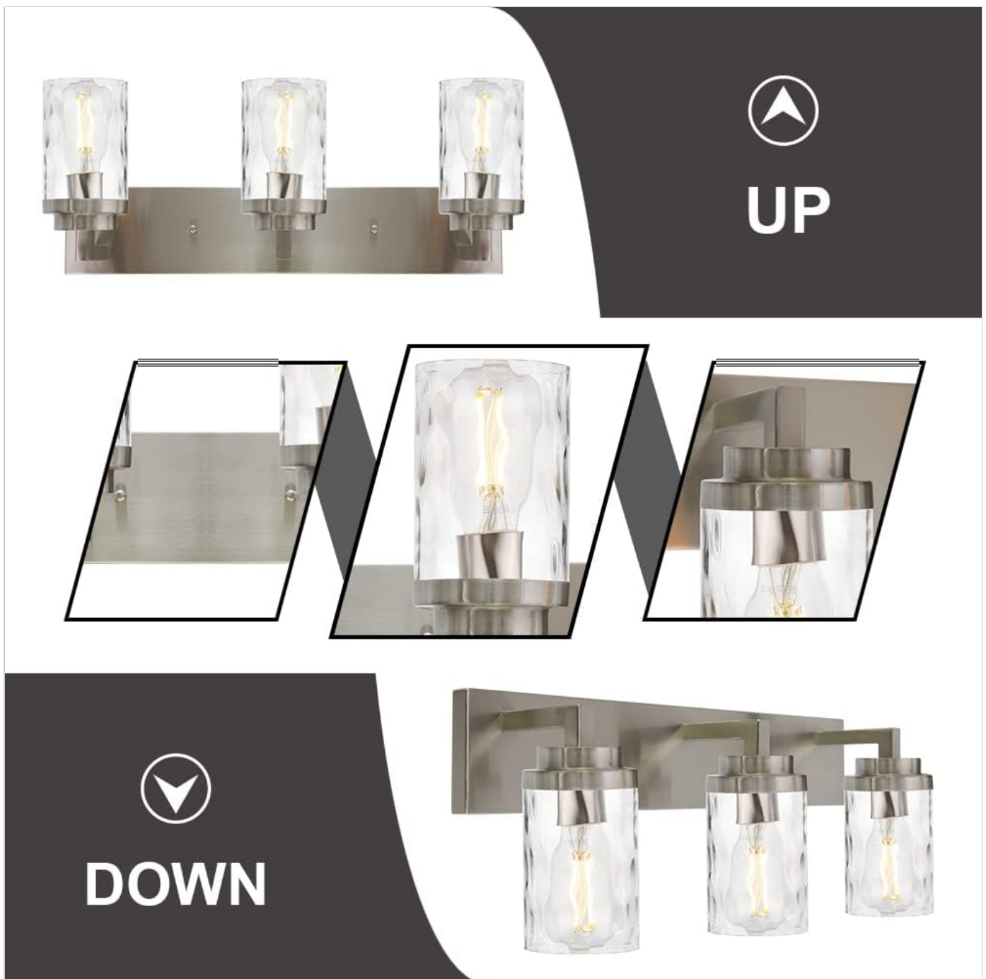
Figure 5: Installation Orientation (Upward or Downward)

Your browser does not support the video tag.