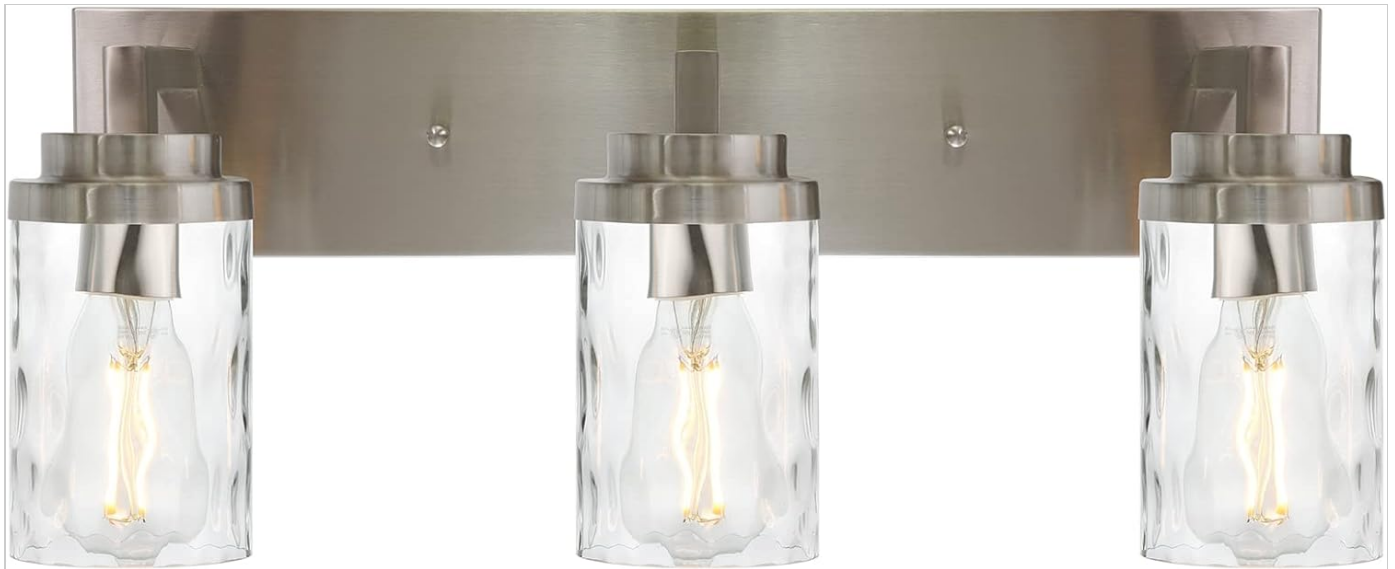
Figure 1: MELUCEE Brushed Nickel 3-Light Vanity Light

This manual provides detailed instructions for the safe installation, operation, and maintenance of your MELUCEE Brushed Nickel 3-Light Vanity Light, Model 4501A-3W-SN. Please read this manual thoroughly before installation and retain it for future reference.