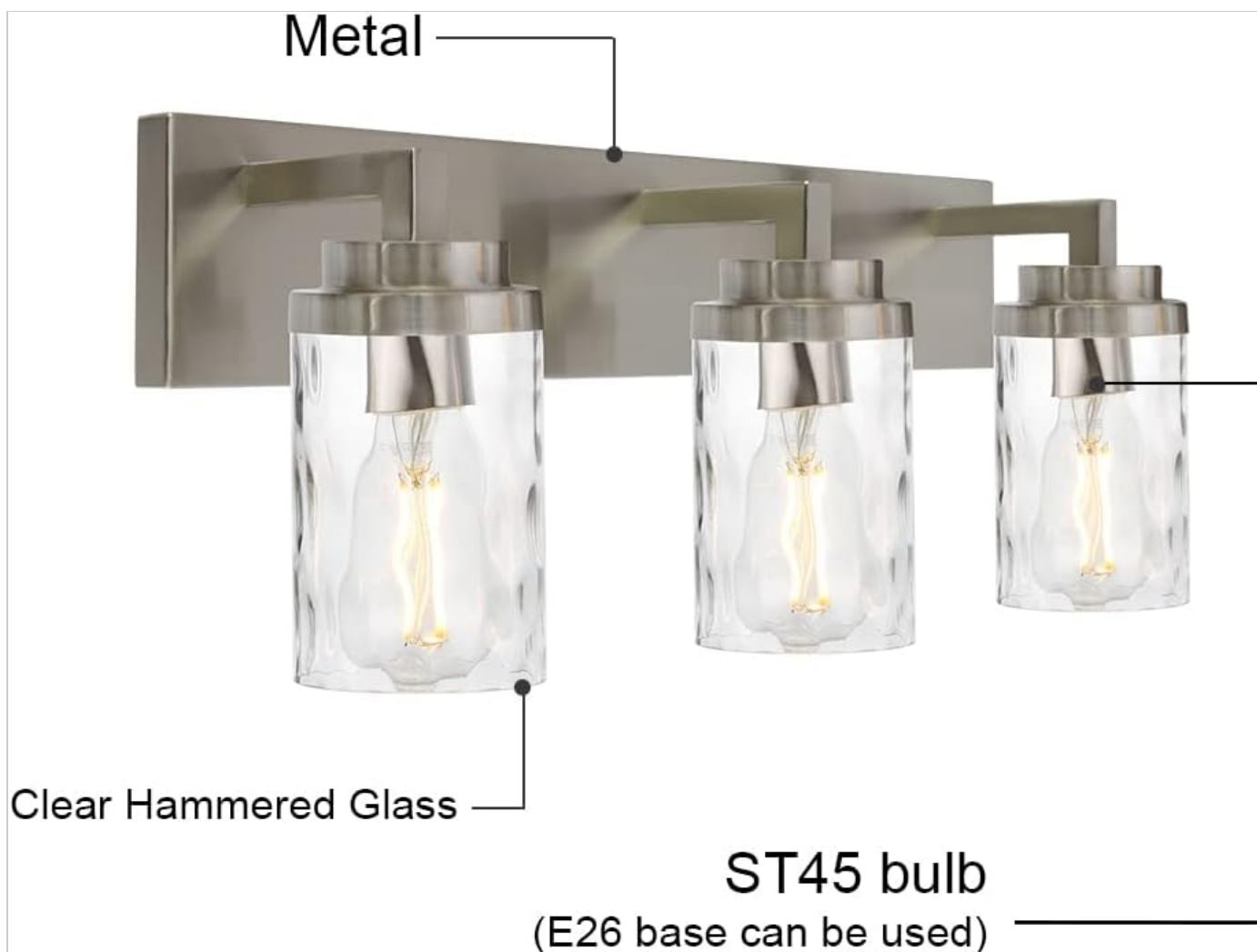
Figure 2: Product Components - Metal Fixture and Clear Hammered Glass