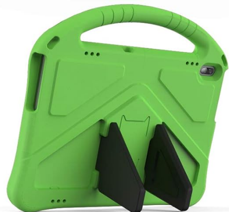
Image 2.1: The ZORSOME protective case with a tablet, highlighting the integrated handle and kickstand functionality.