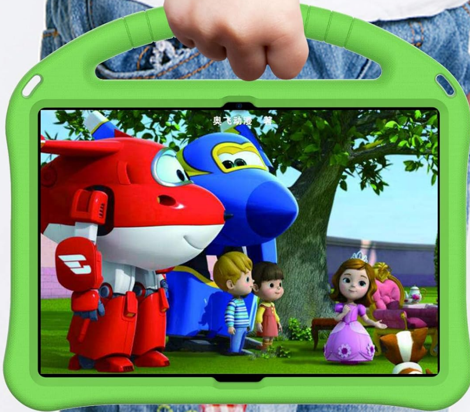
Image 4.1: The case's handle provides a secure and comfortable grip for carrying.

Upgrade the portable function and make it easy for children to carry.