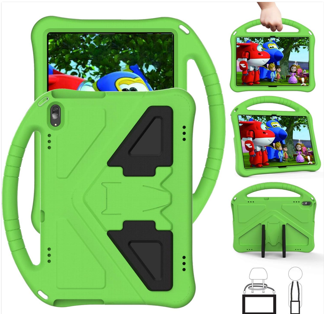
Image 2.2: Various angles of the ZORSOME case, showcasing its ergonomic handle and versatile kickstand.