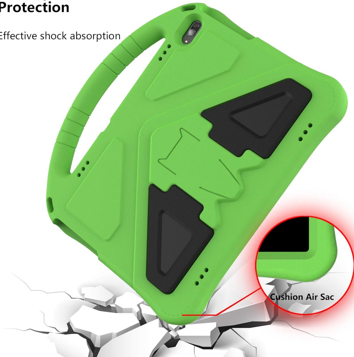
Image 6.1: The case features a cushion air sac design for effective shock absorption.