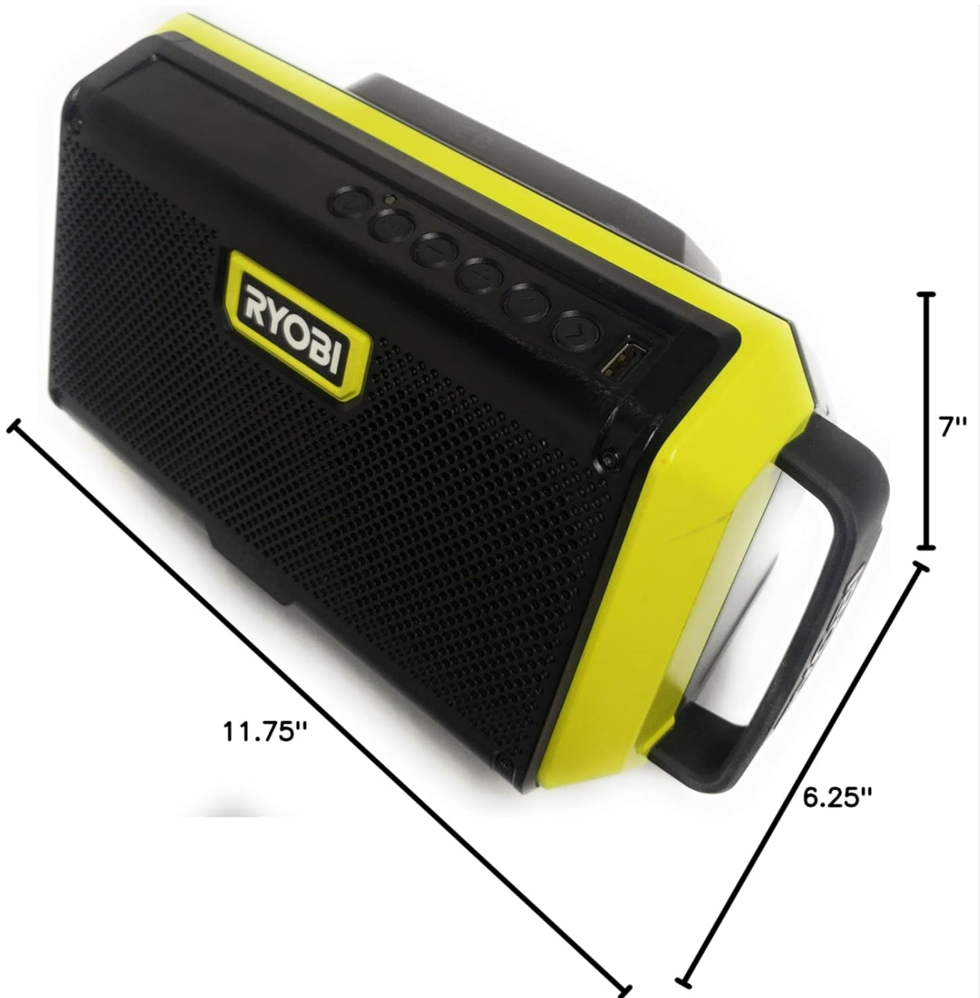
Figure 4.5: Product Dimensions - Illustrates the speaker's approximate measurements: 7" H x 11.75" L x 6.25" W.