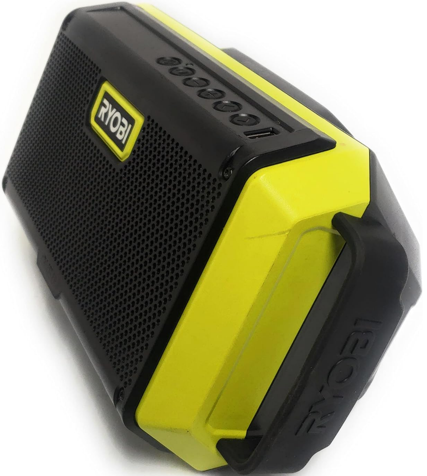
Figure 4.2: Angled Top View - Highlights the top panel with control buttons and the integrated handle on the right side.