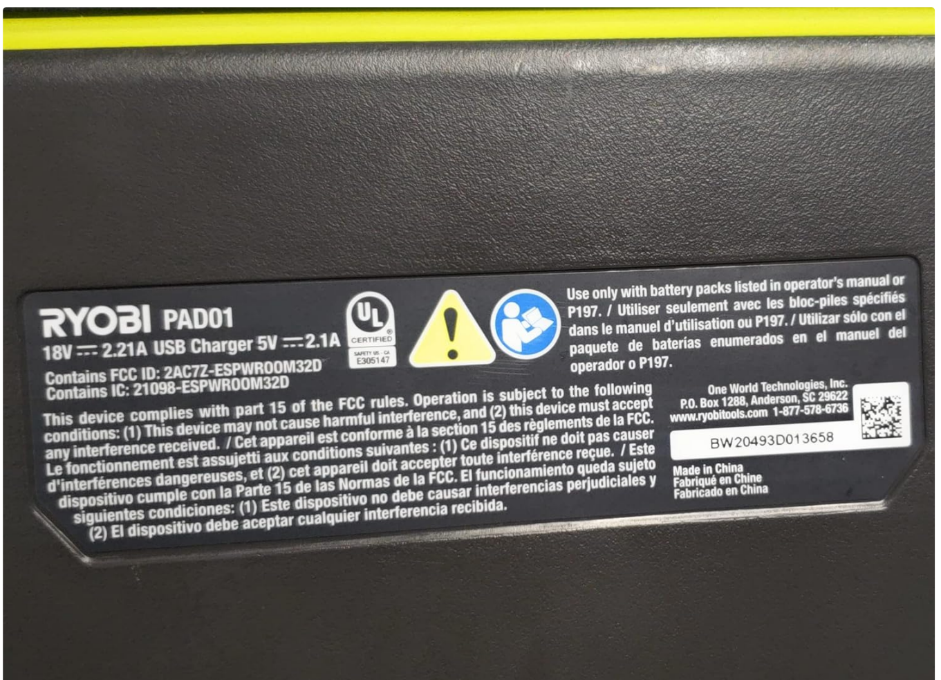
Figure 4.4: Back Label - Provides important regulatory information, model number (PAD01), and USB charger specifications.