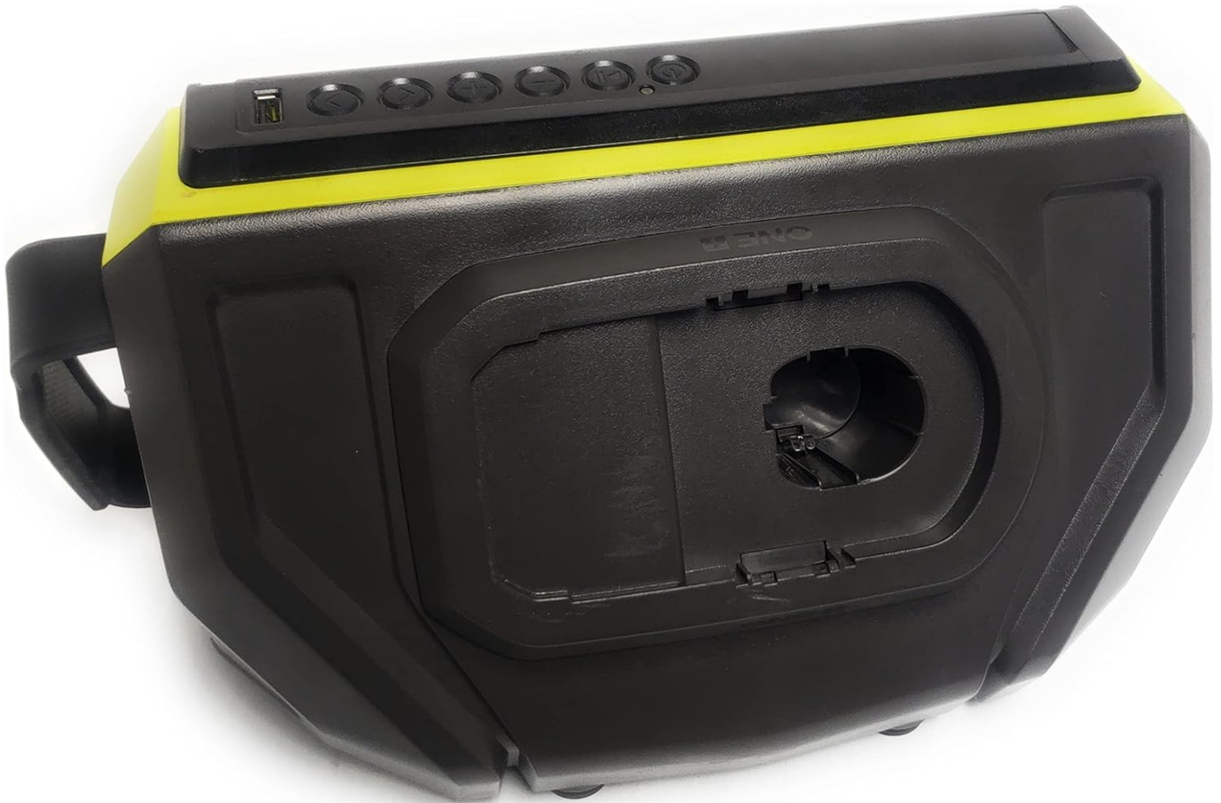
Figure 4.3: Bottom View - Displays the battery compartment where the 18V ONE+ battery is inserted.