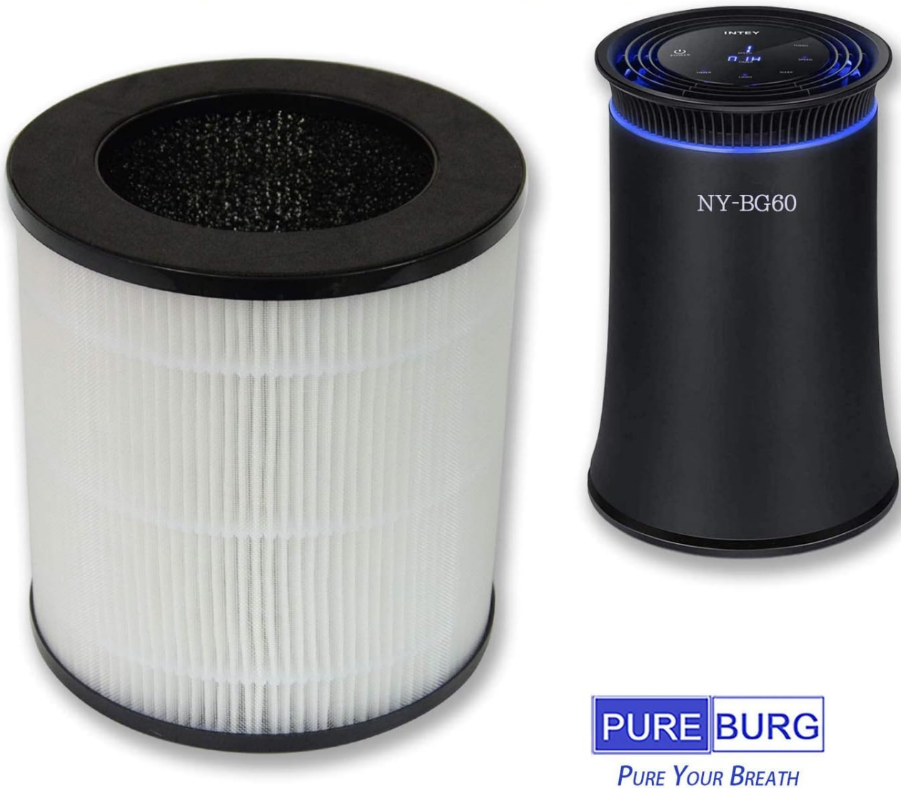
Image: A PUREBURG LW-04 filter positioned next to an INTEY NY-BG60 air purifier, illustrating the filter's compatibility and size relative to the unit.

Compatible with INTEY NY-BG60 (LW-04) Air Purifier (Please match your unit in the main picture)