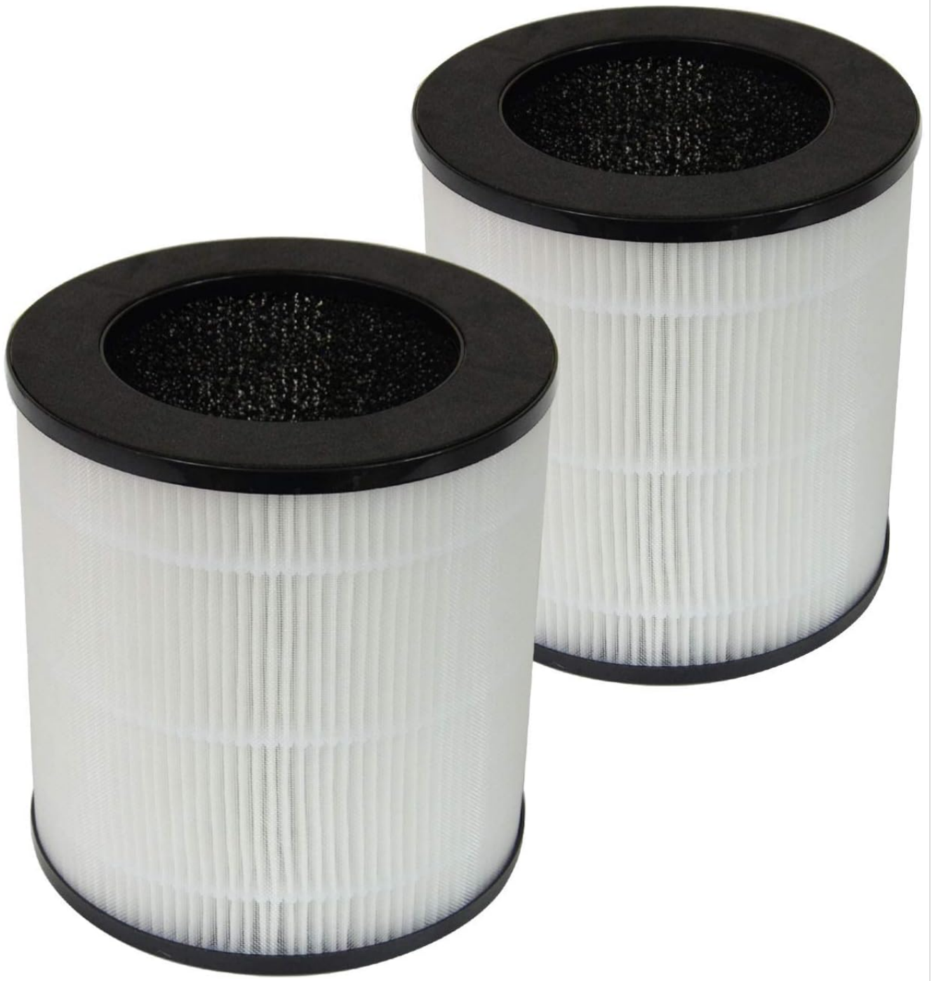
Image: Two PUREBURG LW-04 replacement filters, showcasing their cylindrical design and pleated filter material.