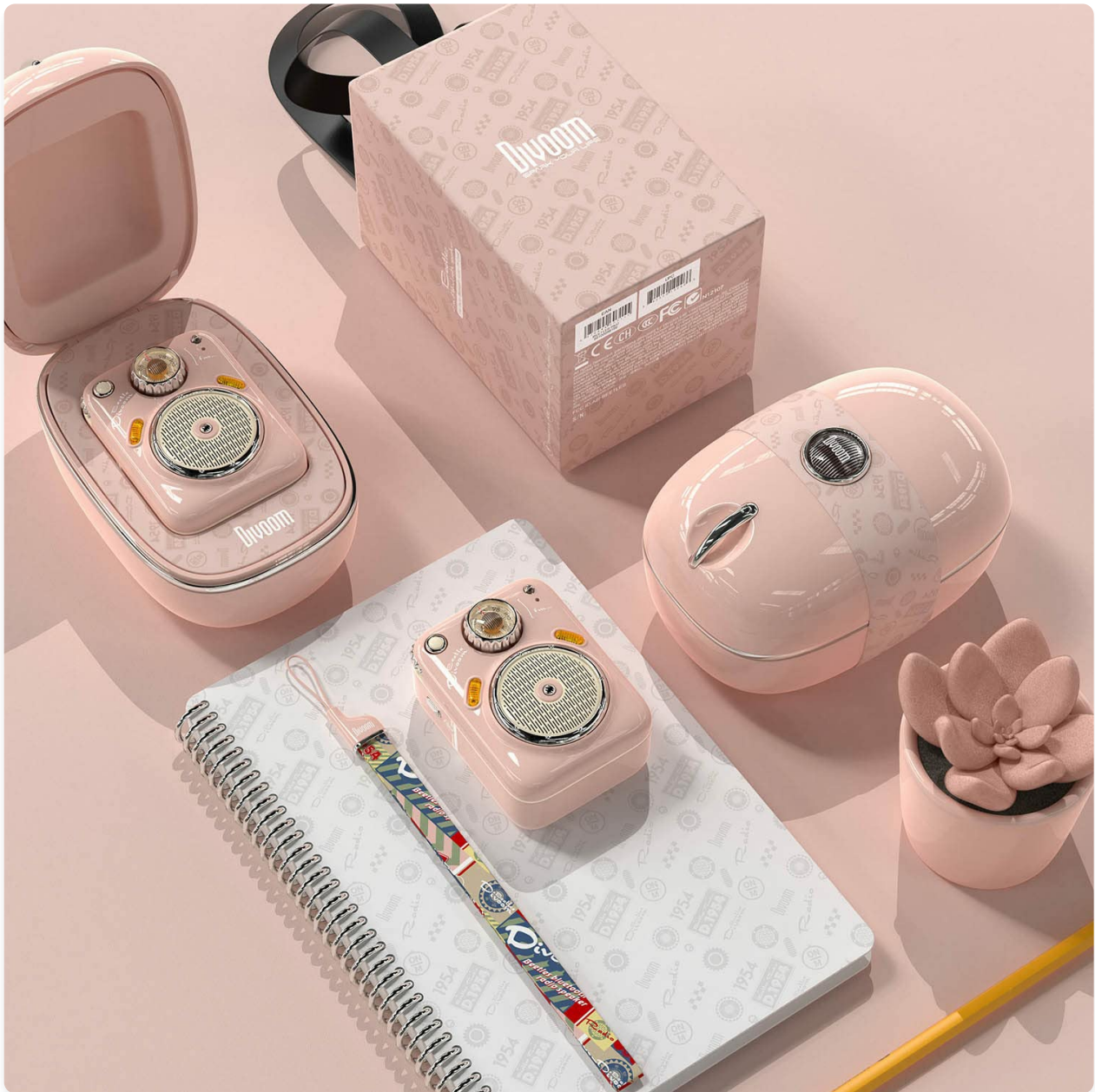
Figure 2: The Divoom Beetles Mini speaker, its carry box, lanyard, and charging cable, as typically found in the package.