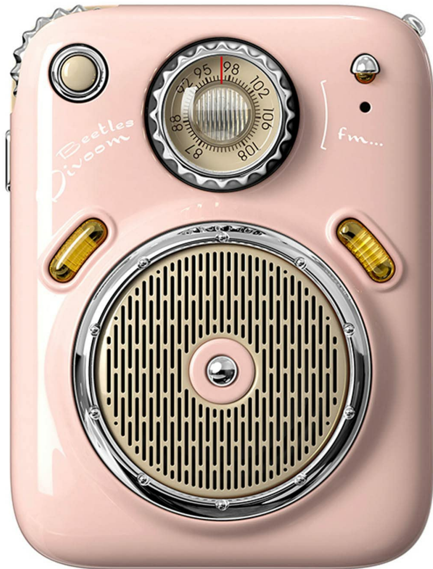
Figure 1: Front view of the Divoom Beetles Mini Bluetooth Speaker in pink.