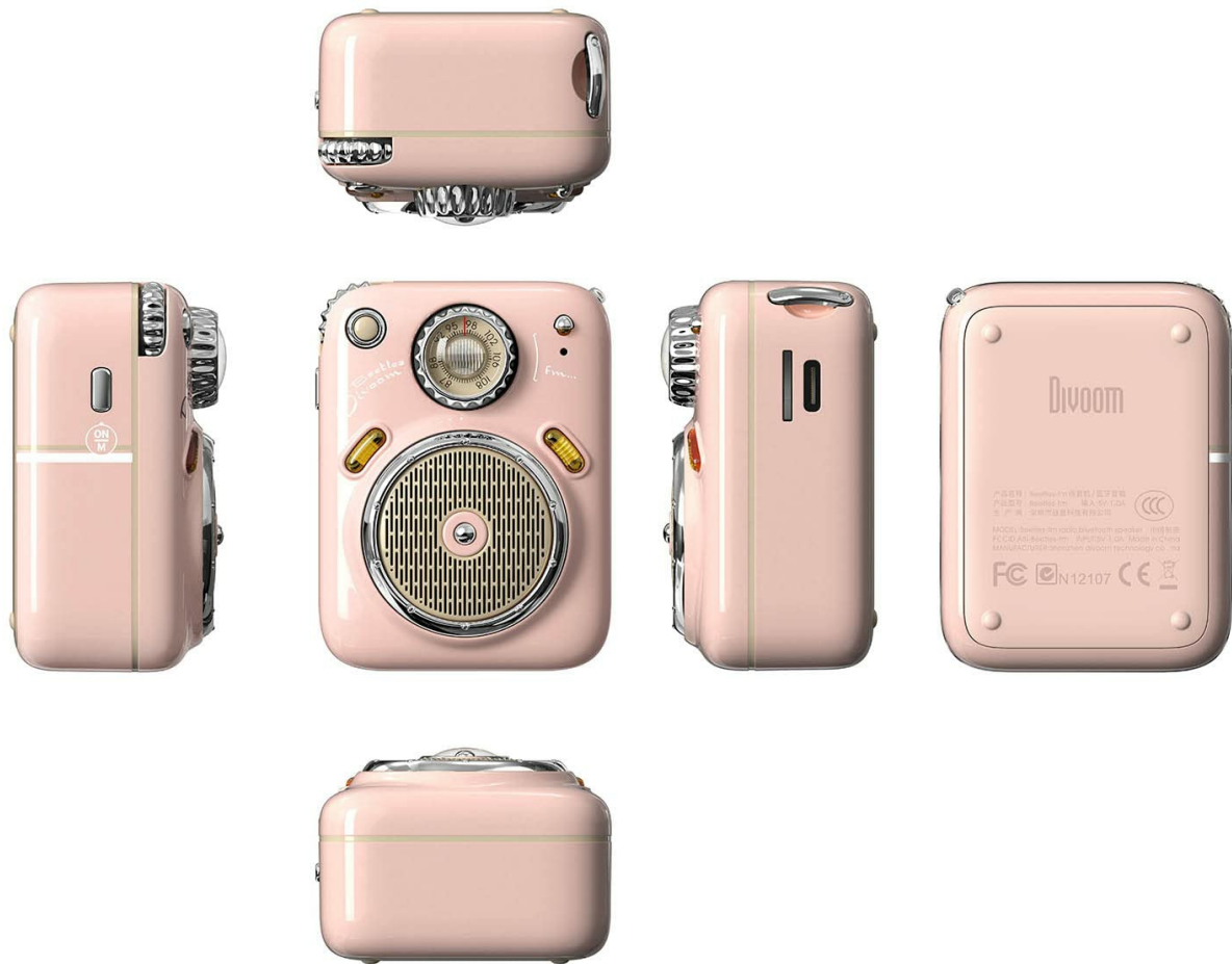
Figure 3: Various angles of the speaker, highlighting the charging port and controls.