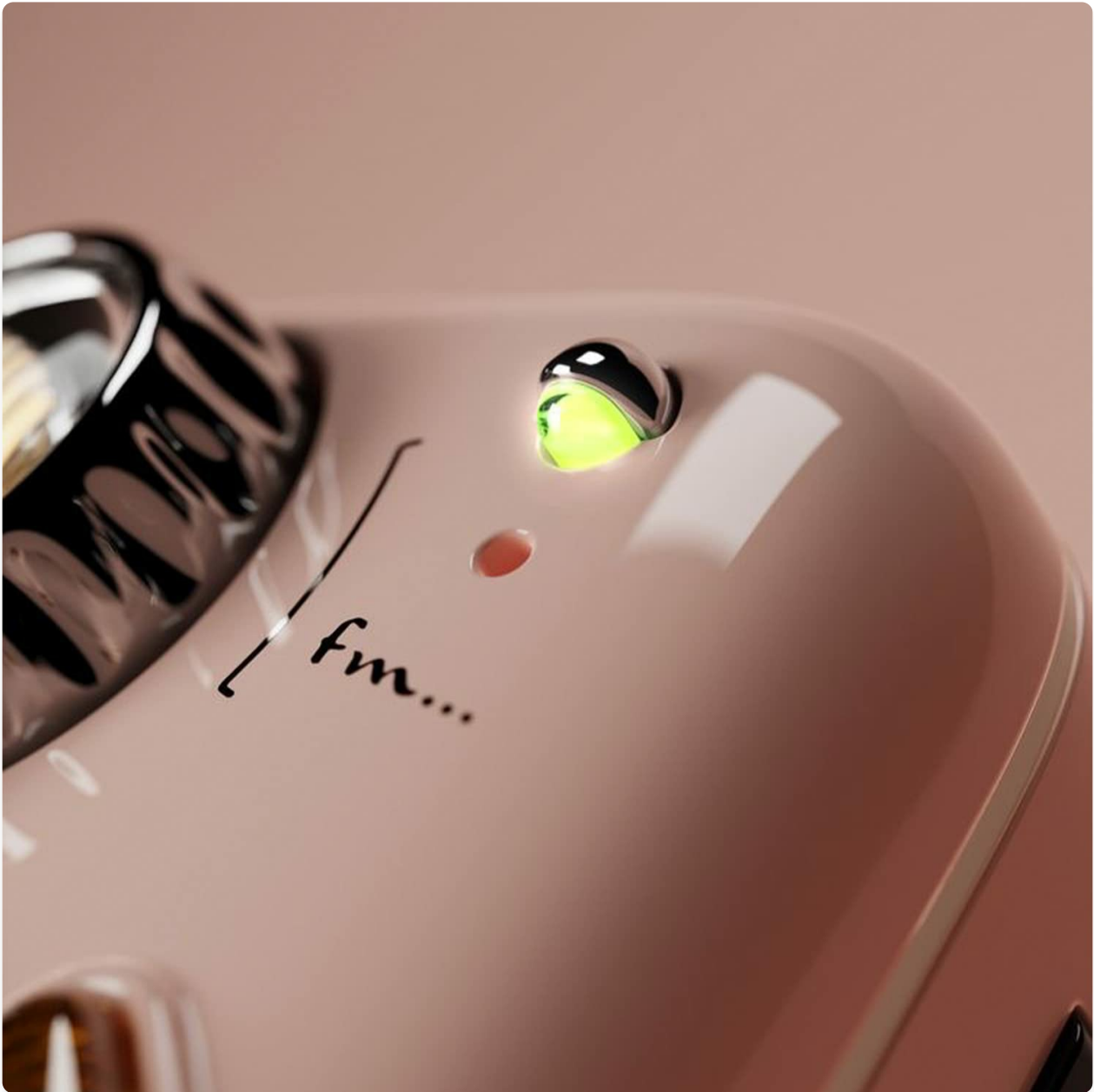
Figure 4: A detailed view of the FM frequency dial and the small indicator light on the speaker's top right.