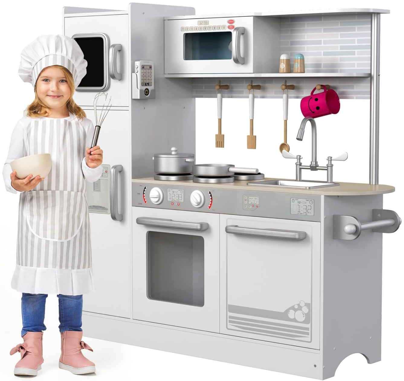
Image Description: An overview of the fully assembled KIDDERY TOYS Wooden Play Kitchen, featuring a young child in chef attire, highlighting its realistic design and interactive elements.