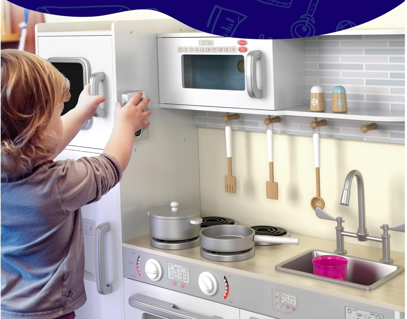
Image Description: A visual representation of the various accessories included with the play kitchen, such as pots, pans, utensils, salt and pepper shakers, a mug, and a toy phone.

With knobs that twist, and doors that open and shut, it's almost as if the kitchen is real!