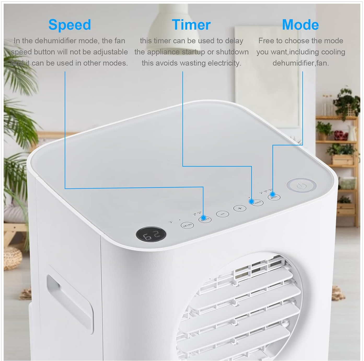
Figure 3: Detailed view of the control panel, showing buttons for Speed, Timer, and Mode selection, along with a digital display for temperature.

The control panel and remote allow you to: