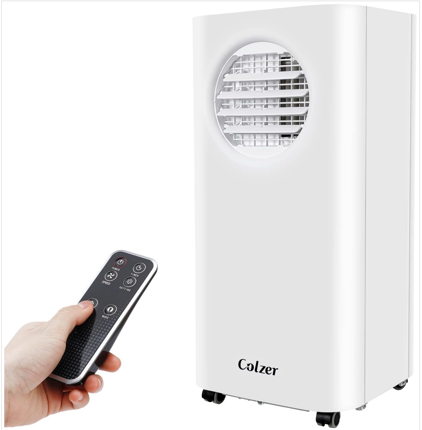
Figure 2: The COLZER Portable Air Conditioner unit and its accompanying remote control, highlighting its sleek design and portability with wheels.