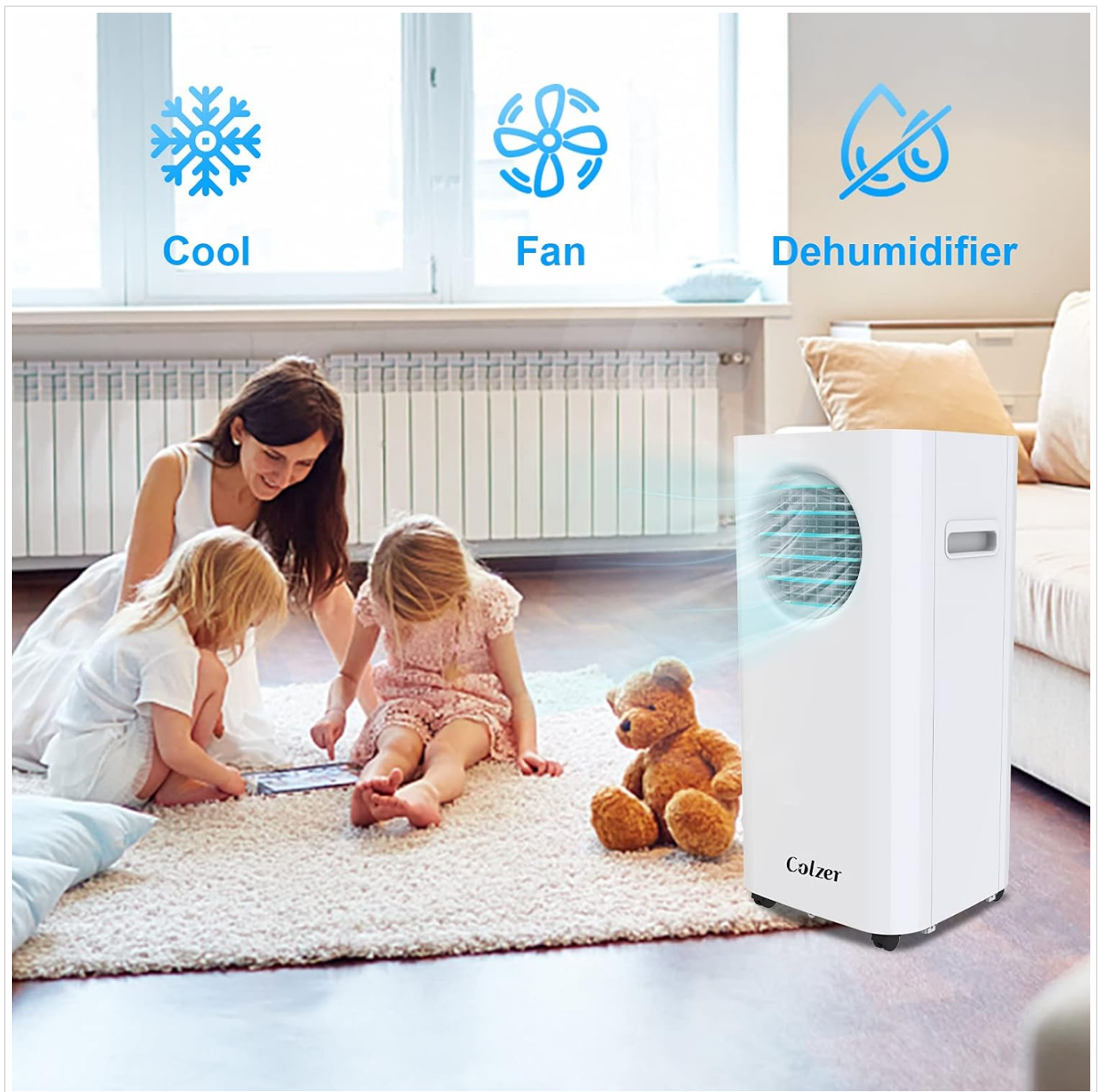
Figure 1: The COLZER Portable Air Conditioner providing comfort in a home setting, demonstrating its multi-functional capabilities as an air conditioner, fan, and dehumidifier.