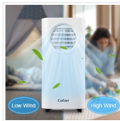
Figure 6: Visual representation of the adjustable fan speeds, offering both low and high wind settings for customized airflow.

Circulate air without cooling or dehumidifying. Choose between low and high fan speeds to suit your preference.