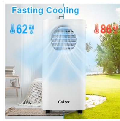
Figure 5: Illustration of the fast cooling capability, showing temperature reduction from 86°F to 62°F.

This mode provides powerful cooling for rooms up to 450 sq ft. Set your desired temperature between 62°F and 86°F. The unit will cool the air and exhaust hot air through the hose.