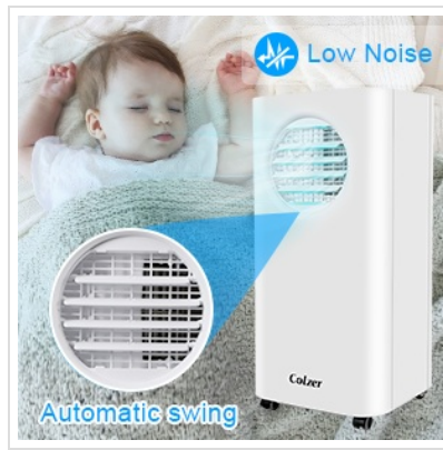
Figure 7: The unit's automatic swing feature, ensuring wide and even air distribution throughout the room.