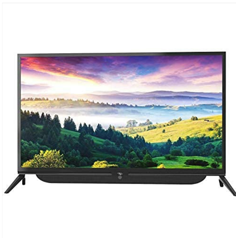
Figure 4.1: Front view of the Itel TV A3210IE with its stand. The television features a slim bezel design and a central stand for stable placement on a flat surface.

Your Itel TV A3210IE can be placed on a stand or wall-mounted. Ensure the TV is placed on a stable surface or securely mounted to a wall.