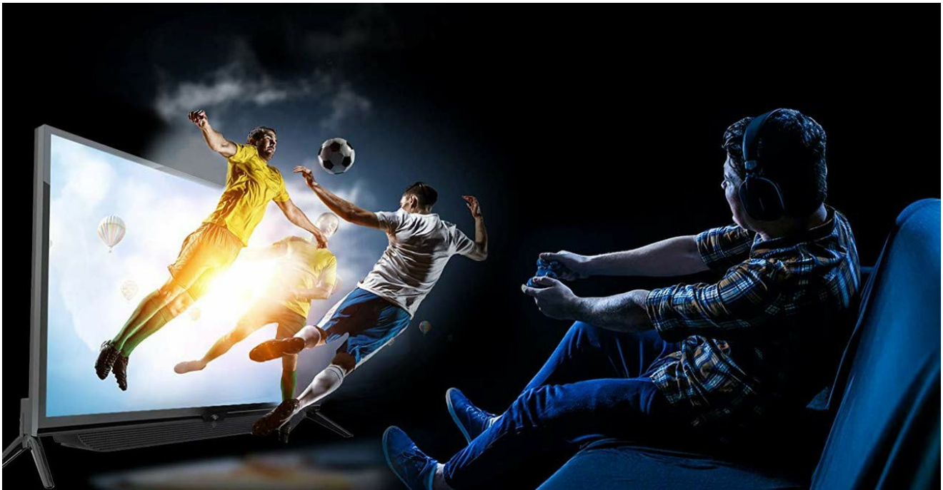
Figure 5.1: A user engaged in gaming on the IteI TV A3210IE. This illustrates the TV's capability to connect with gaming consoles for an immersive entertainment experience.