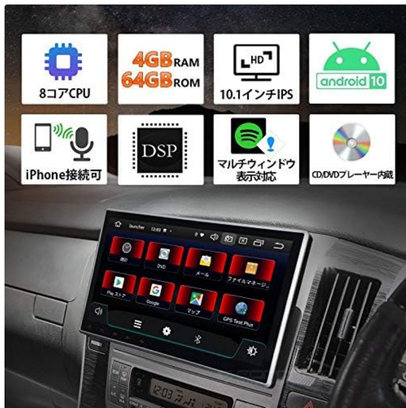
Image: Feature Overview. This infographic summarizes the main technical specifications and functionalities of the device.