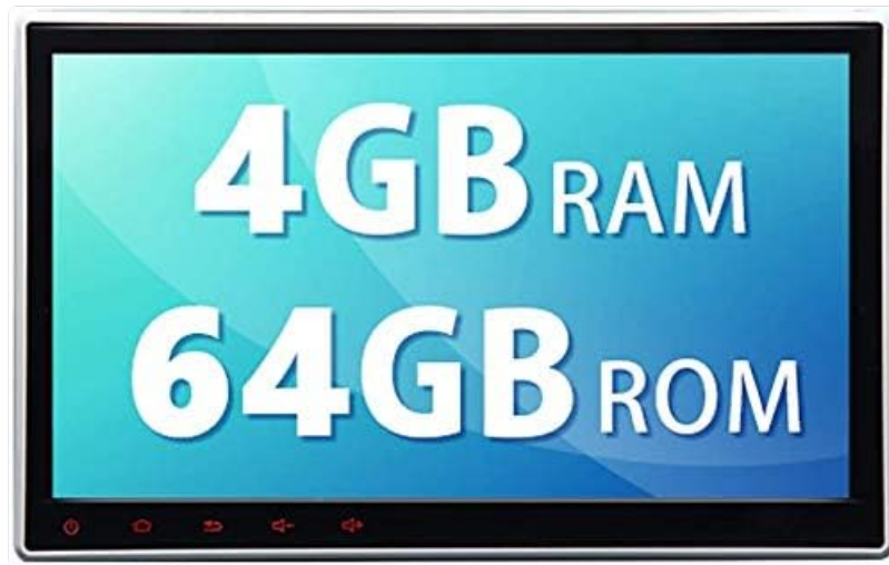
Image: EONON GA2185J Main Unit. This image shows the front of the car navigation system, highlighting its memory specifications.