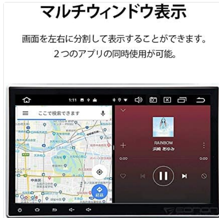
Image: Multi-Window Display. This image illustrates the ability to run two applications side-by-side on the screen, such as navigation and music.

The multi-window feature allows you to split the screen and use two applications simultaneously, enhancing multitasking capabilities.