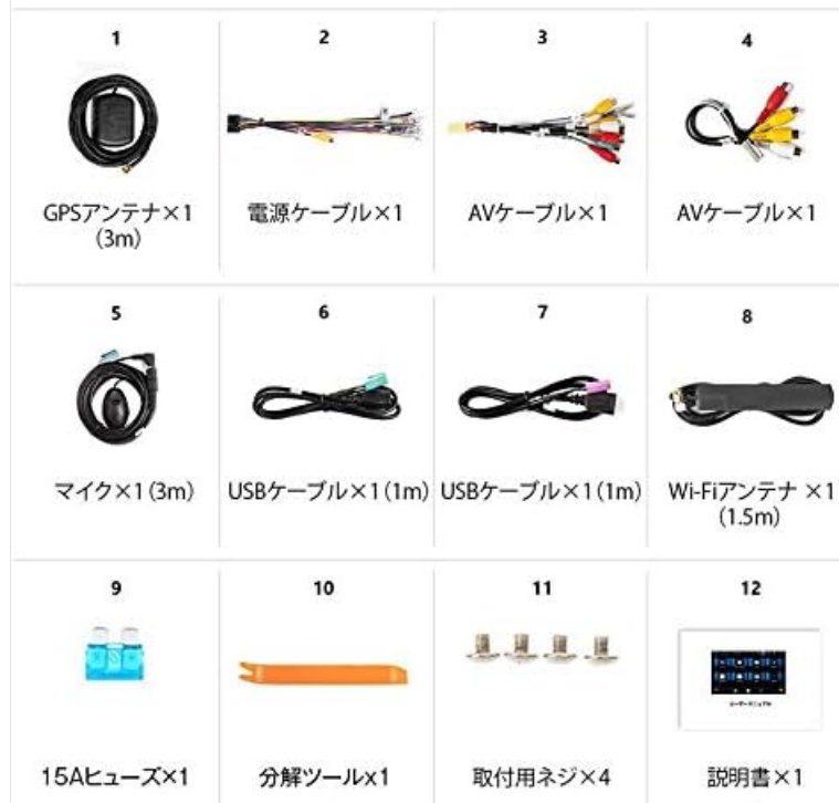
Image: Included Accessories. This image displays all components that come with the EONON GA2185J unit, neatly arranged and numbered for easy identification.