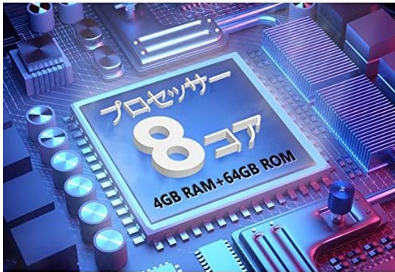
Image: Processor Details. This image highlights the powerful 8-core processor and memory configuration of the system.