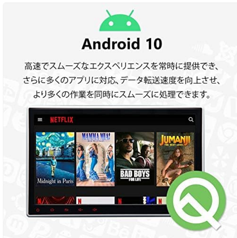
Image: Android 10 Interface. This image demonstrates the Android 10 operating system running on the device, showcasing its multimedia capabilities.

Your device runs on Android 10, offering a familiar and intuitive user interface. It supports a wide range of applications and provides a smooth, responsive experience.