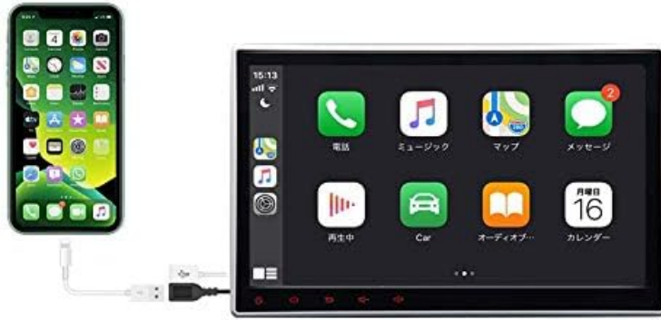
Image: iPhone Connectivity. This image shows an iPhone connected to the car stereo, demonstrating the mirroring functionality for seamless integration.

このカーステレオは運転中の安全を考慮して設計したものです。iPhoneと簡単に接続し、iPhoneのボイスアシスタントと話したりディスプレイに触れるだけで、ナビゲーション情報を取得したり、電話をかけたり、音楽を楽しむことができます。