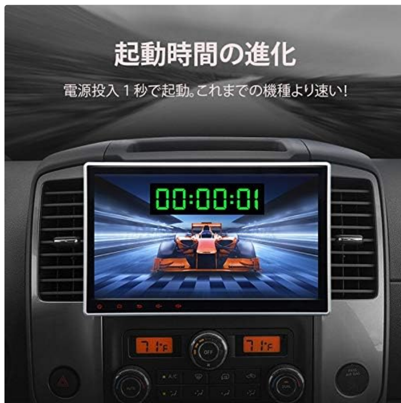
Image: Fast Boot Time. This image demonstrates the system's quick startup, powering on in approximately 1 second.

The system is designed for a fast and smooth user experience, supporting numerous applications and improving data transfer speeds for efficient multitasking.