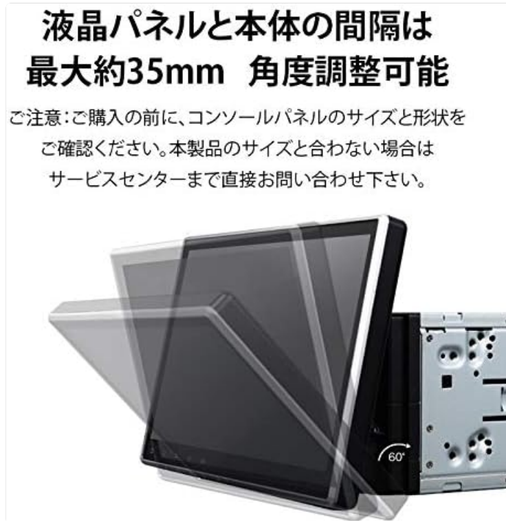
Image: Adjustable Screen Angle. This diagram illustrates how the screen can be tilted to achieve the best viewing position.

The unit features an adjustable screen, allowing for a gap of up to approximately 35mm between the LCD panel and the main unit for optimal viewing angles.