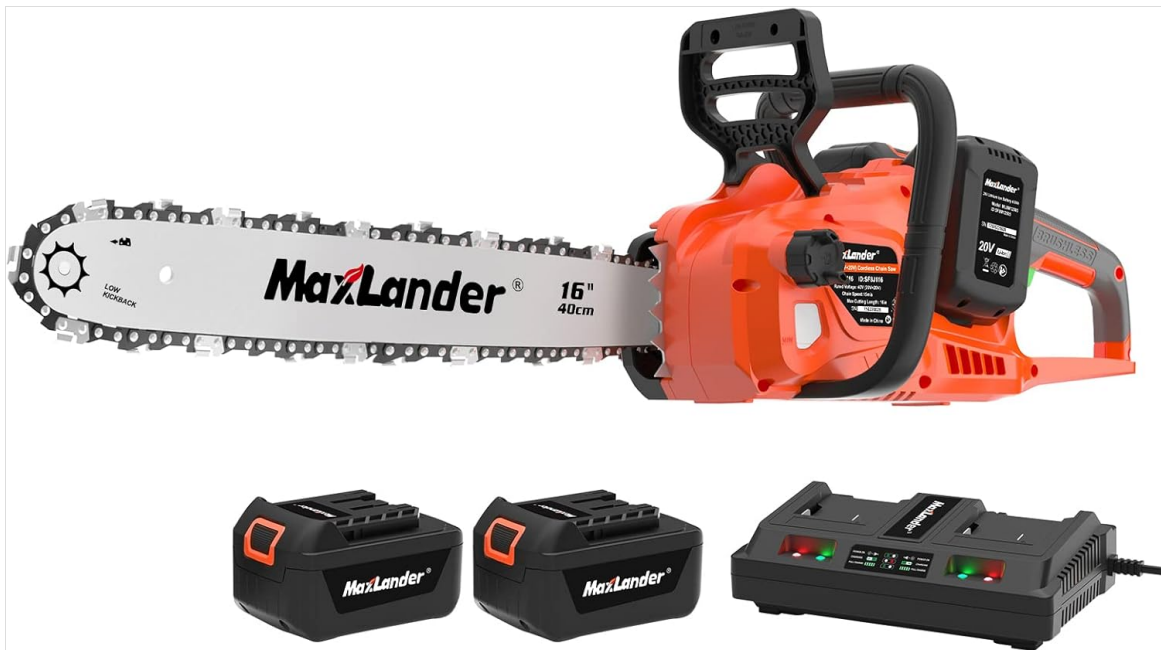
Figure 7.1: MAXLANDER 40V Cordless Brushless 16-Inch Chainsaw and included accessories.