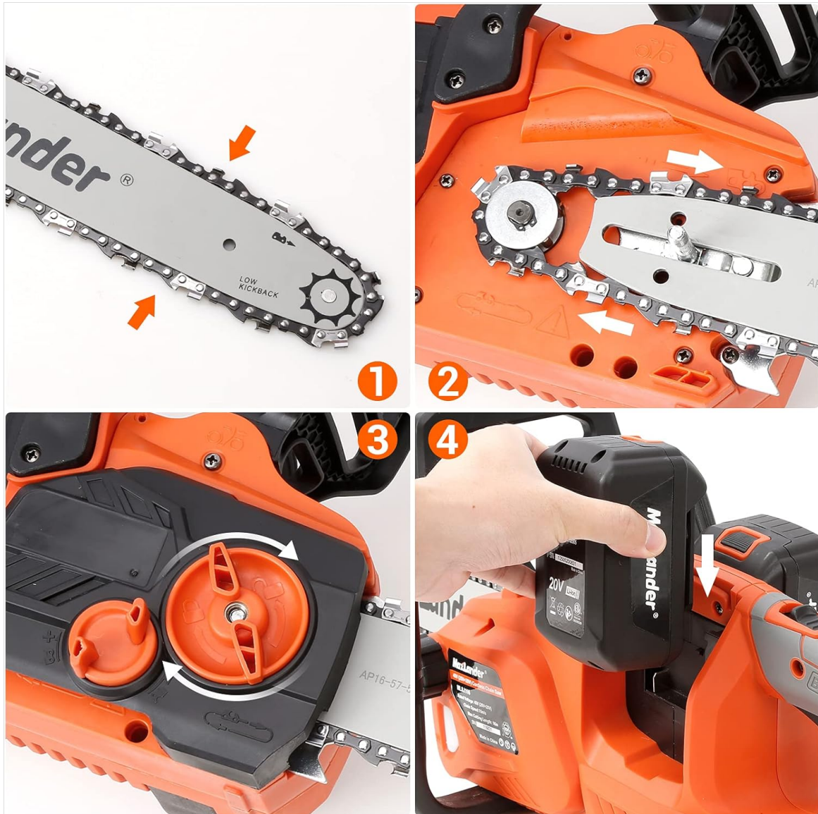
Figure 3.1: Visual guide for chain and bar installation, tension adjustment, and battery insertion.