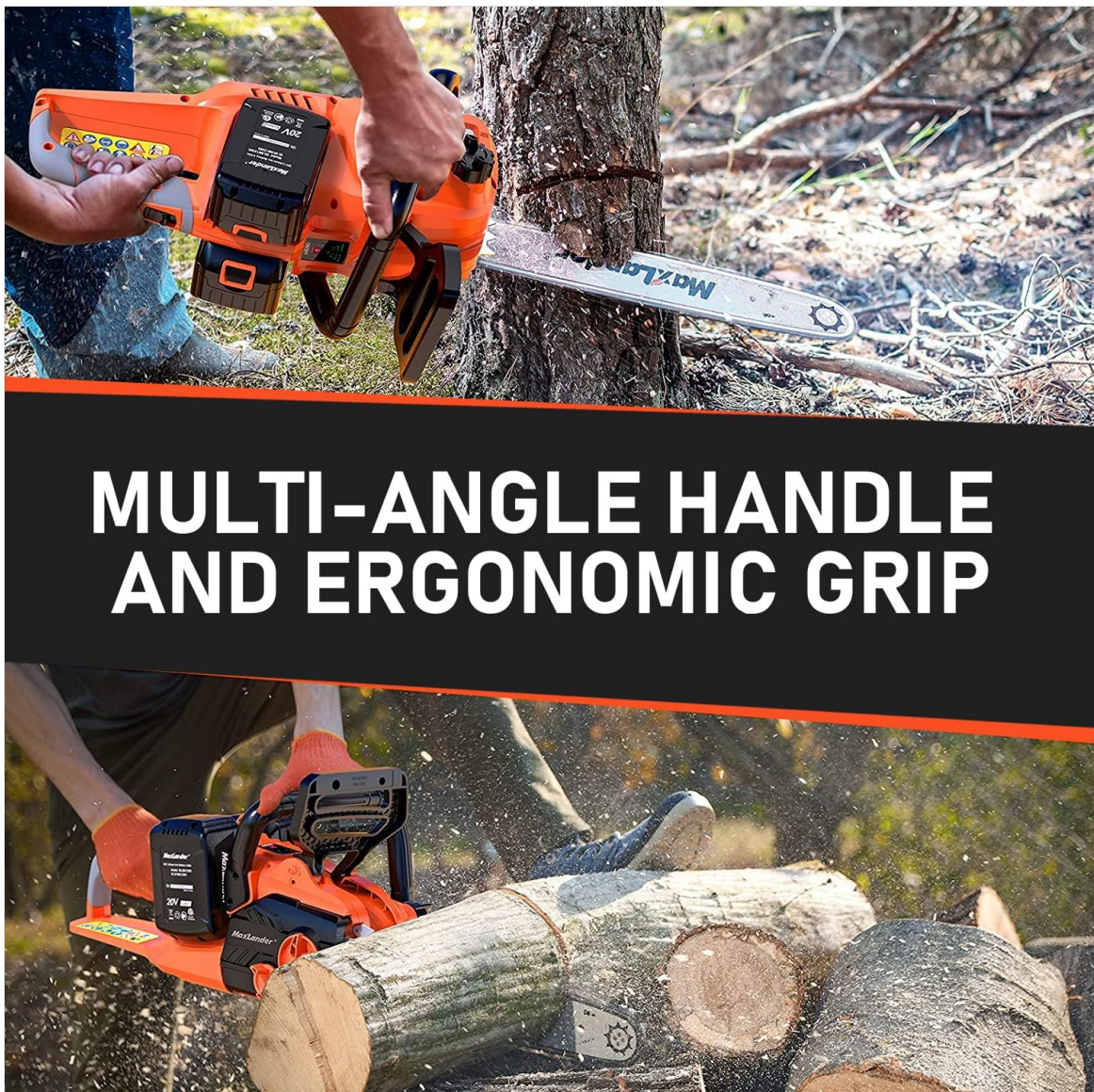
Figure 4.2: Chainsaw in use, highlighting the multi-angle handle and ergonomic grip for various cutting positions.