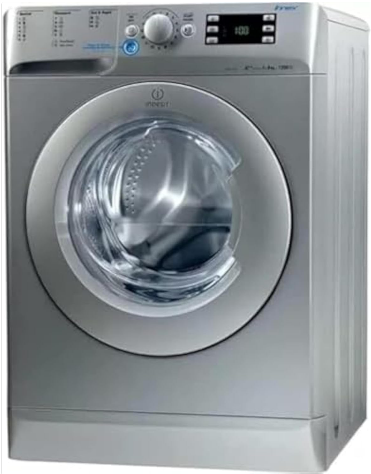
Figure 1: Front view of the Indesit XWE 81283X S EU washing machine. This image shows the front of the silver Indesit XWE 81283X S EU washing machine. Visible features include the control panel at the top, the detergent dispenser drawer on the left, the central program selector knob, and the digital display on the right. The large circular door for the front-load drum is prominent in the center.