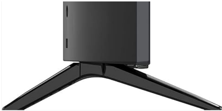
Image: Front view of the Syinix 50T730U TV with its stand attached, ready for use.

Alternatively, for wall mounting, use a VESA compatible bracket (200mm x 200mm) (not included). Refer to the wall mount instructions for proper installation.