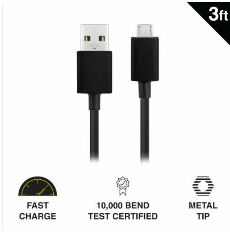
Image: Key features of the iHip Micro USB cable, highlighting its fast charge capability, durability, and robust metal tip.