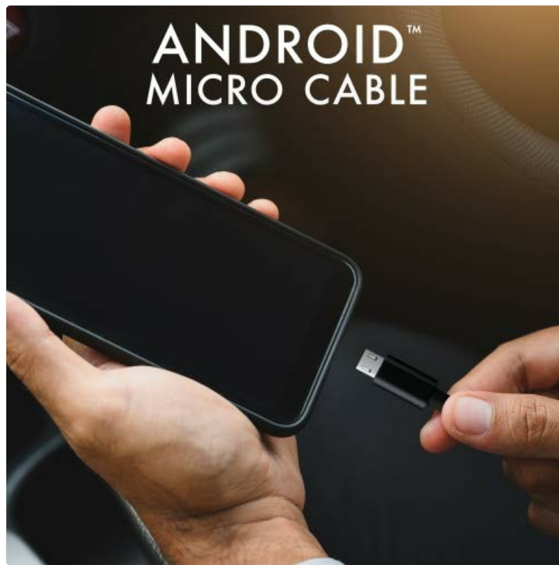
Image: Connecting the iHip Micro USB cable to a smartphone. The cable is designed for easy and secure connection.