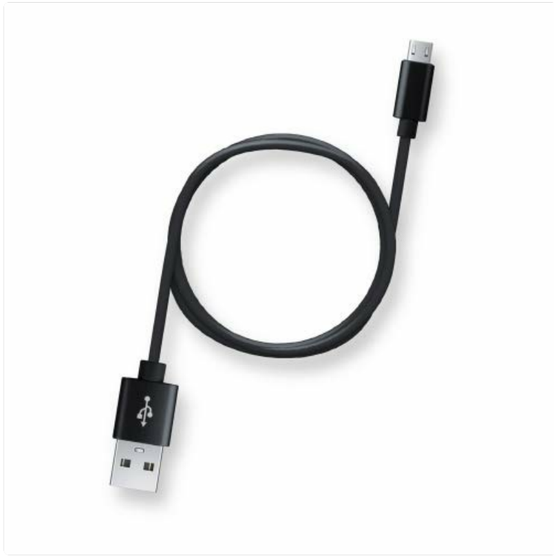
Image: The iHip 3ft PVC Micro USB cable, showcasing its compact and flexible design.