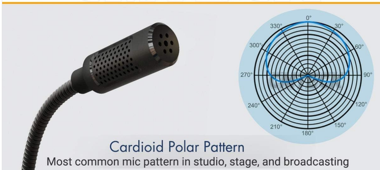
Image 1: Advanced Noise-Cancelling Technology and Cardioid Polar Pattern. This image illustrates the microphone's internal CCS 2.0 smart chip for noise reduction and echo cancellation. It also shows a polar pattern diagram, indicating the microphone's cardioid pickup, which primarily captures sound from the front.

Built-in high performance CCS 2.0 SMART CHIP for echo cancellation and noise reduction. Crystal Clear Sound 2.0