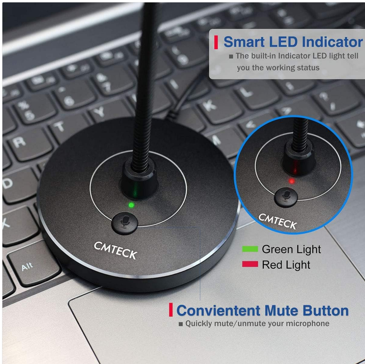
Image 4: Smart LED Indicator and Mute Button. This close-up image of the microphone base highlights the mute button and the LED indicator. It visually explains that a green light signifies the microphone is active, while a red light indicates it is muted.