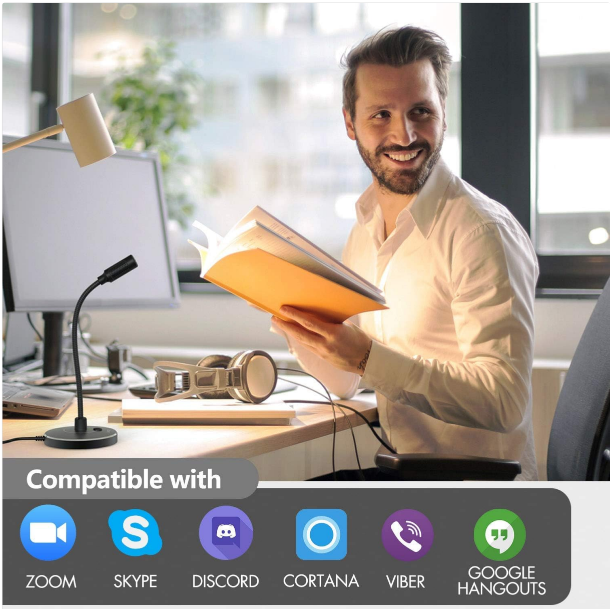
Image 5: Wide Compatibility. This image demonstrates the microphone's compatibility with popular communication and recording applications such as Zoom, Skype, Discord, Cortana, Viber, and Google Hangouts, shown alongside a user operating the microphone with a laptop.