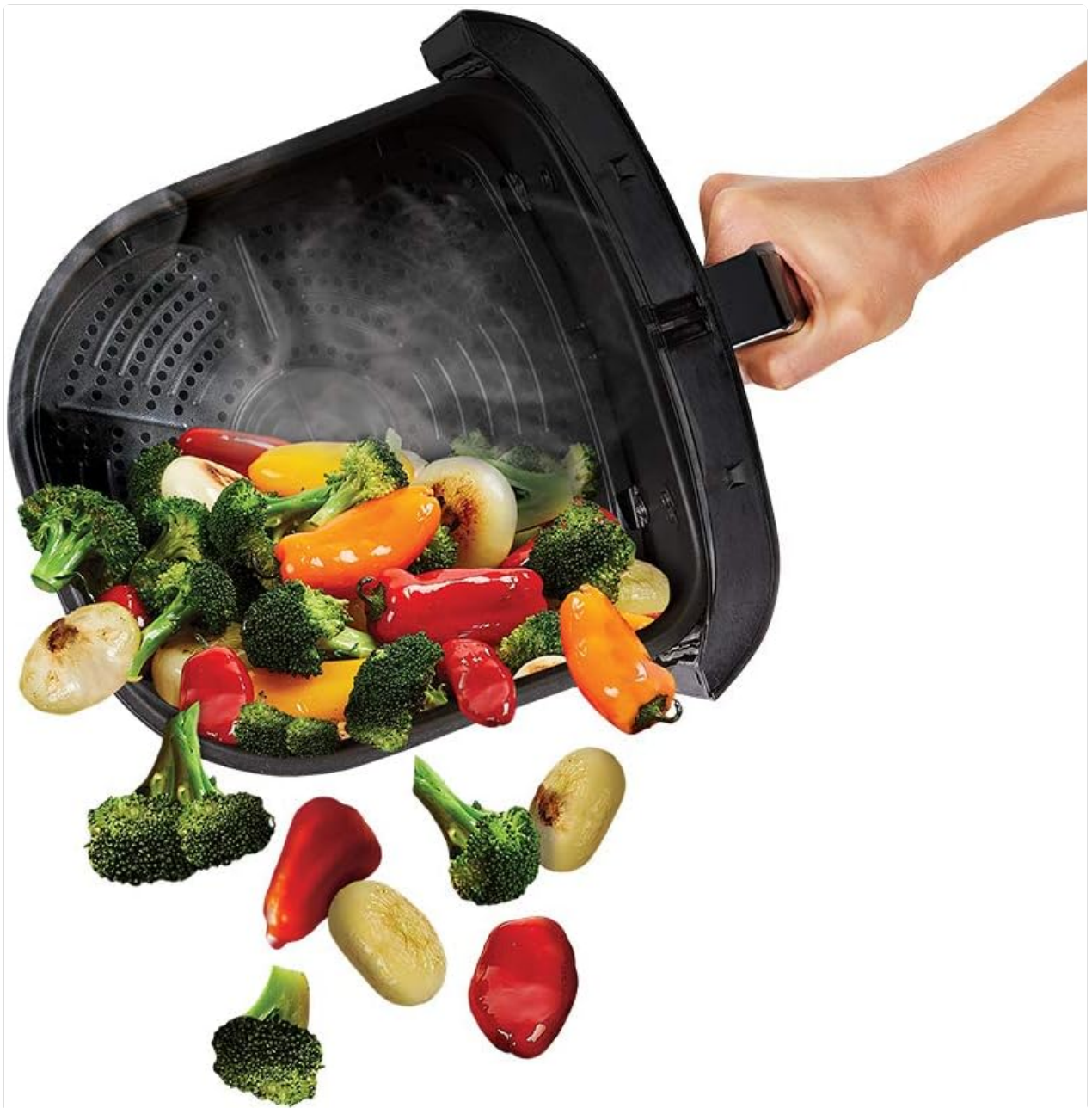
A hand is shown pouring a mix of cooked vegetables, including broccoli, bell peppers, and onions, from the PowerXL Air Fryer Steamer's cooking basket, illustrating the ease of serving.