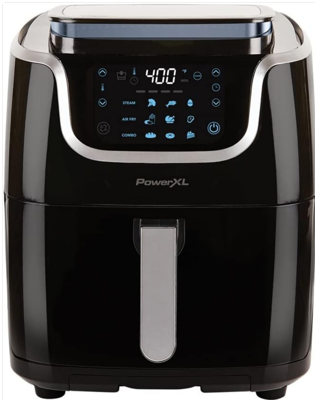
Close-up of the digital control panel showing temperature, time, and various cooking function icons like Steam, Air Fry, and Combo.