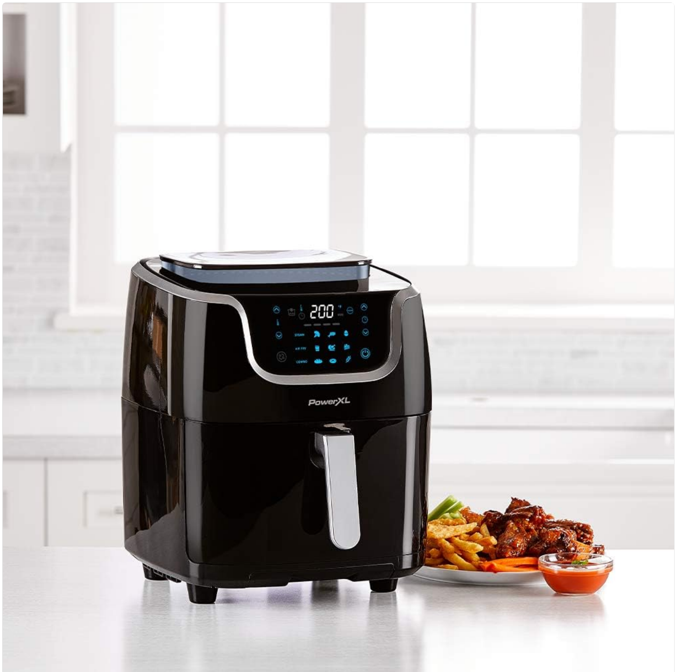
The PowerXL Air Fryer Steamer Combo placed on a kitchen counter, with a plate of cooked food next to it, demonstrating its use in a home environment.