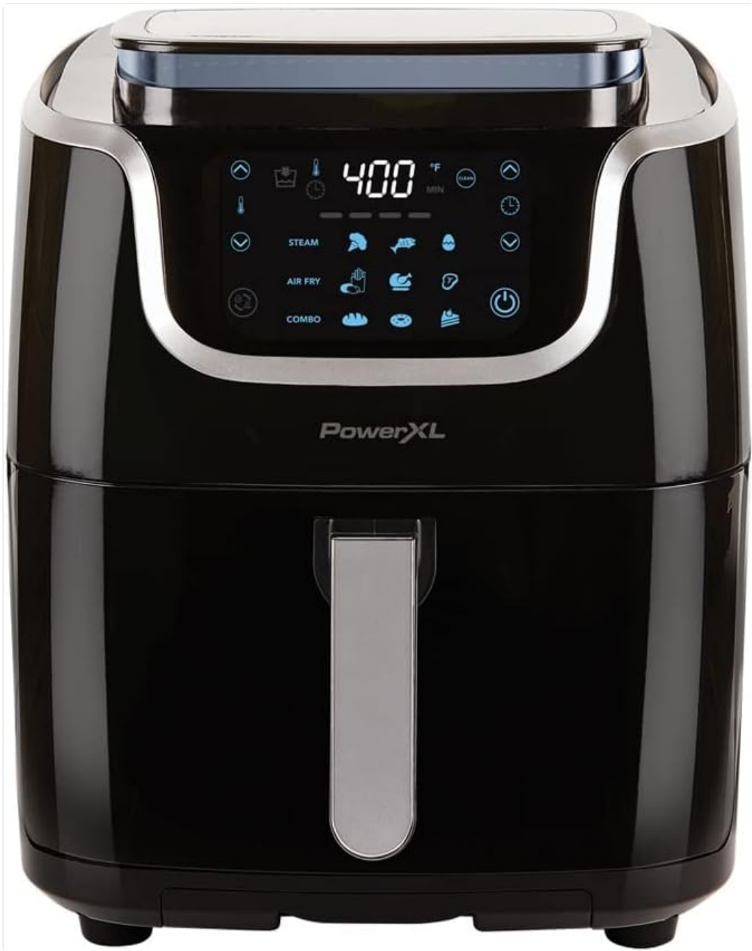
Front view of the PowerXL Air Fryer Steamer Combo, showing the digital control panel and handle.