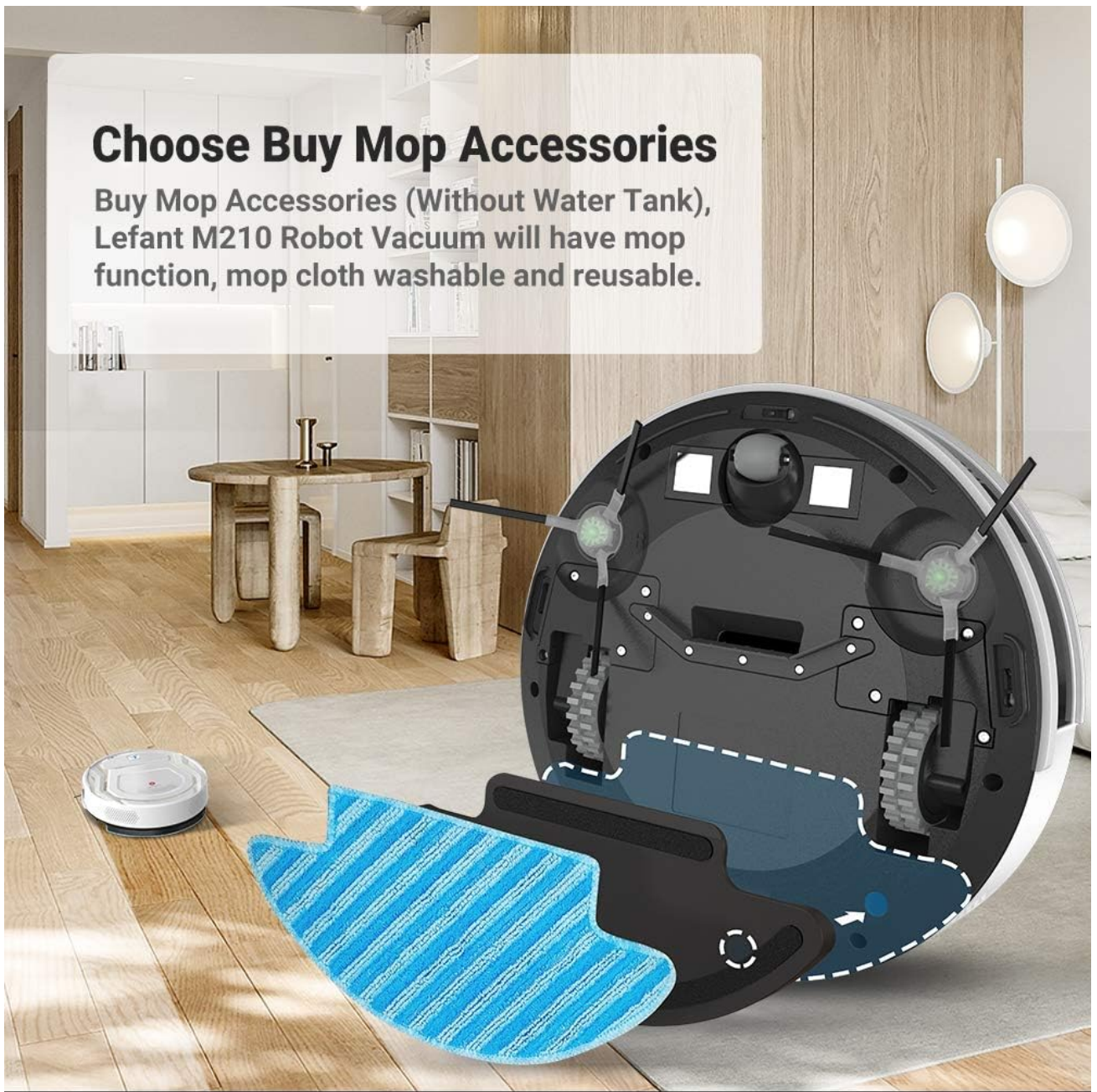
Image: Lefant M210 Robot Vacuum with its mopping accessory attached, showing the underside.

Buy Mop Accessories (Without Water Tank), Lefant M210 Robot Vacuum will have mop function, mop cloth washable and reusable.