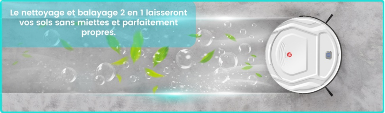
Image: The Lefant M210 robot vacuum cleaner shown with its mopping accessory.

Le nettoyage et balayage 2 en 1 laisseront vos sols sans miettes et parfaitement propres.