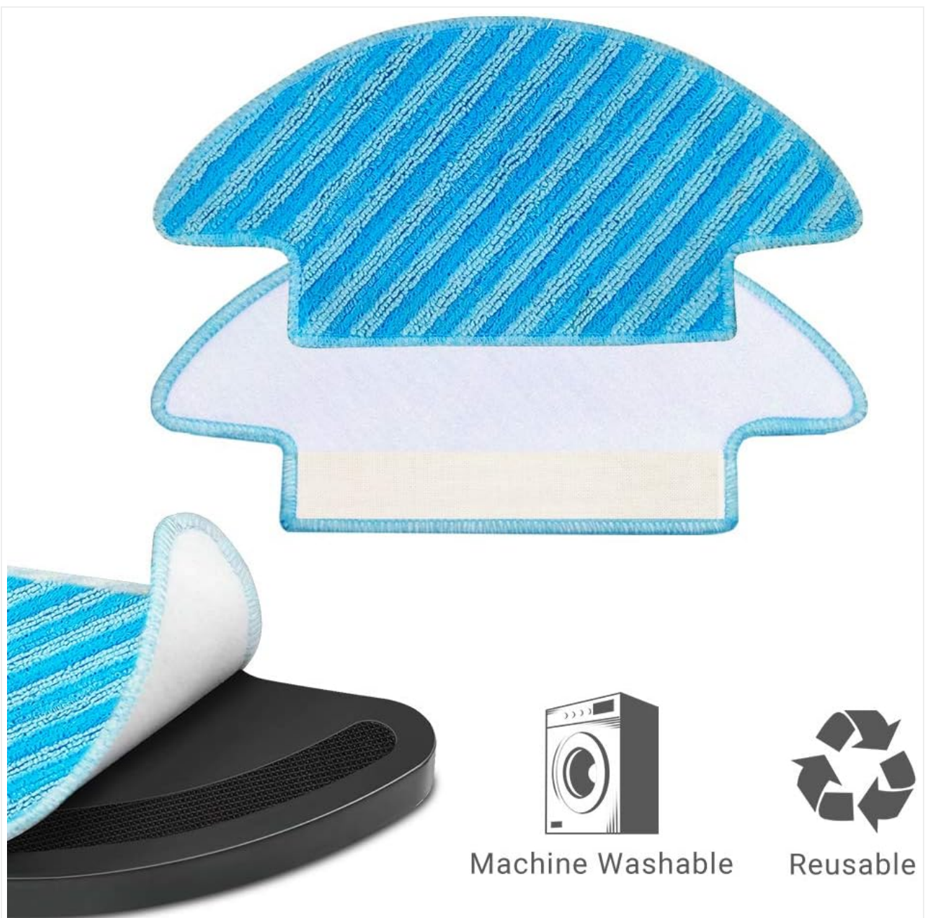
Image: Close-up of the mop cloth, highlighting its machine washable and reusable properties.