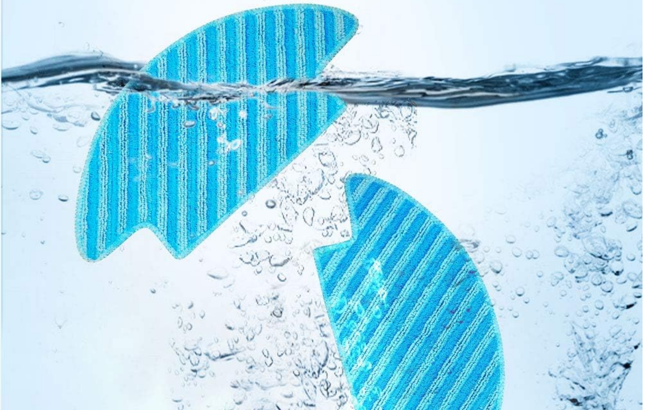
Image: Illustration showing the mop cloth being washed, emphasizing its reusability.