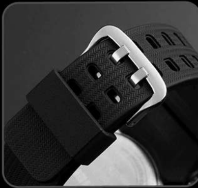
Double-row watch buckle