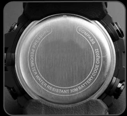
Stainless Steel Back