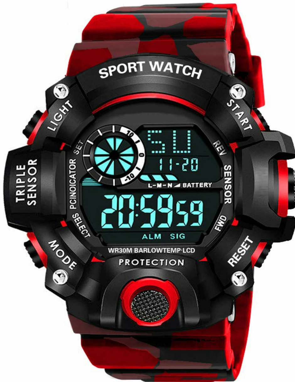
Image 1.1: Front view of the Shockshop Digital Sports Watch W315RED.