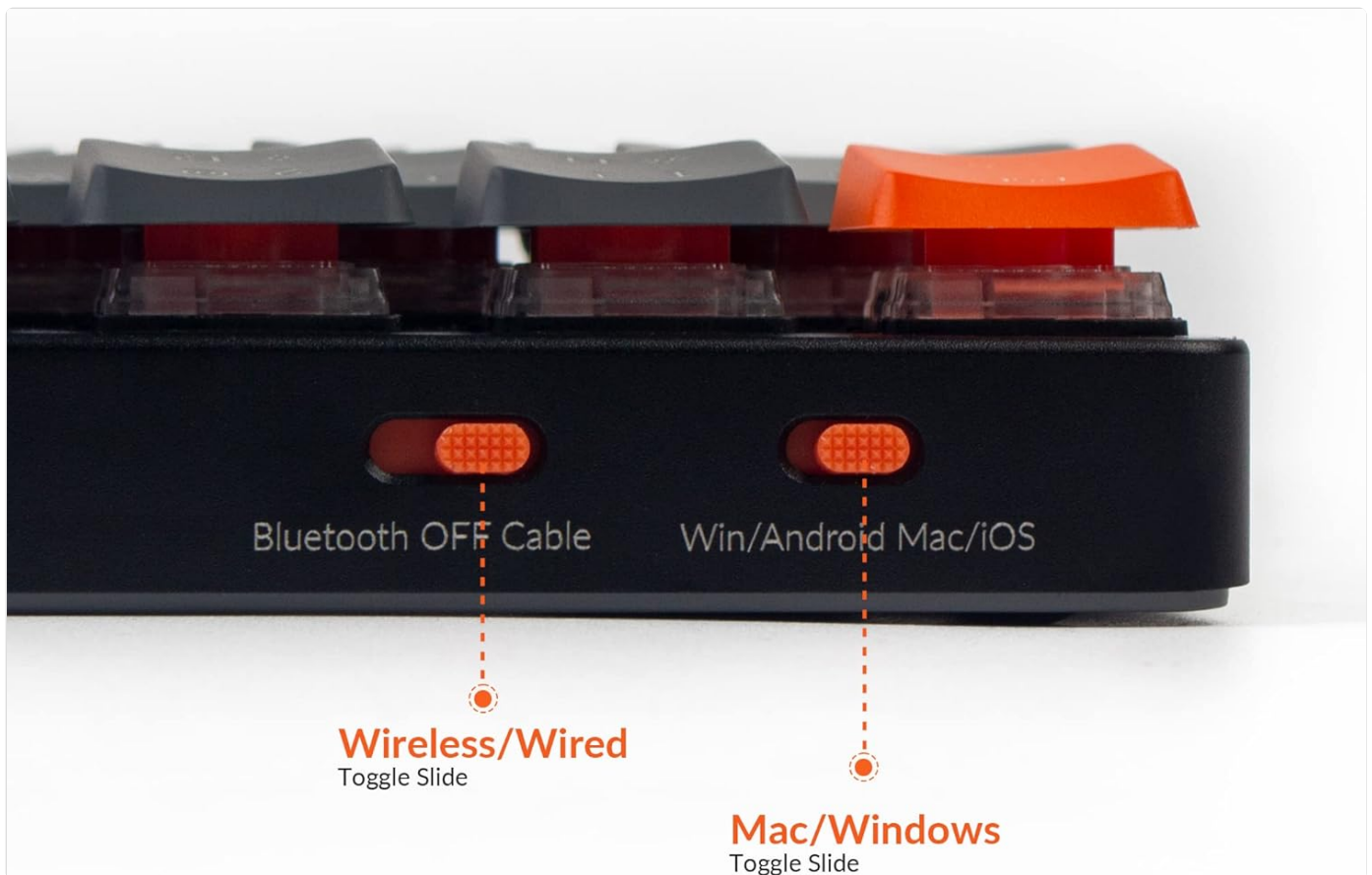
Figure 6: Close-up view of the Keychron K7 keyboard, showing the exposed low-profile Gateron mechanical brown switches beneath the keycaps.

The K7 utilizes redesigned low-profile Gateron mechanical switches, which are 40% slimmer than conventional switches. This design results in a shorter pre-travel and total travel distance, providing faster input and feedback for an enhanced typing experience.