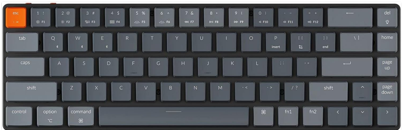
Figure 1: Top-down view of the Keychron K7 keyboard, showcasing its compact 65% layout with an orange Esc key and gray keycaps.

The Keychron K7 is a compact 65% layout ultra-slim wireless mechanical keyboard designed for peak productivity and a superior tactile typing experience. It offers versatile connectivity options and a customizable RGB backlight, making it suitable for various computing environments including Mac and Windows systems.