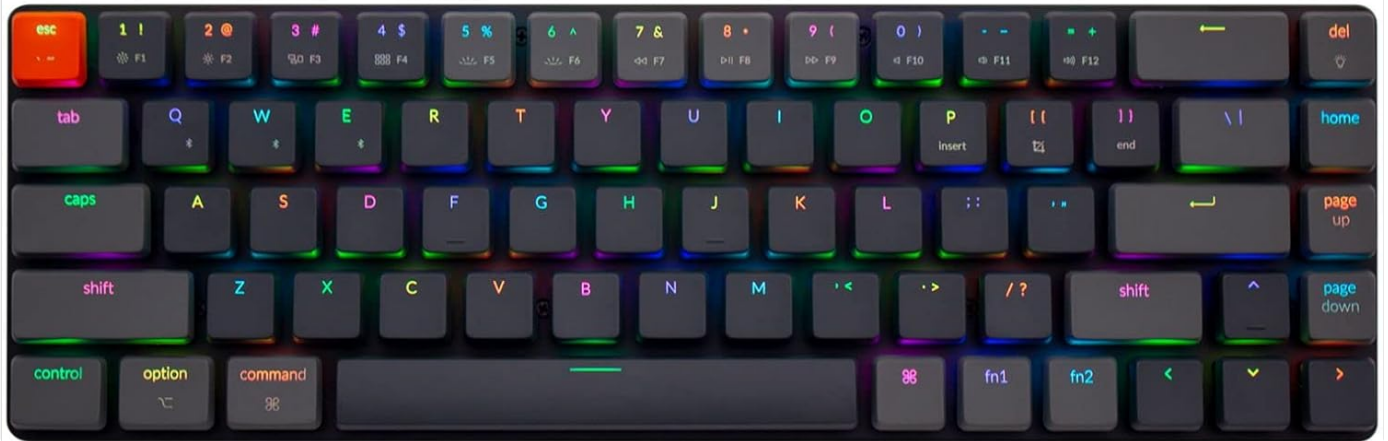
Figure 5: Top-down view of the Keychron K7 keyboard, illuminated with a vibrant RGB LED backlight, showcasing various colors across the keys.