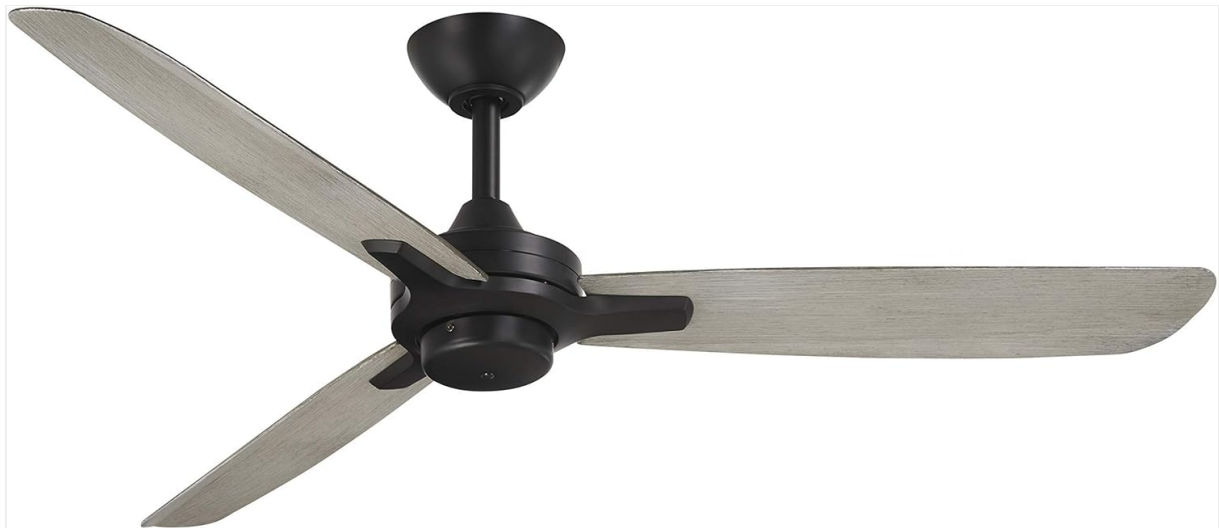
Image 1: Minka-Aire Rudolph Ceiling Fan (Model F727-CL/SVG) in Coal finish with Savannah Grey blades.

The Minka-Aire Rudolph F727-CL/SVG Ceiling Fan is designed to provide efficient air circulation and enhance the aesthetic of your living space. This model features a Coal (Black) finish with three Savannah Grey blades, offering a modern farmhouse style. It is suitable for various rooms including living rooms, kitchens, and bedrooms, providing year-round comfort.