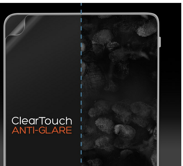
Image: Visual comparison demonstrating the anti-smudge properties of the ClearTouch Anti-Glare screen protector versus a standard screen.

BoxWave ClearTouch Anti-Glare Screen Protector