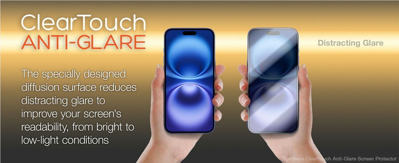
Image: Illustration showing how the anti-glare feature reduces distracting reflections on a smartphone screen.