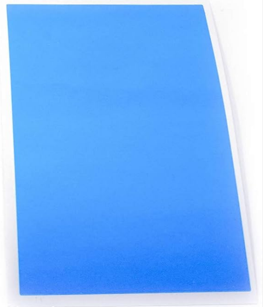
Dust Removing Sticker

Image: Close-up view of the included accessories: Applicator Card, Microfiber Cleaning Cloth, and Dust Removing Sticker.