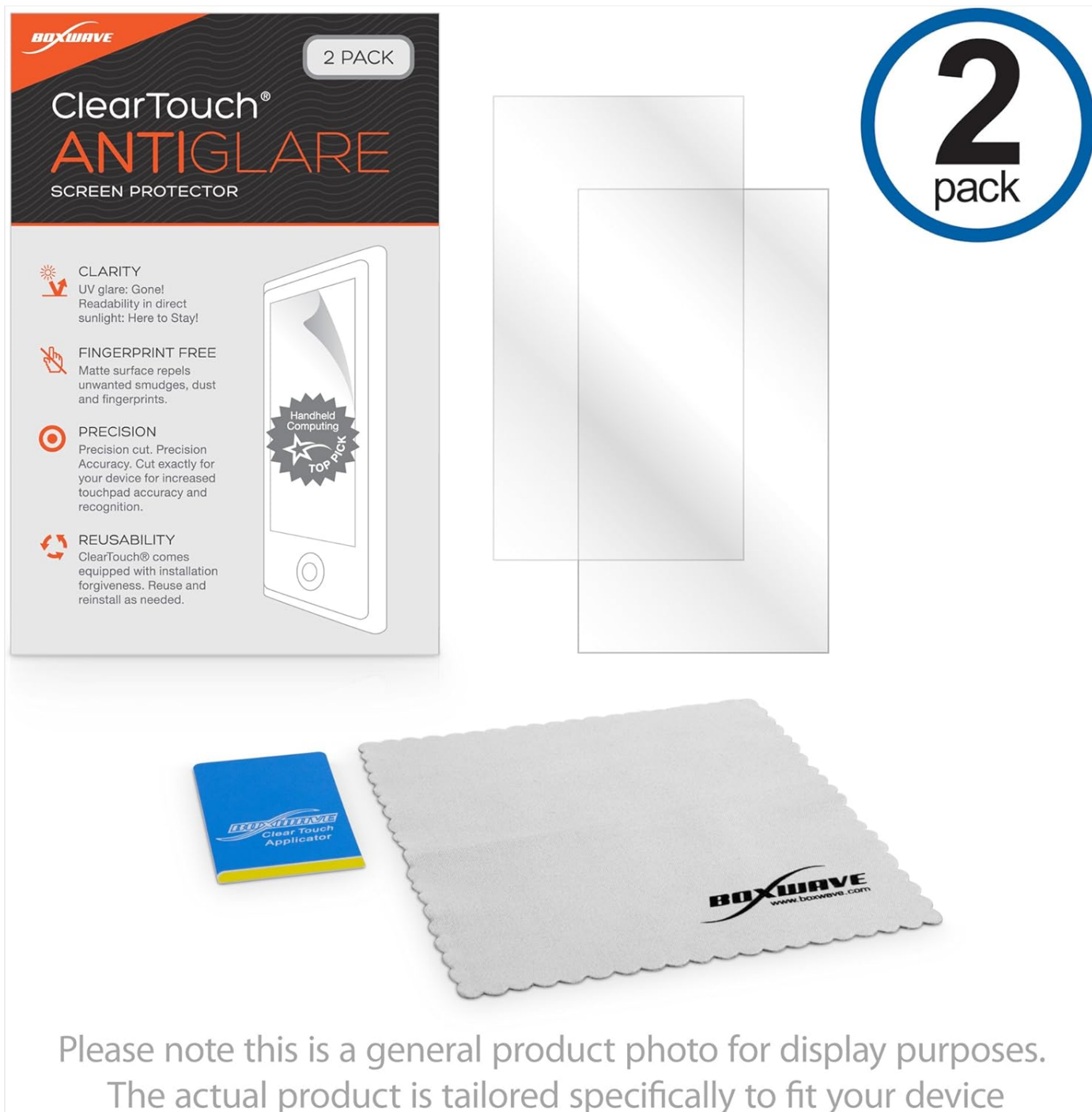
Image: Contents of the BoxWave ClearTouch Anti-Glare Screen Protector package, showing two screen protectors, an applicator card, a microfiber cloth, and a dust removing sticker.