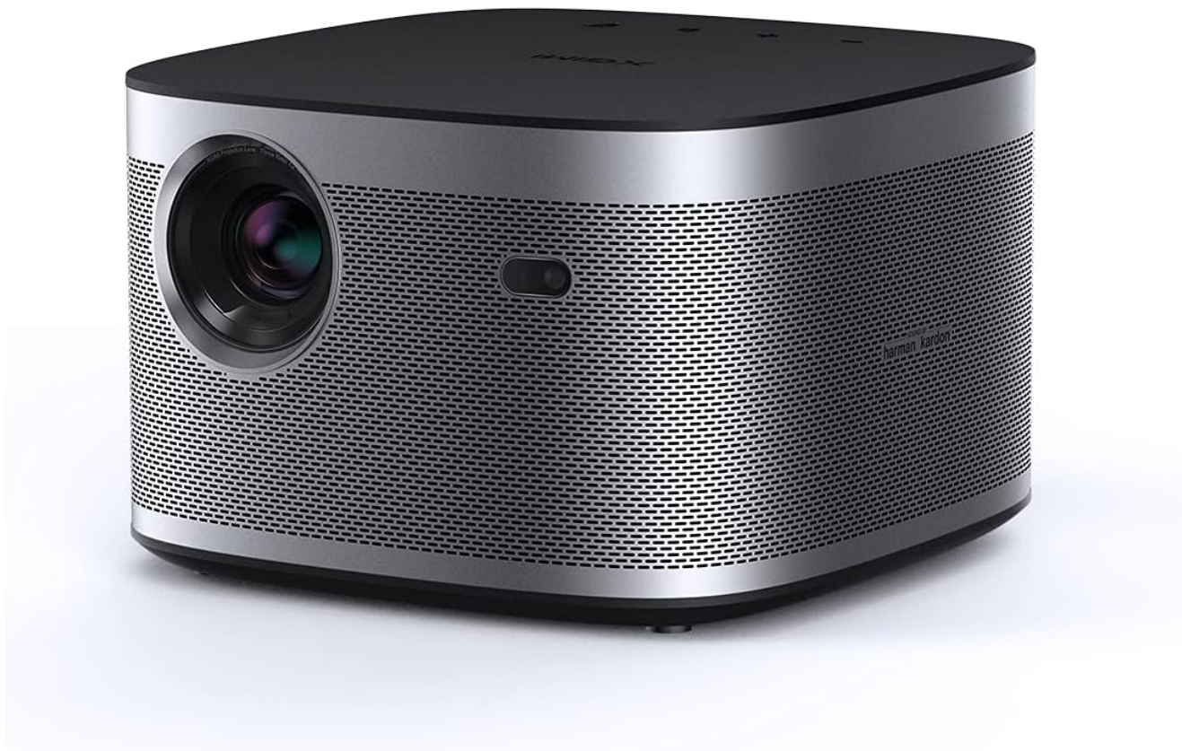
Image: Front view of the XGIMI HORIZON FHD Projector, showcasing its compact design and lens.