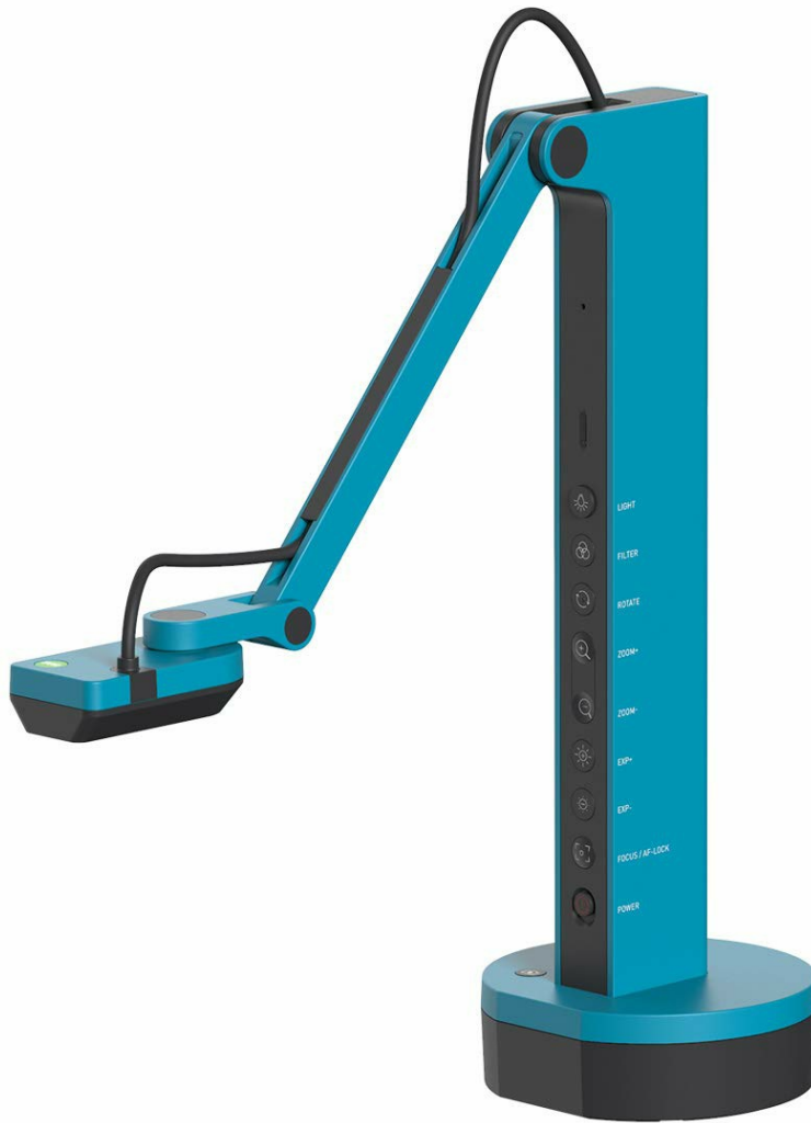
Image: The IPEVO VZ-X Wireless 8MP Document Camera, featuring its adjustable arm and base, in a vibrant blue color.