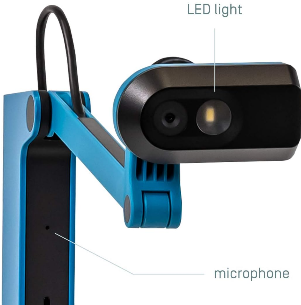
Image: A detailed view of the IPEVO VZ-X camera head, highlighting the integrated LED light and microphone for enhanced capture quality.