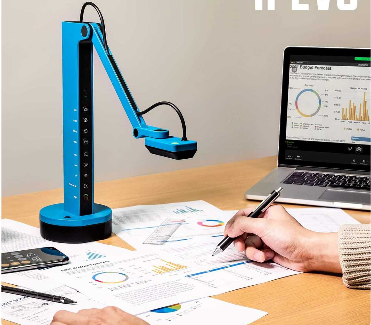
Image: The IPEVO VZ-X Document Camera is positioned on a desk, projecting a book's content onto a large display screen, demonstrating its use in a presentation or teaching environment.