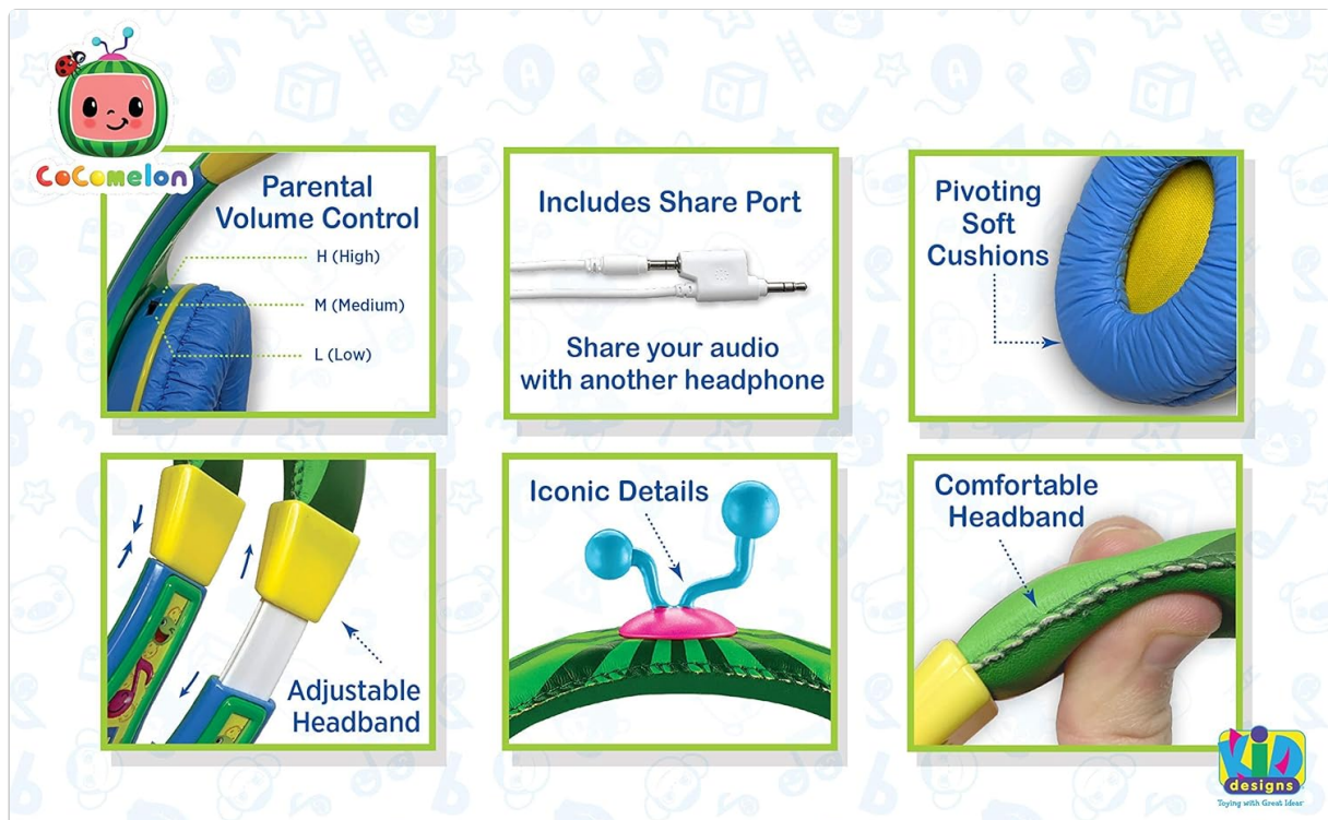
Figure 2: Key features of the COCOMELON headphones, highlighting the adjustable headband, soft ear cushions, parental volume control, and share port.