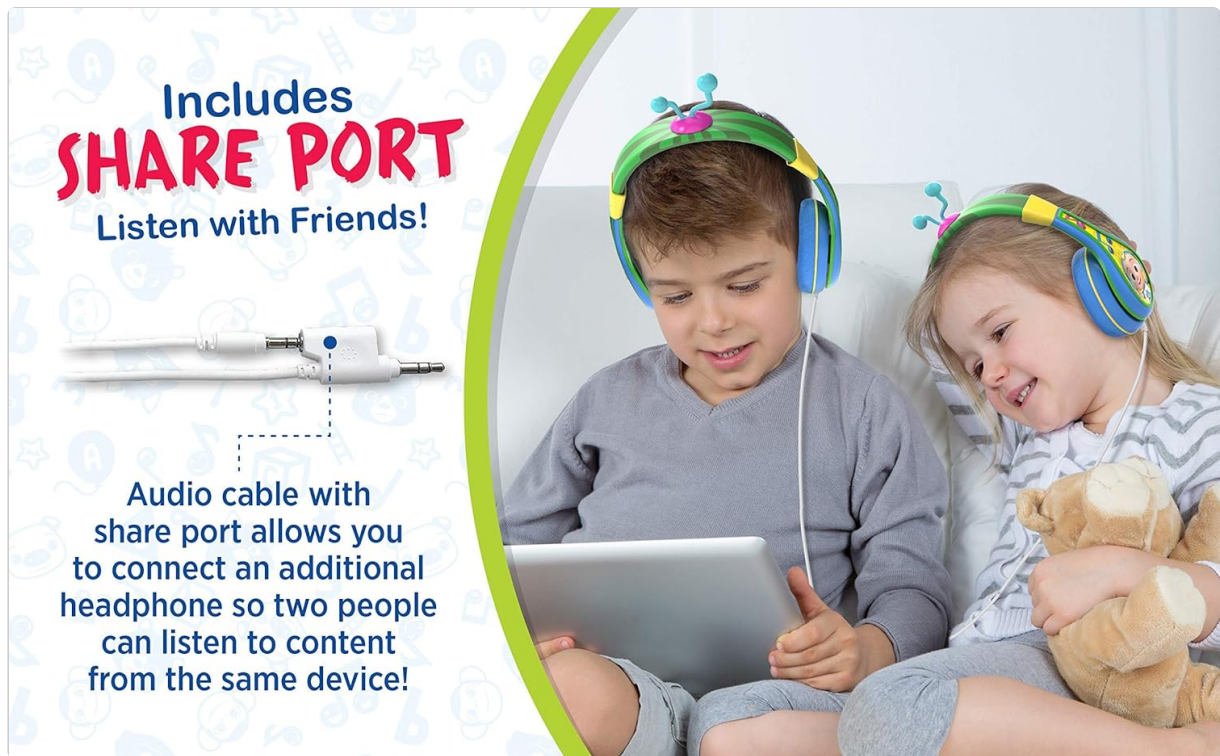
Figure 5: Illustration of the share port in use, enabling two users to listen to the same audio from one device.