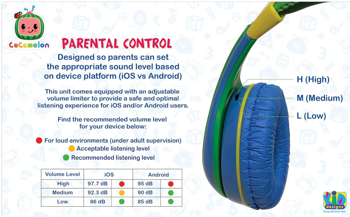
Figure 4: Detailed view of the parental volume control switch and a table indicating recommended volume levels for iOS and Android devices.