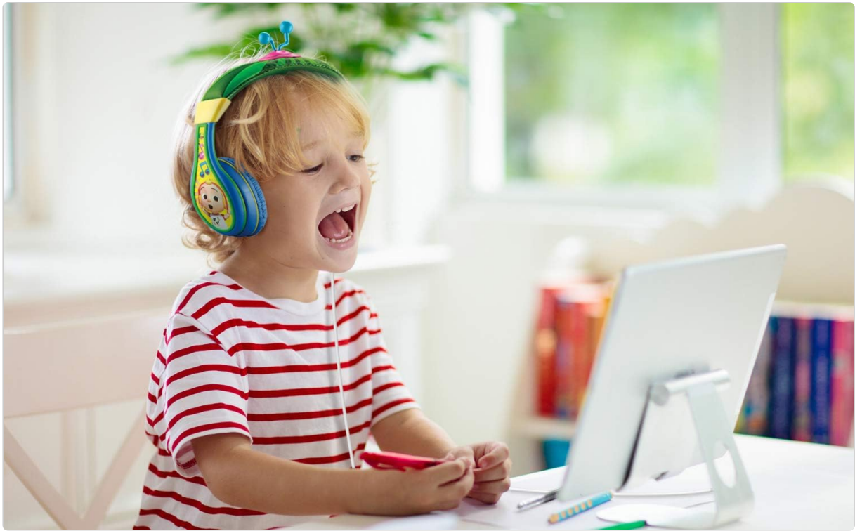
Figure 3: Child wearing the headphones, illustrating proper fit and use with a tablet.