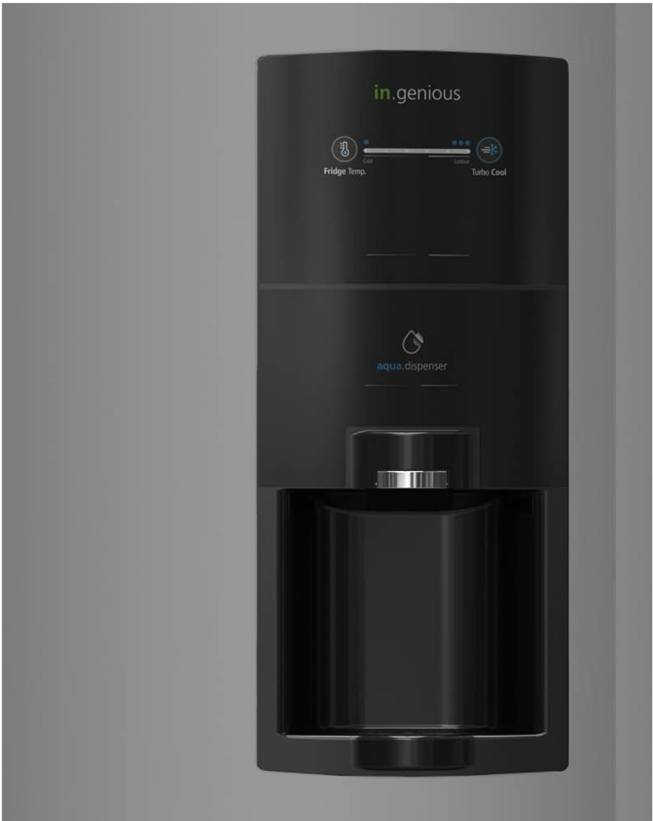
Figure 3.5: Control panel and water dispenser.

Your browser does not support the video tag.