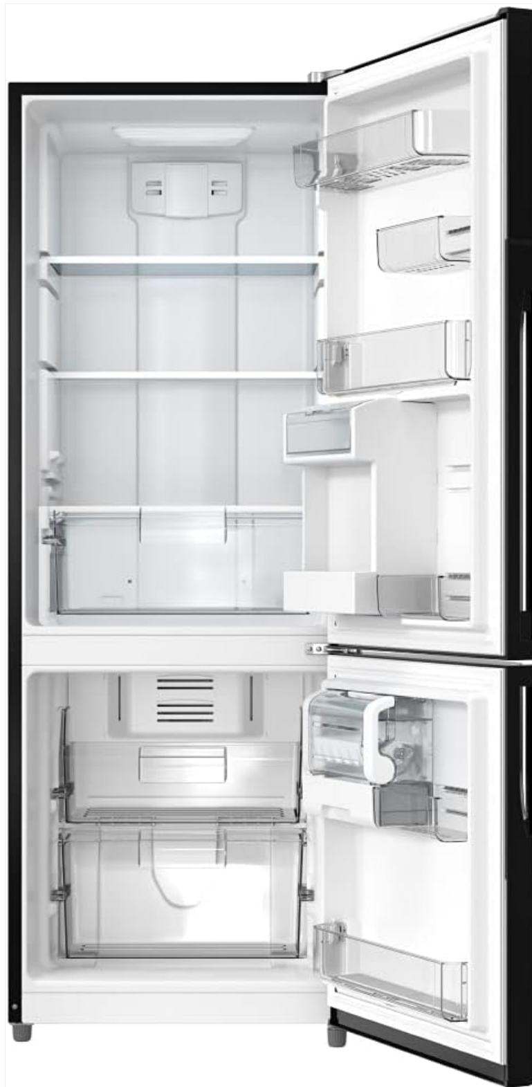
Figure 3.2: Interior layout of the refrigerator compartment.