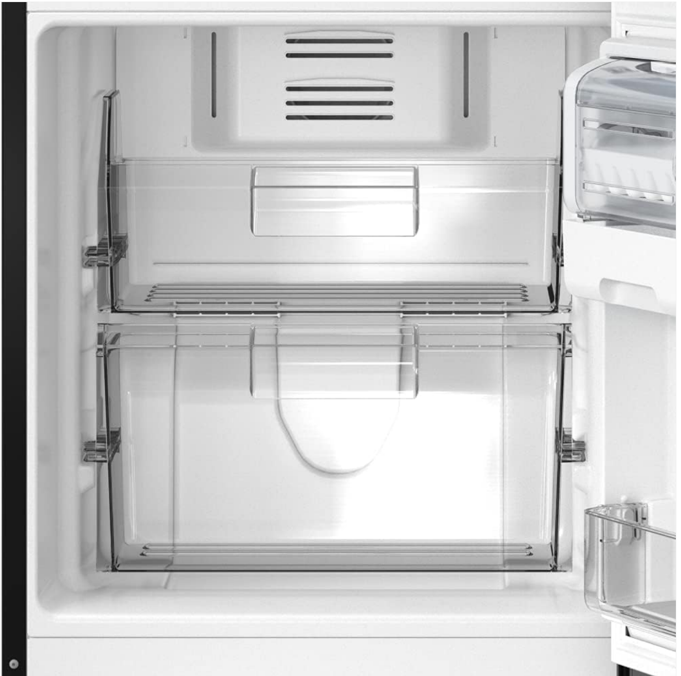
Figure 3.4: Detail of the humidity-controlled drawers.