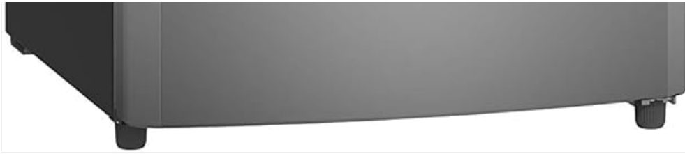
Figure 3.1: Exterior view of the Mabe RMB400IAMRE0 refrigerator.