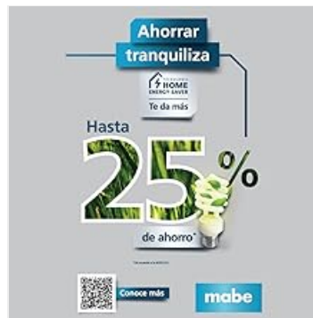
Figure 8.1: Energy efficiency information for the refrigerator.