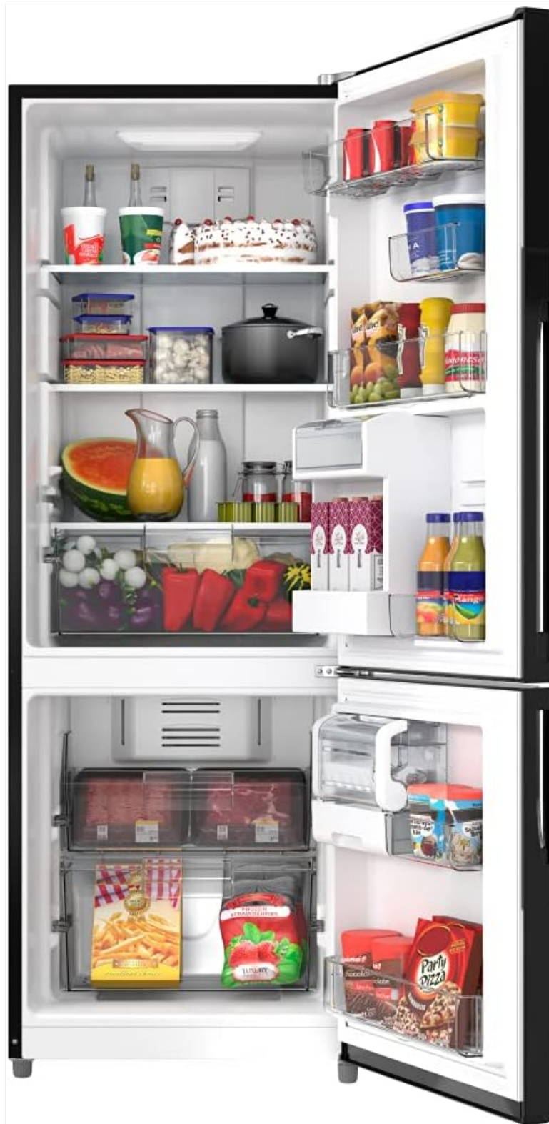
Figure 3.3: Refrigerator interior with food items, demonstrating storage capacity.