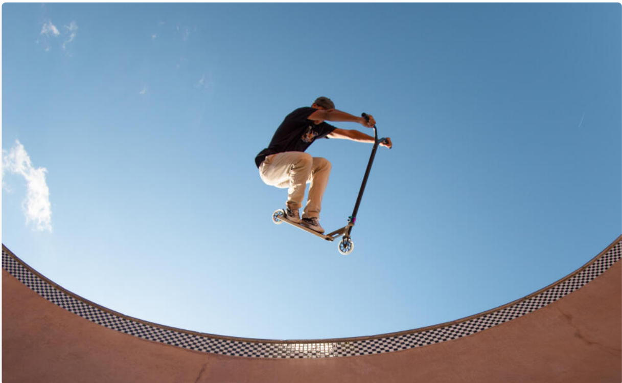
Image: General view of the Oxelo MID5 Kick Scooter, showcasing its design and features.

The oxelo MID5 Kick Scooter is engineered for children between 6 and 9 years old, with a recommended height range of 110-150 cm. It is designed for both daily use and recreational activities, providing a comfortable and easy-to-handle riding experience. Key features include a hand brake for effective speed control and a front suspension system to absorb road vibrations, ensuring a smoother and more enjoyable ride.