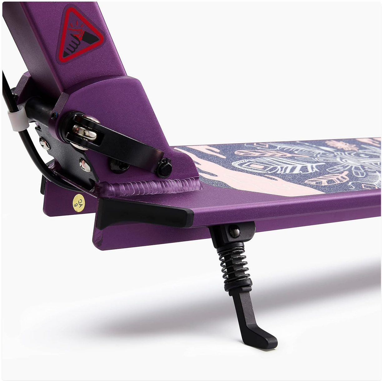
Image: The scooter in its folded state, demonstrating its compact design for storage and transport.