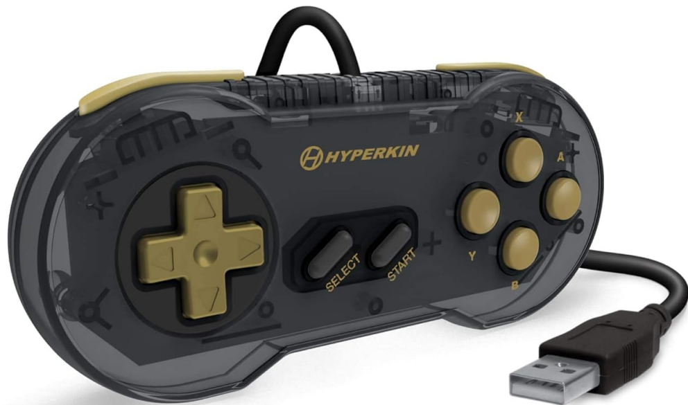
1 x Wired USB "Scout" Controller (10 Ft. Cable)

Image: The included wired USB "Scout" Controller with a 10 ft. cable.