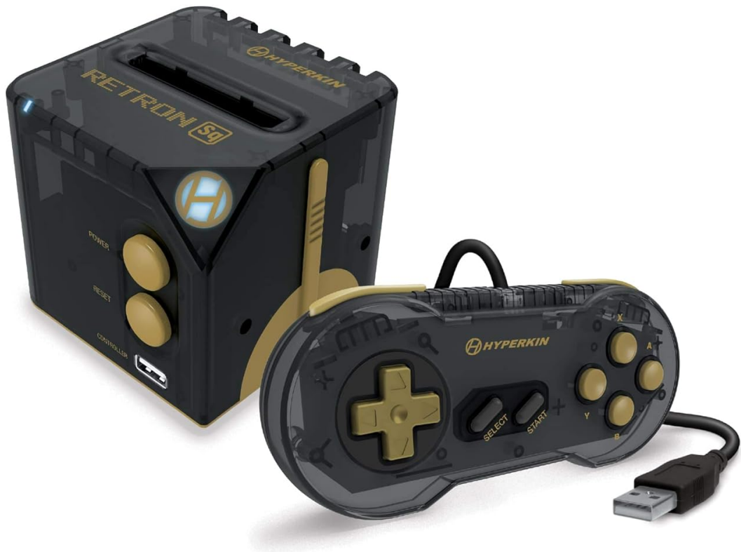
Image: The Hyperkin RetroN Sq console with its included wired controller.