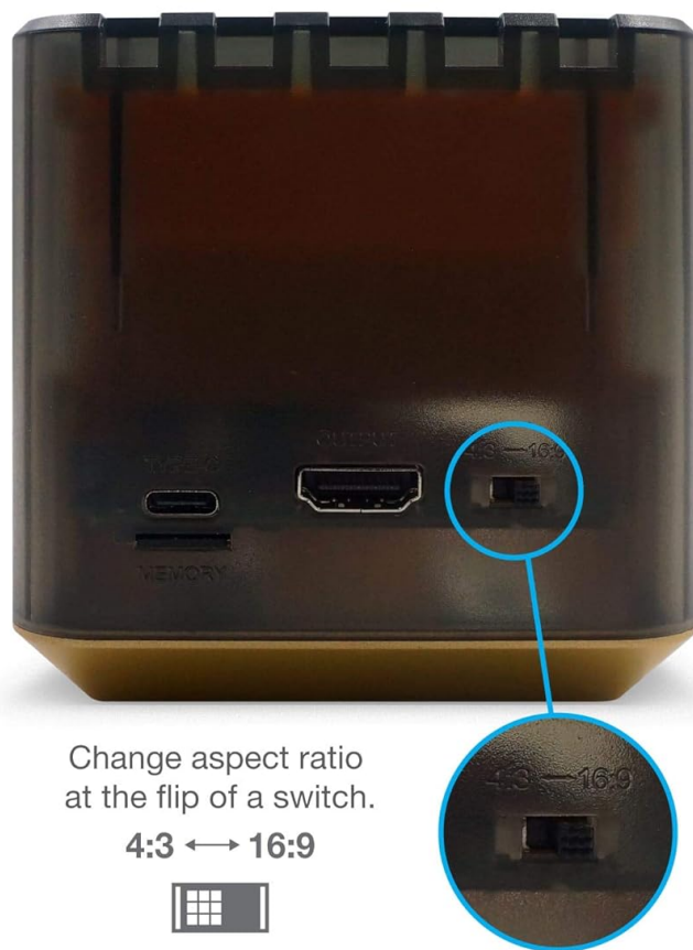
Image: The switch allowing users to toggle between 4:3 and 16:9 aspect ratios.