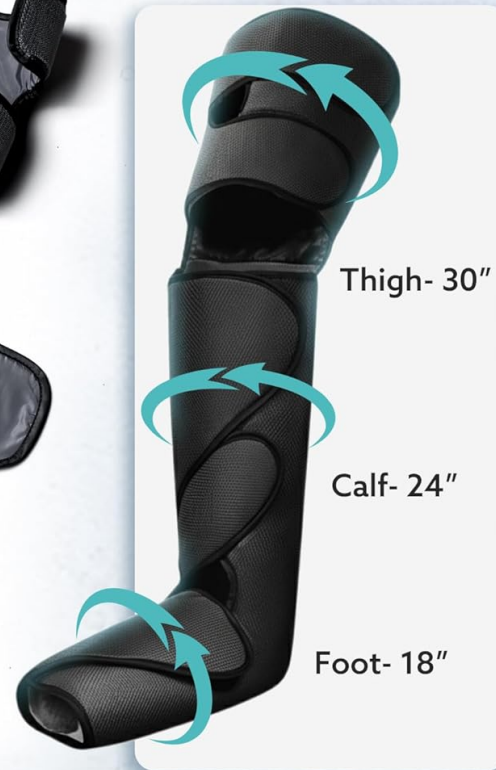
Image: Illustration showing the full leg compression design with 11 x 2 internal airbags for effective massage.