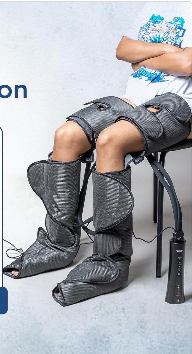
Image: Detailed view of the handheld controller with labeled buttons and indicators.

The handheld controller allows you to manage the device's functions. It features: