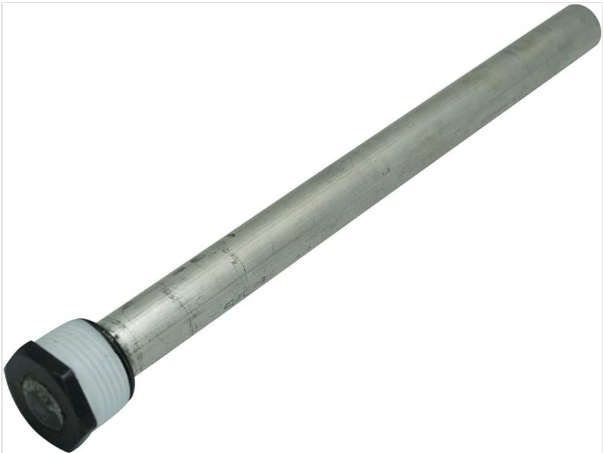
Image 2: Close-up view of the threaded end of the Suburban Magnesium Anode Rod, highlighting the white thread sealant.