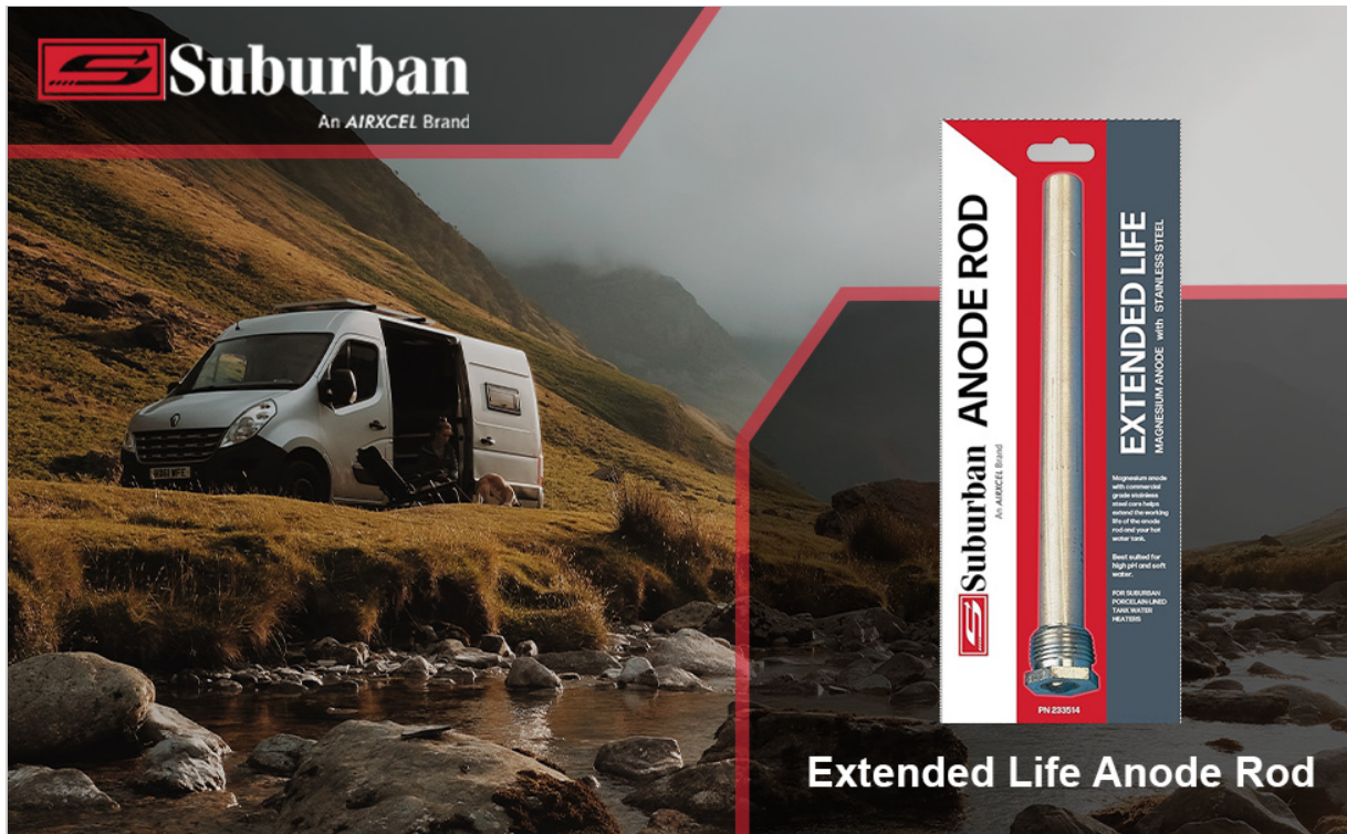
Image 4: The Suburban Extended Life Anode Rod in its retail packaging, emphasizing its role in extending water heater life.